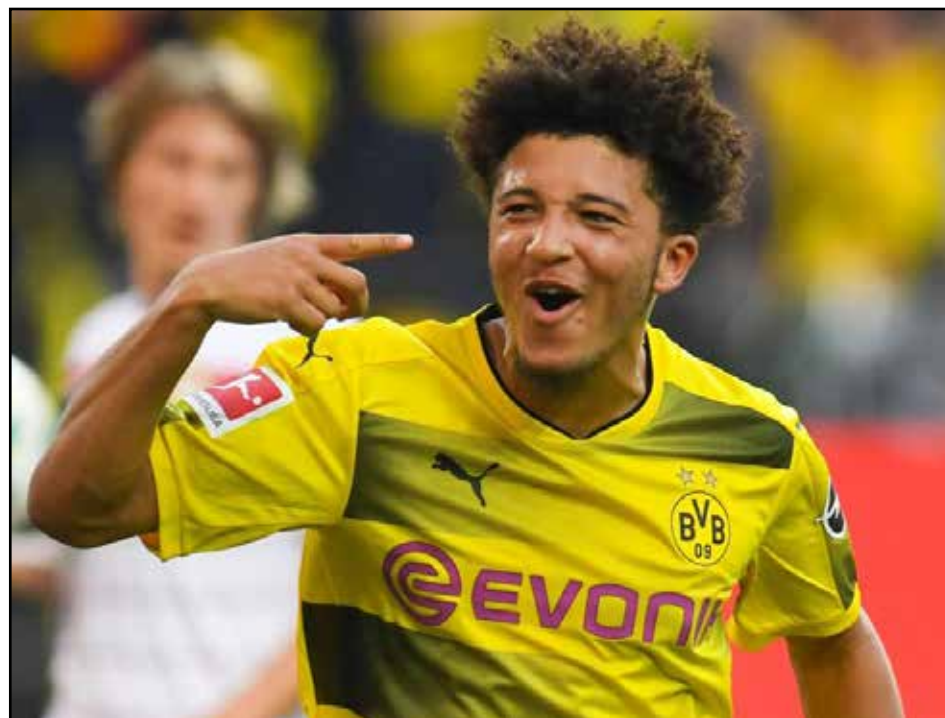
"If you really believe in yourself, you have to do what's best for you," - 18-year-old Jadon Sancho on his move to Borussia Dortmund

"Moving away from home was the biggest challenge, leaving my mum and my sisters behind. I miss them a lot. But I wanted to do what was best for me, and that was what I did. It was very tough, especially