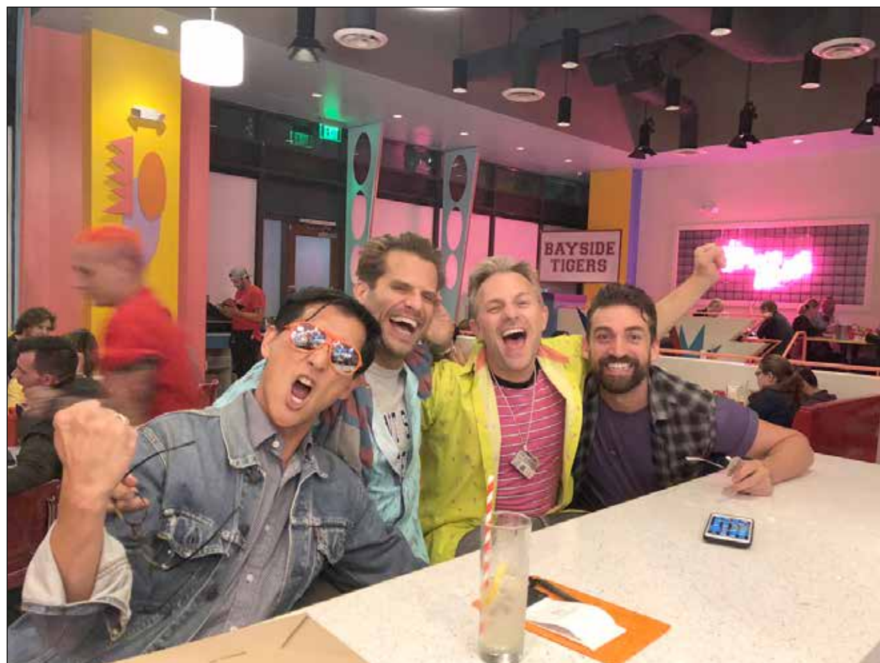
GOOD TIMES: the Saved By The Max pop-up restaurant is a blast - but expect a long waiting list

Well some 20 years later you can now relive the Saved By The Bell experience, thanks to the pop-up (meaning temporary) diner SAVED BY THE MAX in Hollywood (www.