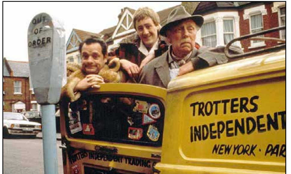
David Jason, Nicholas Lyndhurst and Lennard Pearce in the original TV show