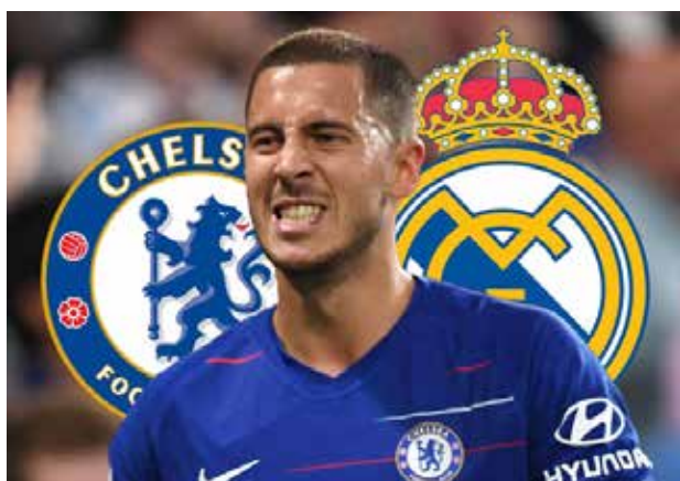
HEAD TURNED? The Belgian star has admitted he is tempted by the prospect of a move to Real

Hazard's contract at Stamford Bridge expires in June 2020 and reports in Spain claim Real Madrid are hopeful that Chelsea may sell at the end of this season for £70m rather than risk losing their star player a year later.