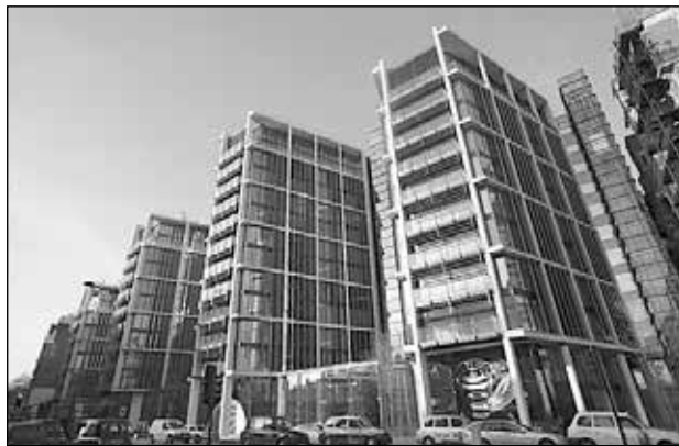
ONE HYDE PARK: developer Nick Candy kept the penthouse, which has just two parking spaces, for himself

Last week it was reported that the British billionaire had sold the Knightsbridge penthouse to a "mystery buyer" for £160m, making it Britain's most expensive apartment. But it later emerged that that Candy was actually restructuring the ownership, selling the property to a company that he controls in order to refinance it with the loan, after moving to a new home in Chelsea with his wife, actress Holly Valance.