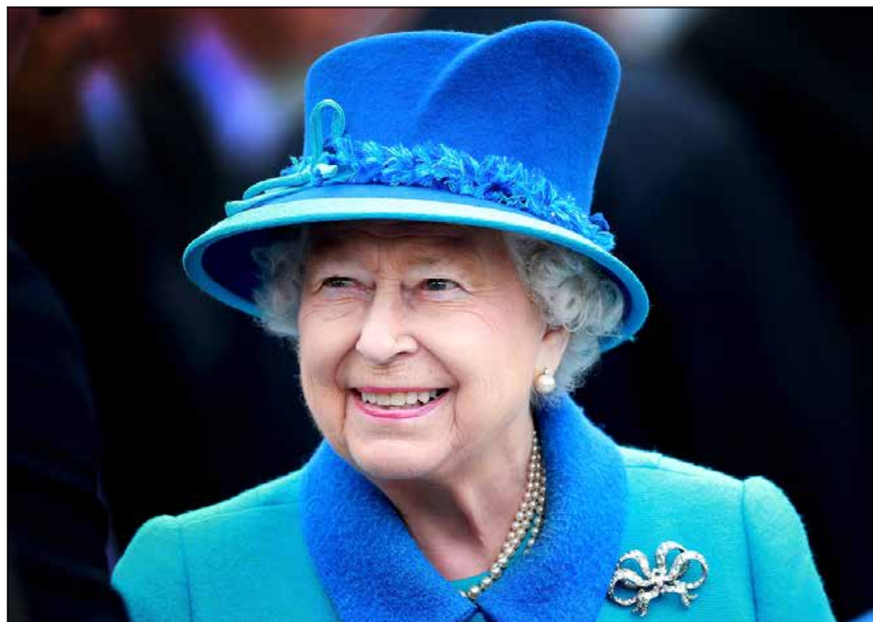
INDEFATIGABLE? Abdication has been ruled out for Queen Elizabeth II, barring illness

minister. One of her predecessors, Sir John Major, summed up the value of the Queen's experience and wisdom in an interview six years ago, before her Diamond Jubilee.