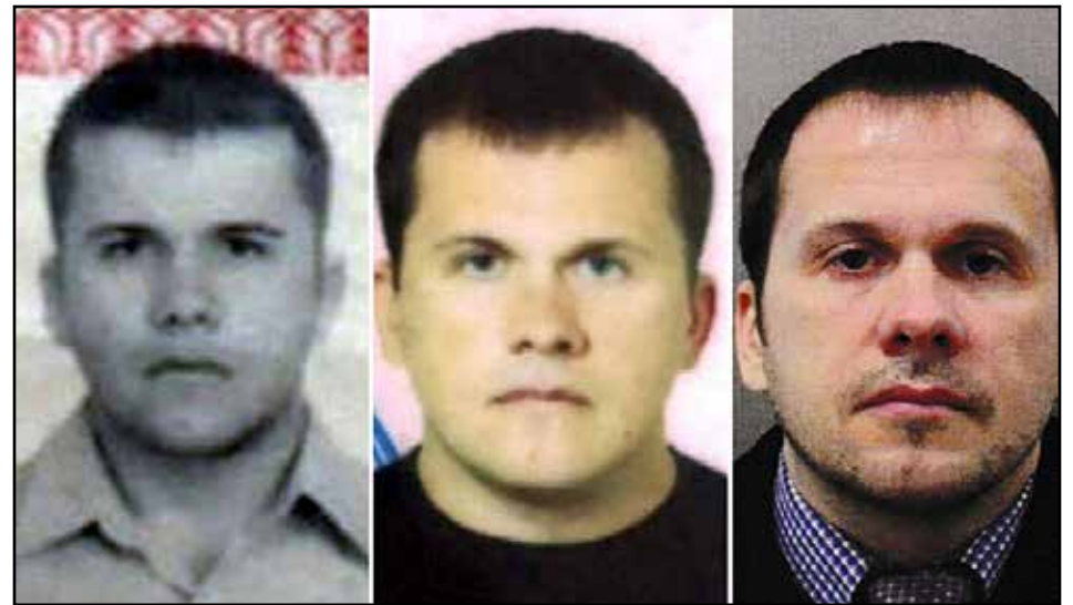
Alexander Mishkin (aka Alexander Petrov) graduated from one of Russia's elite military academies and was recruited by the GRU in 2010, it has emerged

Following the poisoning of the Skripals, which they survived, Dawn Sturgess, 44, died after she came into contact with the poison, which her partner found