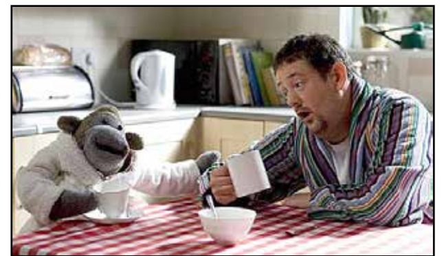
GOOD NEWS, BAD NEWS: The French don't like our tea-drinking ways...but they love our humor

"And when it comes to winding up the French, we've been at it for 1,000 years, the