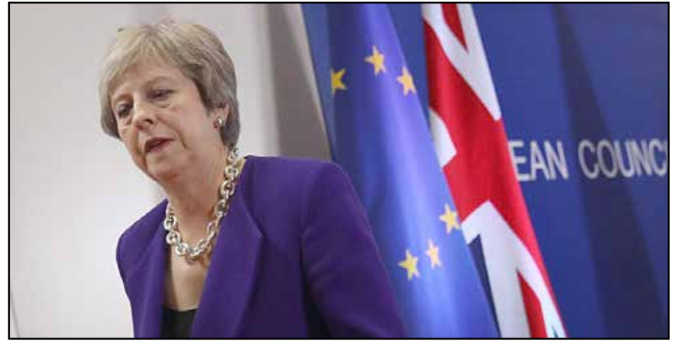
ENDGAME? The Prime Minister is staggering from crisis to crisis as Brexit looms

There were also suggestions Tory Leave supporters are manoeuvring to remove Mrs May. One ex-minister said: "There's a good