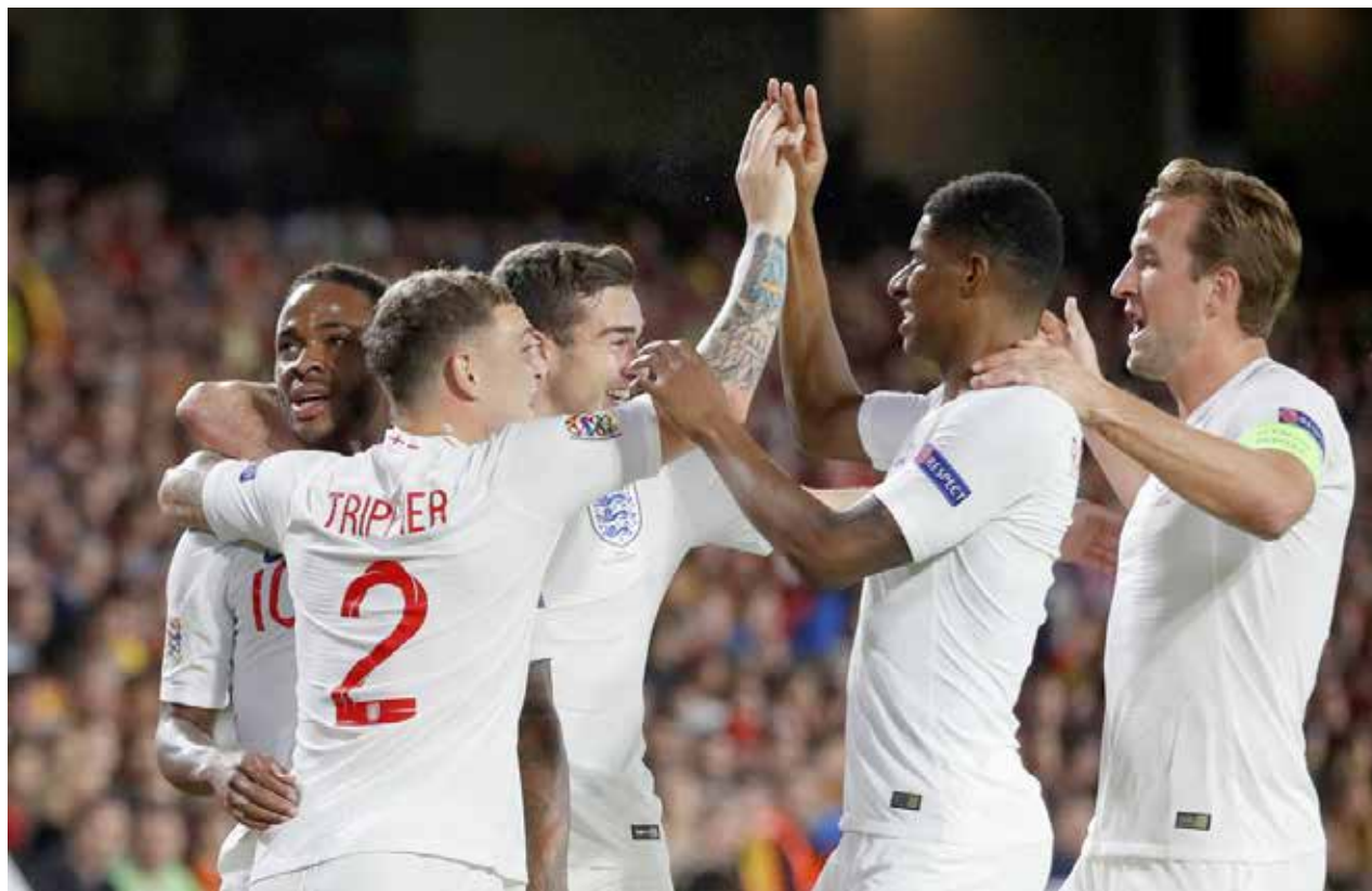
WHO DARES WINS? England stunned the Spanish with a 3-2 victory in Seville Monday night

Southgate, whose side reached the semi-finals