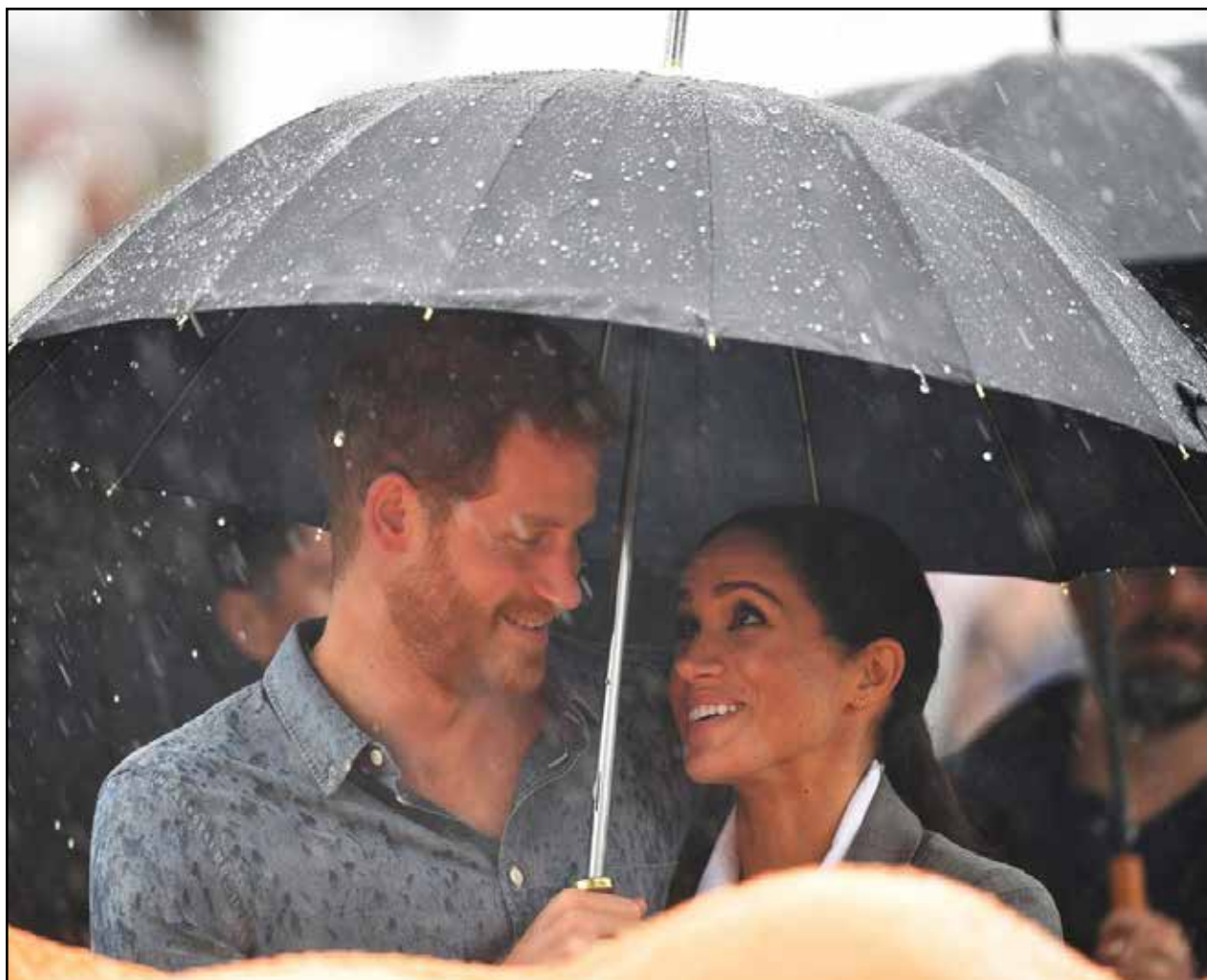
THE LOOK OF LOVE: Harry and Meghan in Victoria Park, Dubbo, outside Sydney this week

Kensington Palace said the couple would press ahead with plans to visit Fiji and Tonga next week after taking medical advice, even though