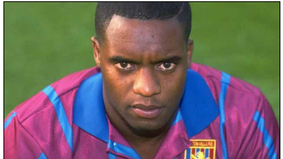
DALIAN ATKINSON: the former Aston Villa star died after a confrontation with police

"The investigation gathered evidence which indicates that police contact with Mr Atkinson involved the use of a Taser, followed