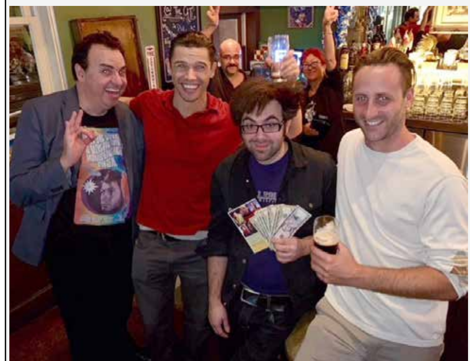
Tap That triumphed at the latest Brits in LA Pub Quiz on Tuesday, seeing off nine other teams to take the $75 first prize.

But everyone was a winner at the Cat and Fiddle as each player in attendance left with memorabilia from new movie Hunter Killer.