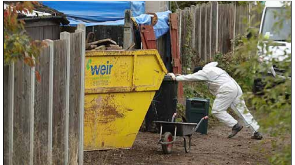
Police have returned to the former home of John Cannan's mother in the West Midlands and have dug up the garden searching for the remains of Suzy Lamplugh

Police were heard grinding through concrete in the garden and officers could be seen loading masonry into skips while forensic science officers scoured