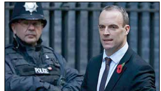
RAAB: "the end is now firmly in sight"

Mr Raab made the claim in a letter to the Commons