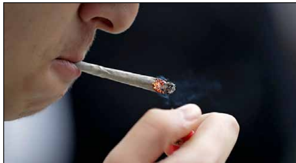
HIGH HOPES? The UK's chief medical adviser recently concluded there is evidence medicinal cannabis has therapeutic benefits.

The Advisory Council on the Misuse of Drugs, which carried out the second part of the review, ruled that doctors should be able to prescribe