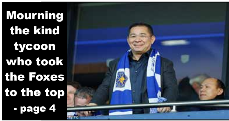
Mourning the kind tycoon who took the Foxes to the top - page 4

California's British Accent™ - Since 1984