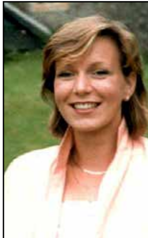
Suzy Lamplugh disappeared in 1986