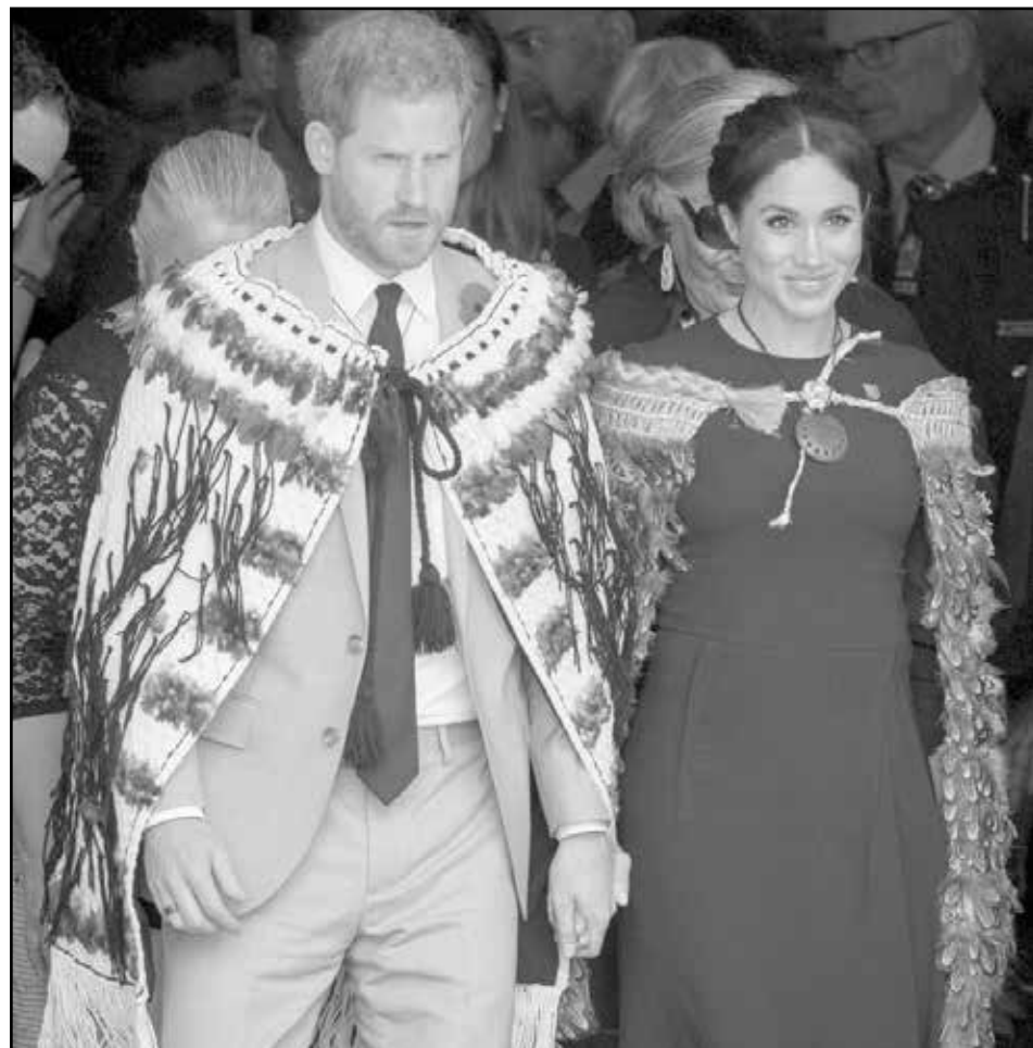
END OF THE TOUR: Prince Harry told locals in Rotorua on New Zealand's North Island: "Thank you for the beautiful cloak you have so kindly gifted to myself and the duchess."

"I don't see myself as a hero, but I am very touched by all of the comments."