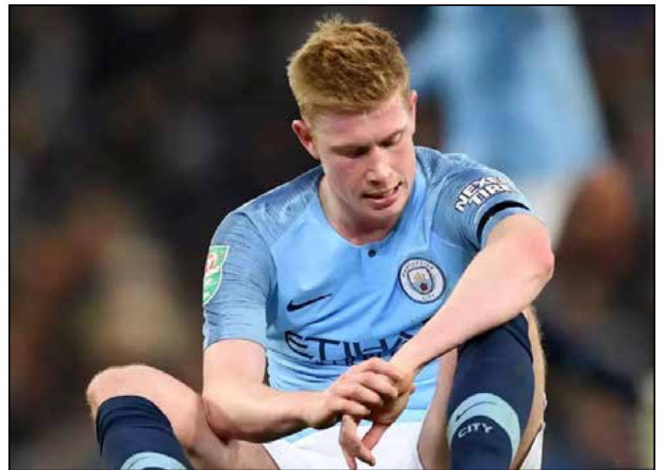
DE BRUYNE: impressive display for City

He had played only 150 minutes in total in 2018-19 before this game but did not look tired, as he