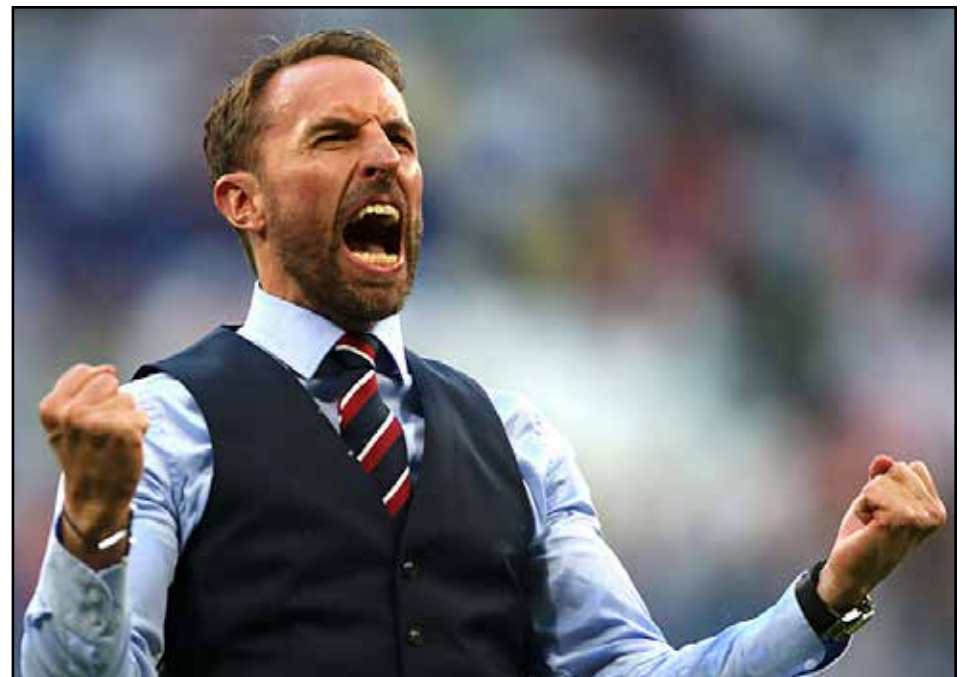
SOUTHGATE: "What this year has shown us is that you mustn't be weighed down by previous beliefs..."

in the last four. The semi-finals and final in Portugal in June will decide the inaugural champions.