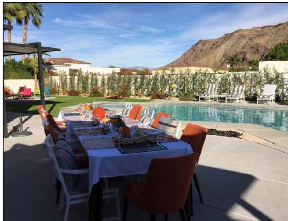
THANKSGIVING IN PALM SPRINGS: we were thankful for the setting...

But now restaurants including BiLA's own Cecconi's on Robertson and local supermarkets are catching up with more plant protein-based foods it's getting easier and easier to live a vegan/vegetarian lifestyle. I hear even "Iceland" back home is stocking up.