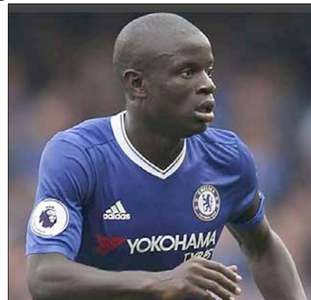
FIVE YEAR DEAL: N'Golo Kante