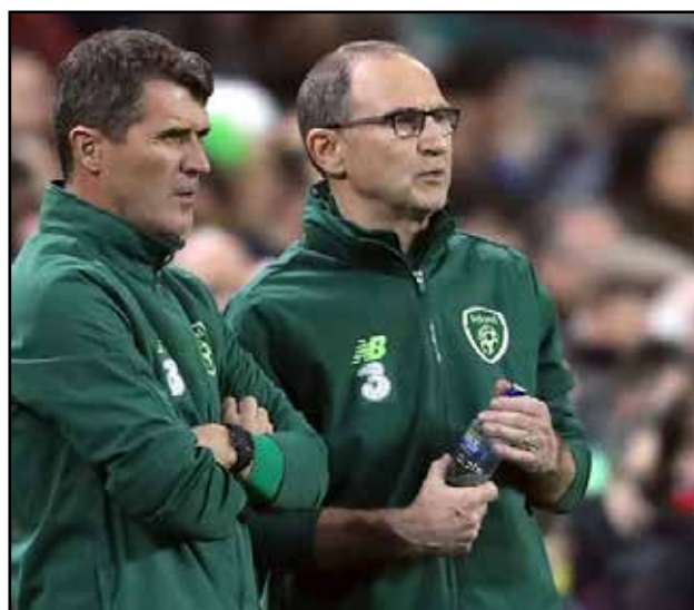
ON THEIR WAY: Roy Keane and Martin O'Neill

McCarthy's first spell as manager began in 1996 when he replaced Jack Charlton and gradually introduced a more attractive style of play