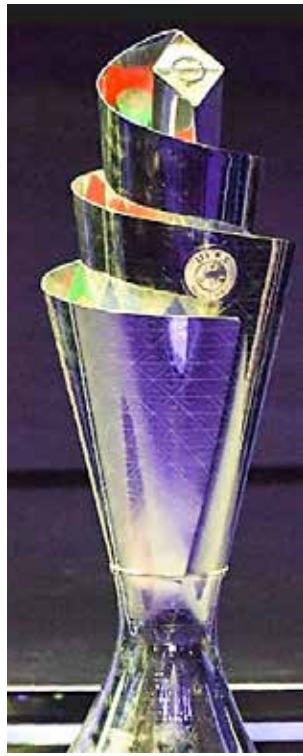
TALL ORDER: England, Holland, Switzerland and Portugal will compete for the Nations League trophy next summer

At 2ft 4in high, the UEFA Nations League trophy is almost exactly twice the size of the iconic World Cup. Even the Henri Delaunay Trophy, awarded to the European champions and remodelled in 2008 because it was considered too small, is now dwarfed by 4in. Southgate managed to avoid answering whether he knew what the Nations League trophy even looked like, but its stylish spiralling curves are very much the focus of the young players who have lifted the whole nation by reaching their second semi-final in the space of 11 months. Because they have been winning competitions at junior