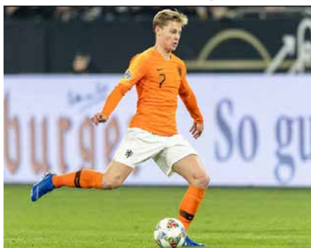
RISING STAR: Ajax midfielder Frenkie de Jong

City see De Jong as the long-term successor to Fernandinho, who the manager has described as "extraordinary" this season. The Brazilian midfielder, 33, has started all of City's 12 Premier League games, and Guardiola has acknowledged that he will have to be rested