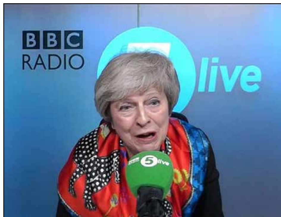
MAY TO DECEMBER? The Prime Minister took questions on the BBC on Thursday

Asked what was a more likely outcome in such an event - a no-deal exit or the UK remaining in the EU - she said "from my point of view, personally, there is no