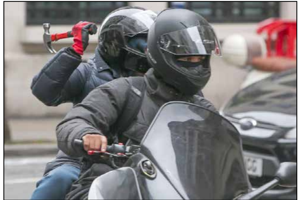
EPIDEMIC: there were more than 12,000 bike snatch thefts in London last year

Legal experts warned that the Met was opening itself to civil and even criminal claims over disproportionate use of force, and Diane Abbott, the shadow home secretary, said that the tactic was "extremely