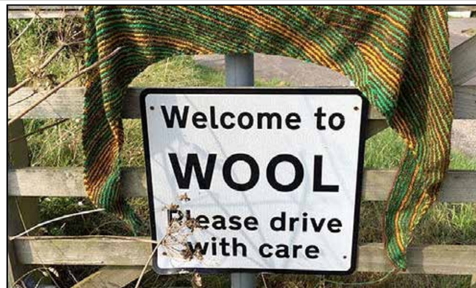
WOOLLY MINDED? The Dorset village dates back to the 11th century

to social media to mock Ms Allen's suggestion.