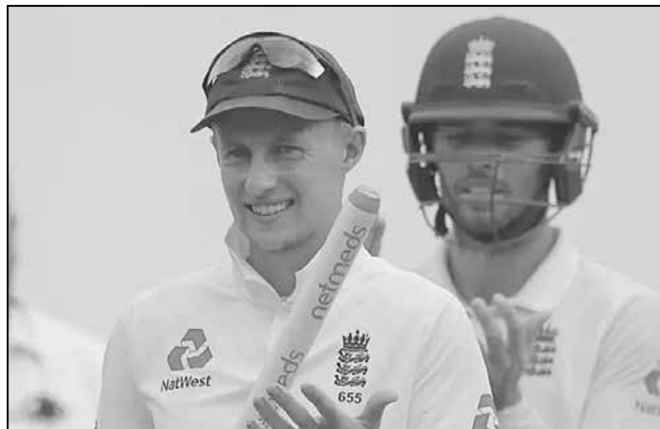
GROWING IN STATURE: England skipper Joe Root