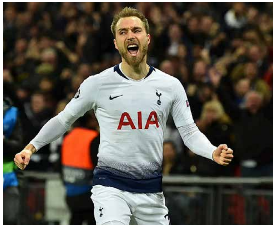
Eriksen's 80th minute strike secured a win for Spurs on Wednesday night

Spurs had no room for manoeuvre when presented with two home games against PSV Eindhoven and Inter Milan to give themselves