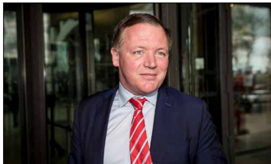
Damian Collins, chair of the DCMS committee, forced an American CEO to hand over damaging documents using the Commons serjeant-at-arms