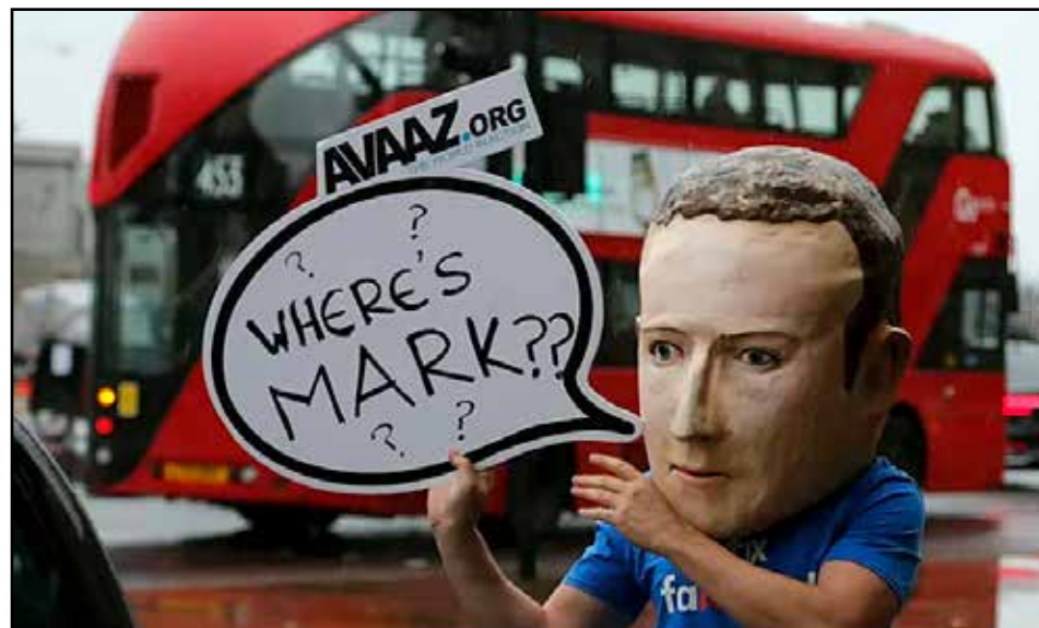
An activist wearing a Facebook CEO Mark Zuckerberg mask stands outside the meeting in Westminster

"An engineer at Facebook notified the company in October 2014 that entities with Russian IP addresses had been using a Pinterest API key to pull over 3 billion data points a day through the