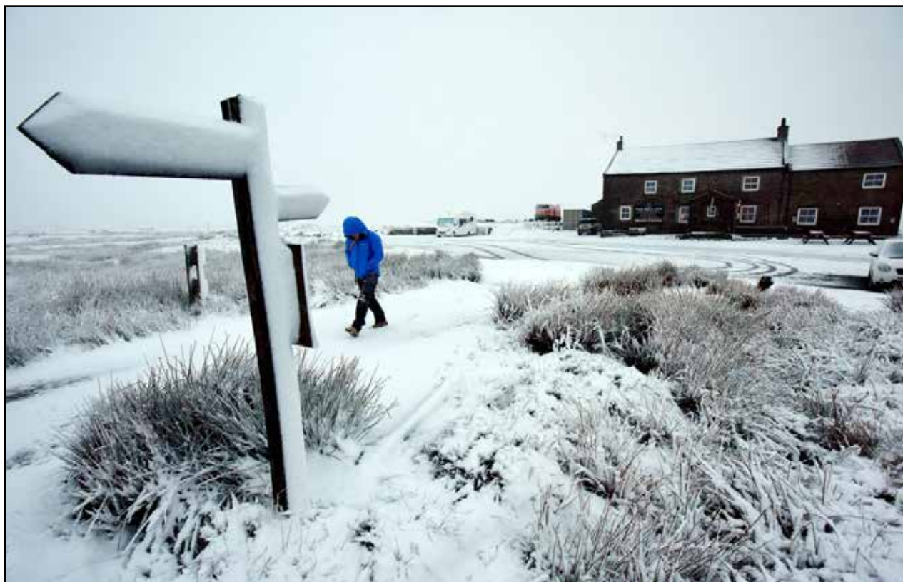
BITTER ON TAP: Derbyshire's Snake Pass saw its first snowfall of the winter on Tuesday

Low-pressure north of the British Isles will help drive the bitter flow as forecast models reveal winter will kick off to