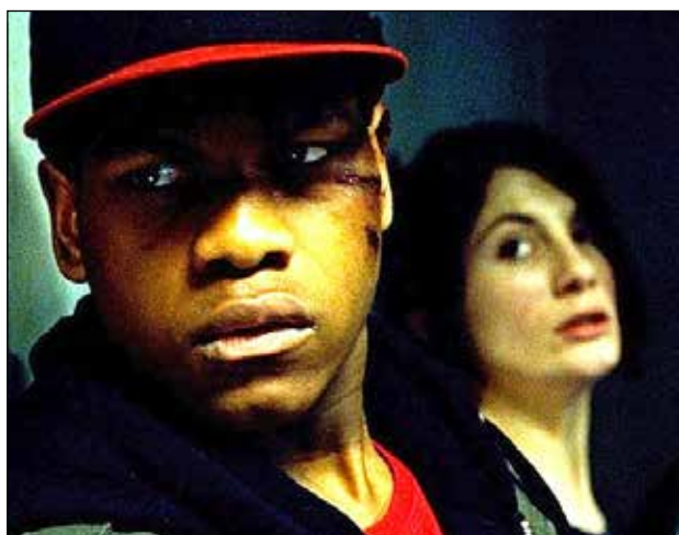
John and Jodie starred in Attack the Block

However, there's bad news for anyone wishing to see Boyega make an appearance in an episode of the venerable show, as