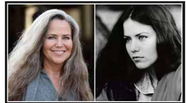
THEN AND NOW: Koo Stark today and (right) how she looked when dating Prince Andrew