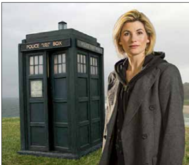
Look at her now: Jodie Whittaker as Doctor Who

the actor all but dismissed the idea. But he did say he'd love to work with Whittaker again.