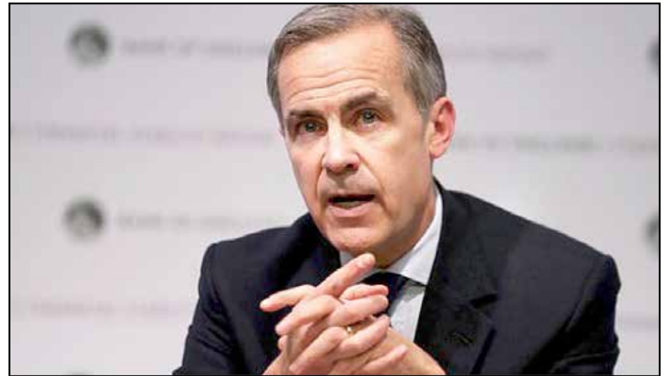
Mark Carney, the Bank of England governor, said that Britain was not ready for a no-deal Brexit. His analysis was dismissed as 'fraudulent' by Brexiteers