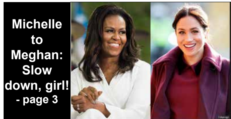
Michelle to Meghan: Slow down, girl! - page 3

California's British Accent™ - Since 1984