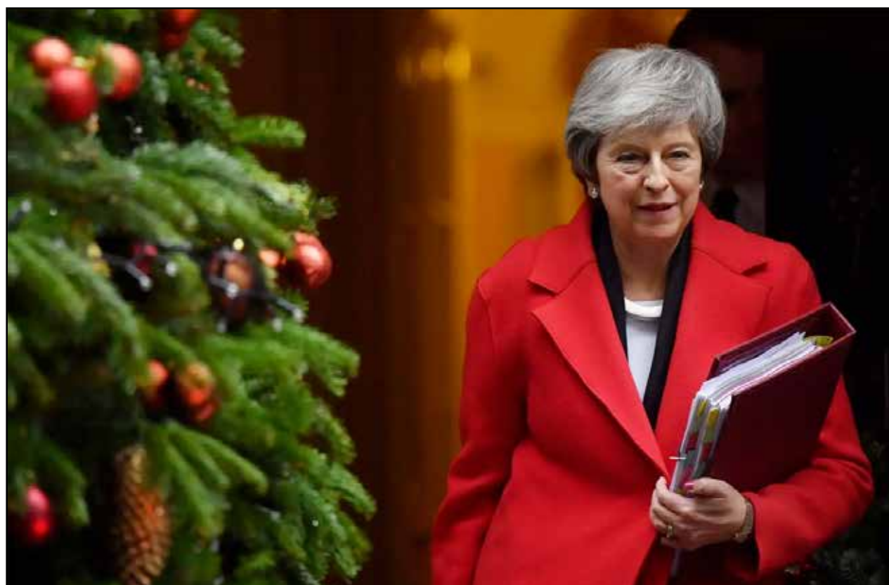
NOT MUCH CHRISTMAS CHEER: Prime Minister May's government was found in contempt of Parliament this week for refusing to release its full legal advice on the deal with the EU

At press time Mrs May and her allies were stepping up their bid to persuade Tory MPs to back her deal. Chief Whip Julian Smith on Wednesday night addressed Jacob Rees-Mogg's European Research Group of Brexiteers to put the Government's case,