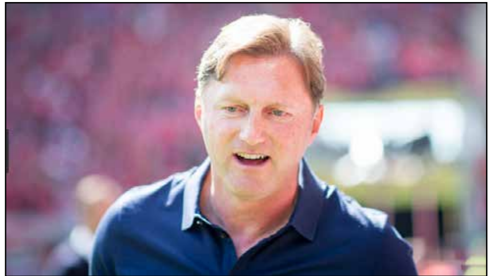
Ralph Hasenhuttl: impressive showing with RB Leipzig

"In the second half, we showed desire to go in front. It was fantastic work from the boys. The only way to play these teams is you have to run more than them and when you have your chances take them. We have to maintain these standards."