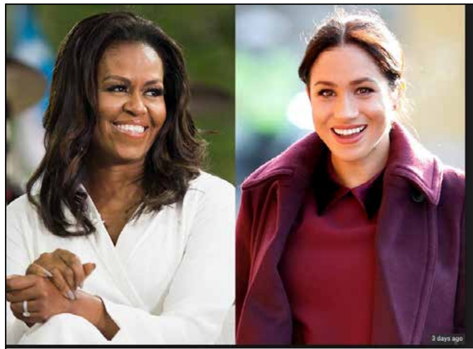
FRIENDLY ADVICE: The Obamas are known to be close to the Duke and Duchess

There have been allegations that Meghan upset the Royal Family when she demanded that air fresheners were sprayed inside Windsor Chapel at her wedding. Other reports claim she