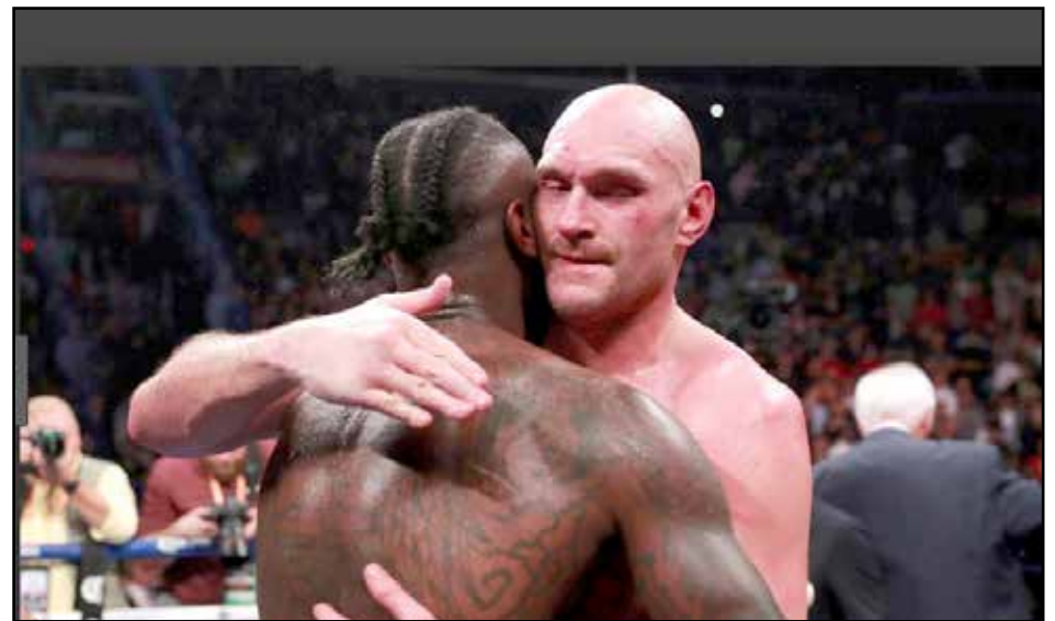
Wilder and Fury fought to a thrilling draw in downtown LA last weekend

"It's only right for us to go back in and do it