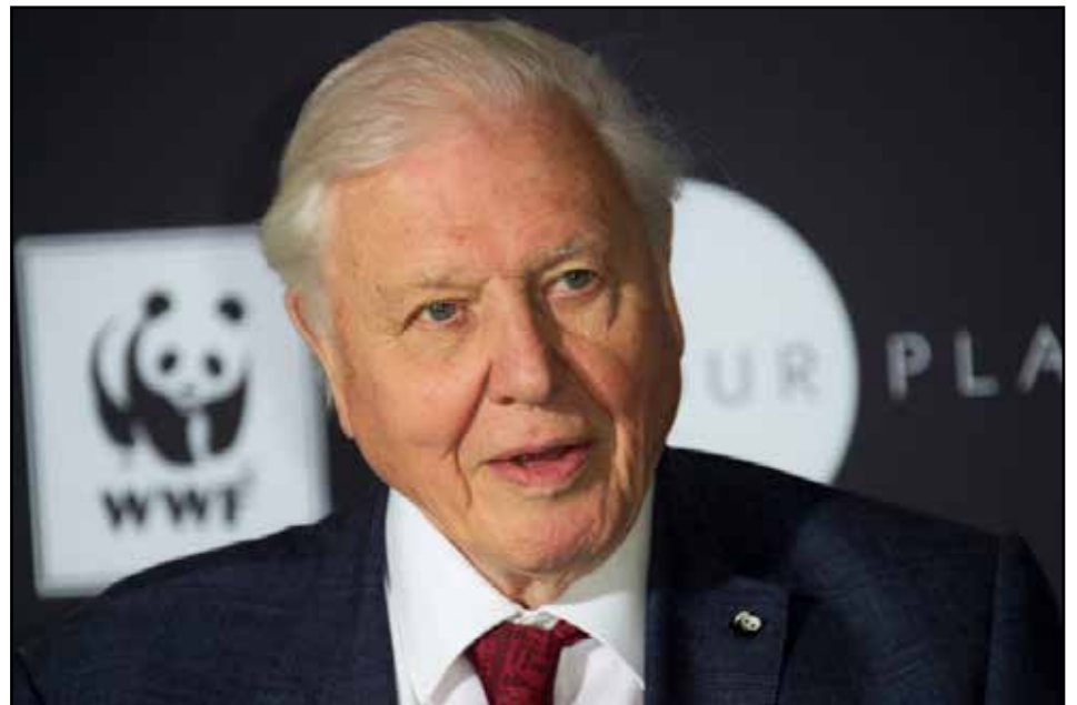
"Leaders of the world, you must lead," Sir David told the meeting in Poland

"Climate action is not just the right thing to do, it makes social and economic sense," he said, pointing to how action to cut emissions will curb air pollution deaths and generate millions of jobs and trillions of dollars. Four former presidents