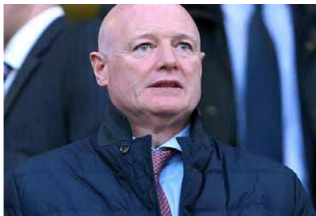
Peter Kenyon has been the CEO at both Manchester United and Chelsea

Premier League checks and processes when clubs change hands take around