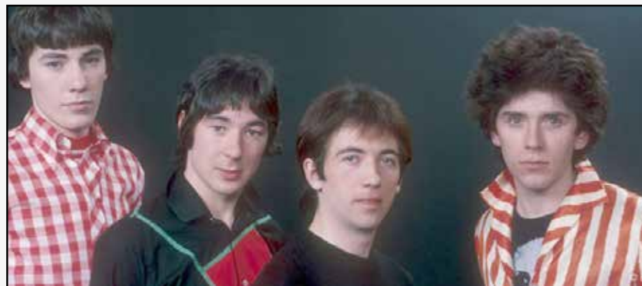
PUNK HEYDAY: John Maher, Steve Diggle, Pete Shelley and Steve Garvey founded The Buzzcocks in Bolton in 1976

Buzzcocks lead singer Pete Shelley has died at 63 of a suspected heart attack.