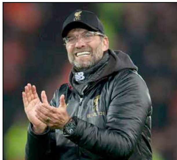
"If I knew Alisson was this good I would have paid double," said Klopp of his goalkeeper

"If I knew Alisson was this good I would have paid double," said Klopp. "The goal Mo scored -