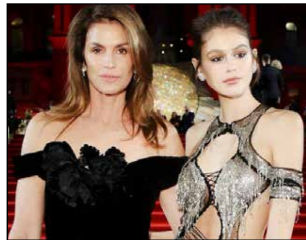
GOOD GENES: rising model Kaia Gerber with proud mum Cindy Crawford