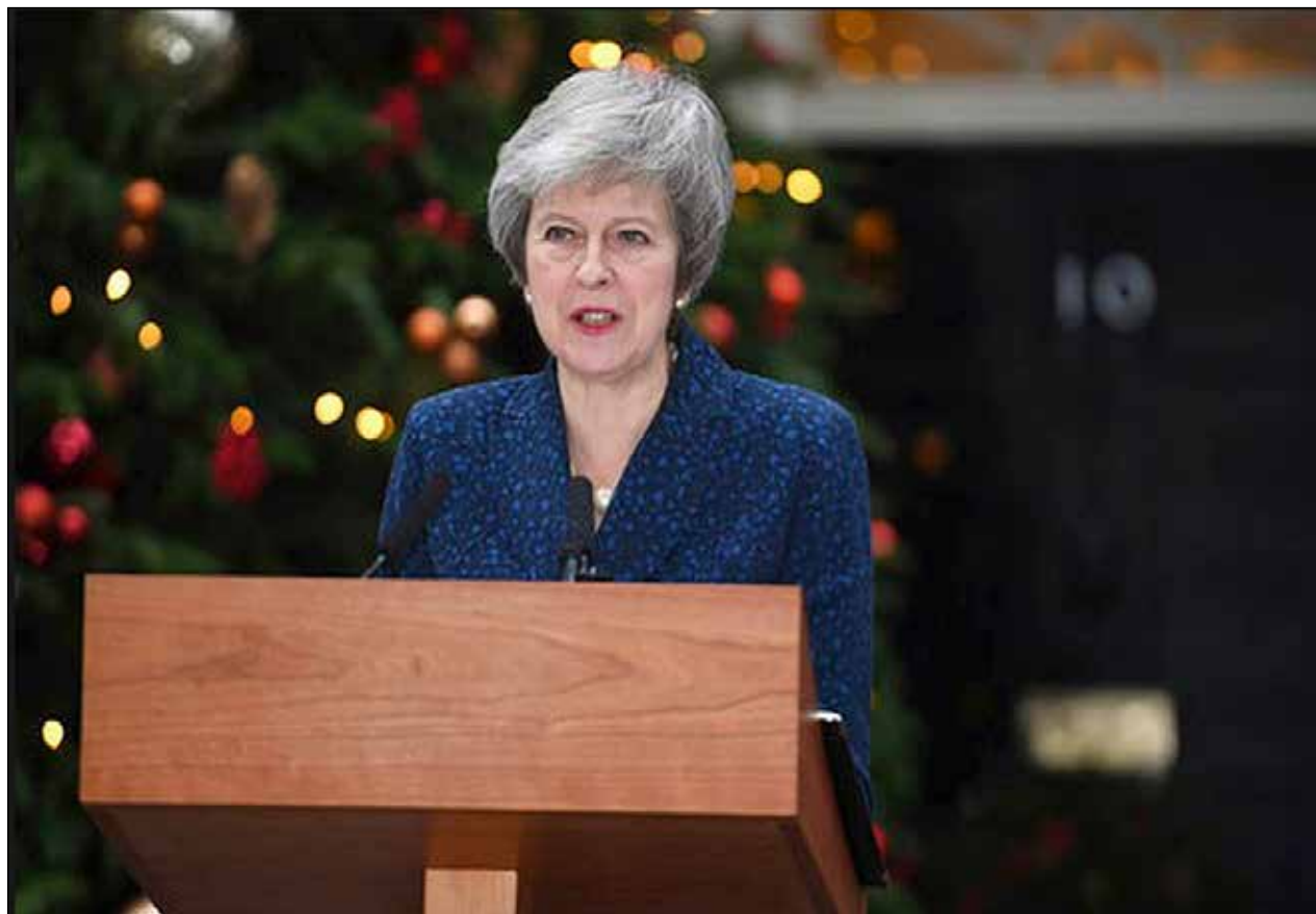
TEARFUL THERESA: an emotional May said she will step down as Tory leader before the next election

Conservative MPs demanded changes to the backstop to make it clear that it could not last forever, and the UK could terminate the