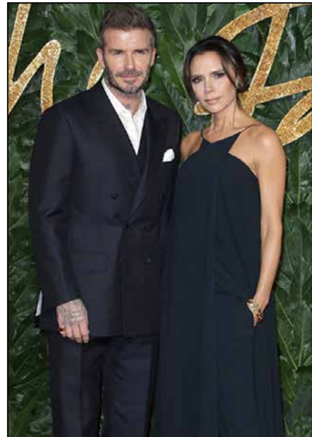
THE BECKHAMS: David looked dapper in a black double-breasted suit