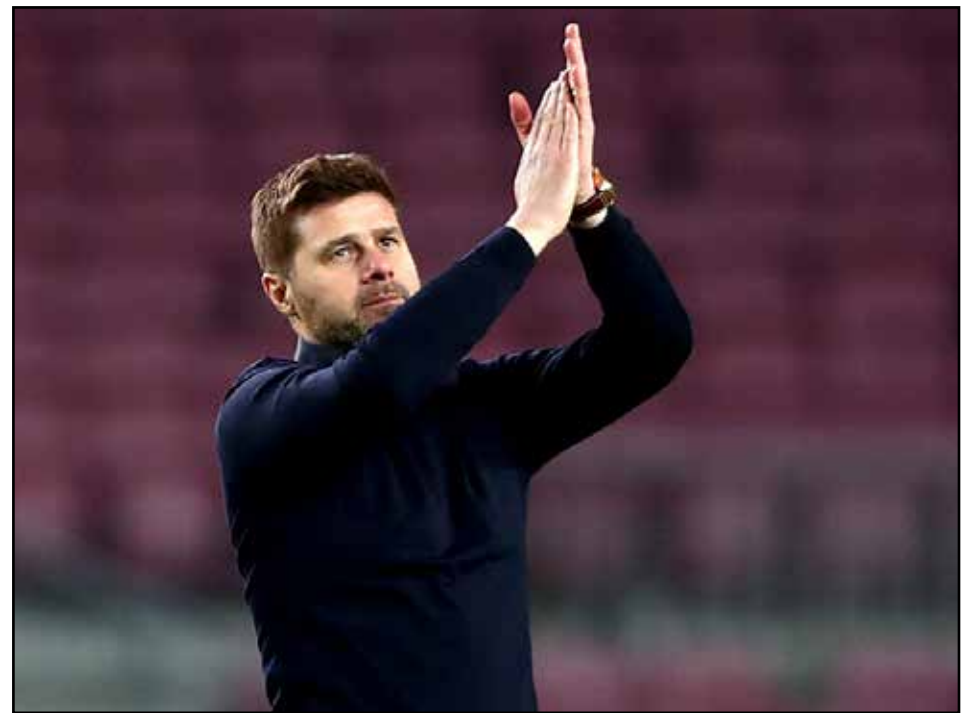
MEMORABLE NIGHT: an emotional Mauricio Pochettino came onto the field at the Camp Nou ten minutes after the final whistle Tuesday night to salute the traveling Spurs fans for their support

The Dutchman, who replaced first-choice Marc-Andre ter Stegen, was exceptional throughout and his clawed save to keep out Moura's earlier effort came after superb