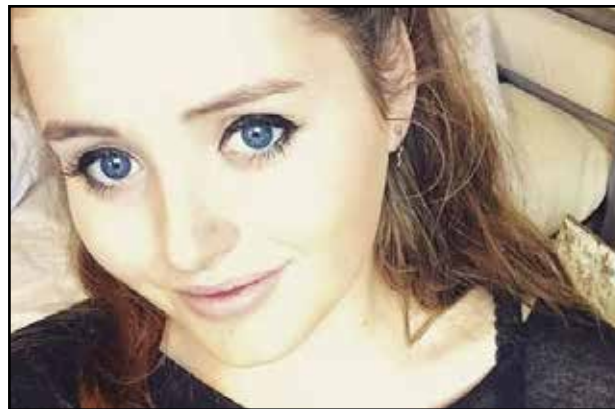
GRACE MILLANE: round the world trip

"We all hope justice will be fair and swift and