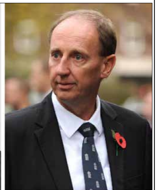
Lineker has been accused of breaking BBC editorial guidelines by Jonathan Agnew

Mr Lineker, who is hosting BBC show Have I Got News For You this Friday, campaigns for Remain or a People's Vote frequently on Twitter.