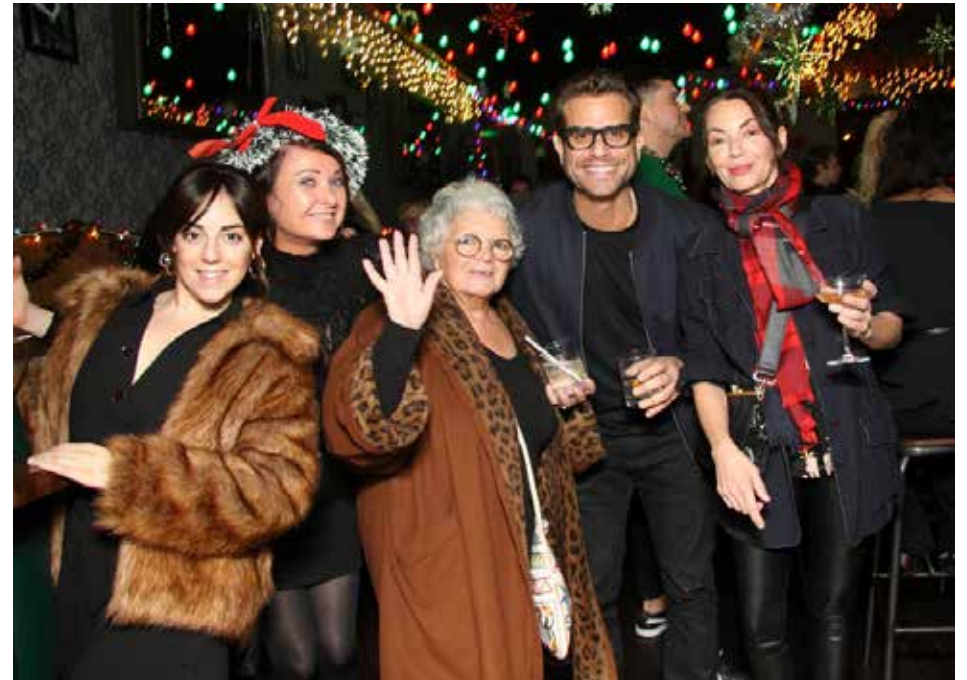
IT WAS A VERY GOOD NIGHT: BiLA members turned out in force for our Christmas Party at No More Heroes on Monday night