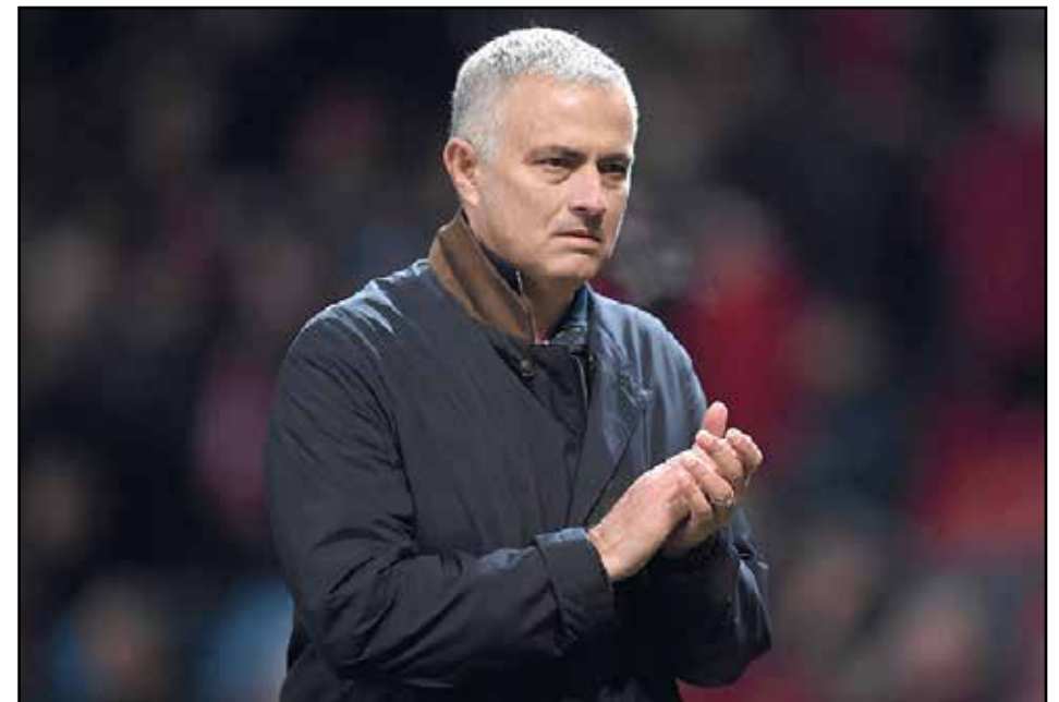
MOURINHO: sacked by Manchester United on Tuesday