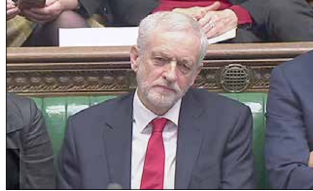
DENY, DENY, DENY: Corbyn has claimed he said 'stupid people'. Lip readers beg to differ

Mrs Leadsom said viewers and MPs would "draw their own conclusions" after Mr Corbyn's statement.