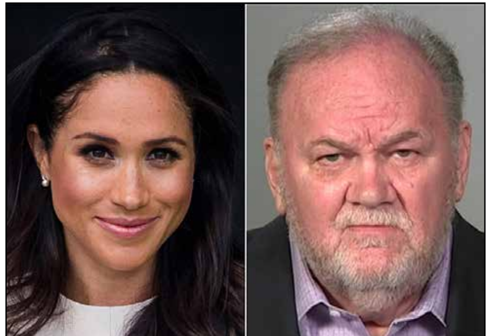
MEGHAN MARKLE AND FATHER THOMAS:

"I've reached out to her and I need her to reach back to me."