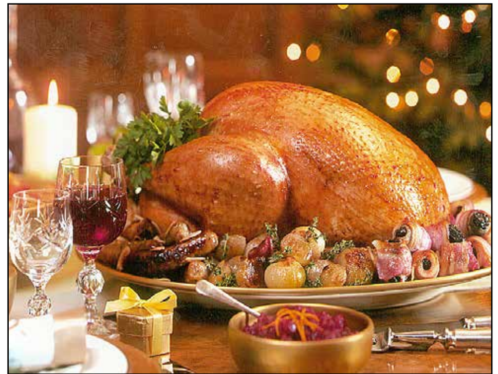
GROANING TABLE: it's SO easy to overdo it this time of year...

This is a top rule at our Bodycamp retreats on Ibiza and Majorca. It simply means that if you are going to eat any form of simple carbs (bread/pasta/ice cream/sweets etc) before you choose to eat such foods, exercise for a minimum of 30 minutes. Strength training or cardio are recommended. This ensures your metabolism is increased and will also alter your hunger by lowering it and might make you think about choosing a healthier meal. Make sure you exercise every two days - one day "on", one day "off".