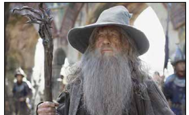
SIR IAN MCKELLEN: bought the pub in 2011

'I was barred just over a year ago and have never received any explanation