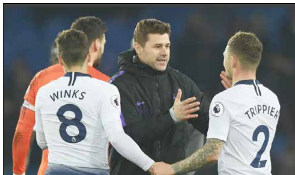
NOT SO SPURSY: Spurs are in the last 16 of the Champions League, the Carabao Cup semi-finals and now sit second in the Premier League.

Pochettino told BBC Sport: "The effort was fantastic. To have one day less after Everton, I am very pleased with the performance."