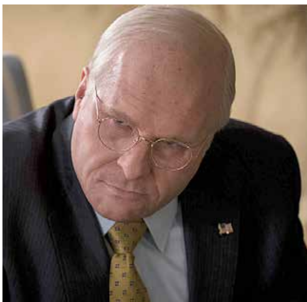
ASTONISHING: Christian Bale or Dick Cheney?

The film explores Dick's role during the tumultuous Bush presidency and how he ended up becoming one of the most powerful