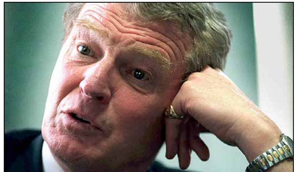
Described this week as 'a lifelong mentor, friend and guide,' Paddy Ashdown led the Liberal Democrats at Westminster from 1988 to 1999

famous for his politics, but his talents extended well beyond that arena. He was an accomplished author, and had spent many years serving the country before he got near the Commons. Few people know how hard he fought to get into politics following his service in the marines and diplomatic service."