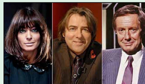
Between them, Claudia Winkleman, Jonathan Ross and Barry Norman hosted the show for 44 years

broadcast to the whole country, with Norman its first permanent host.