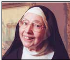
SURPRISE CELEB: Sister Wendy Beckett

Africa in 1954 to teach, but in 1970, with her health deteriorating, the Vatican gave permission for her to pursue a life of solitude and prayer.