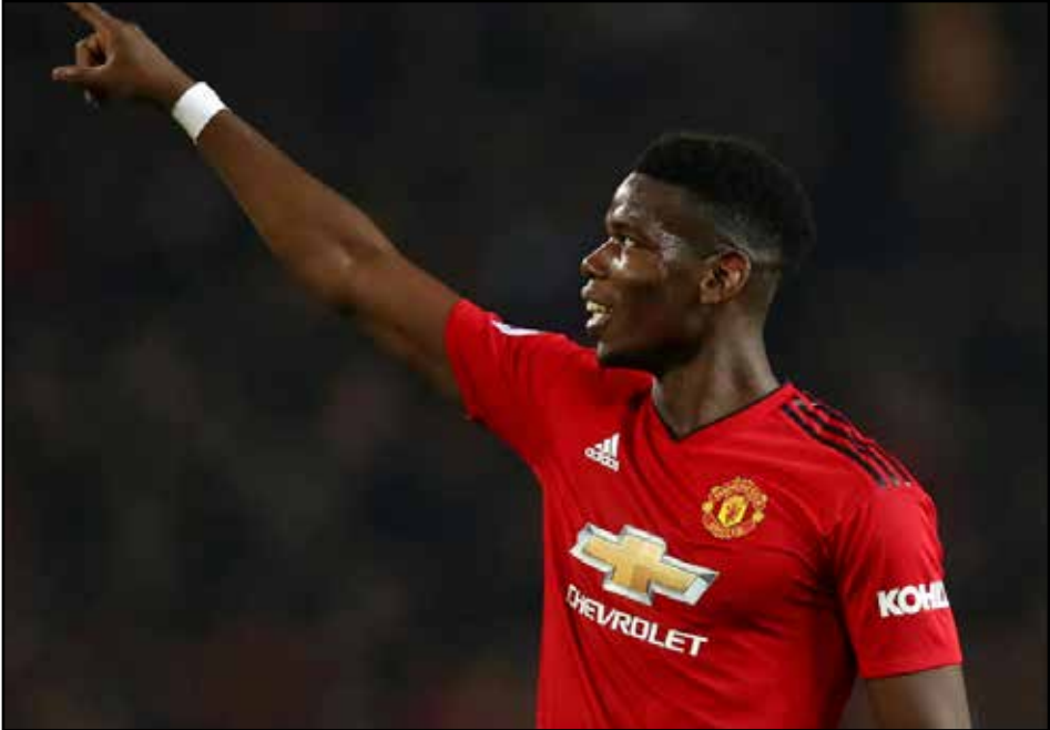
PAUL POGBA: the midfielder scored twice in Wednesday’s 3-1 home win over Huddersfield

“I was surprisingly calm all day. The lads have