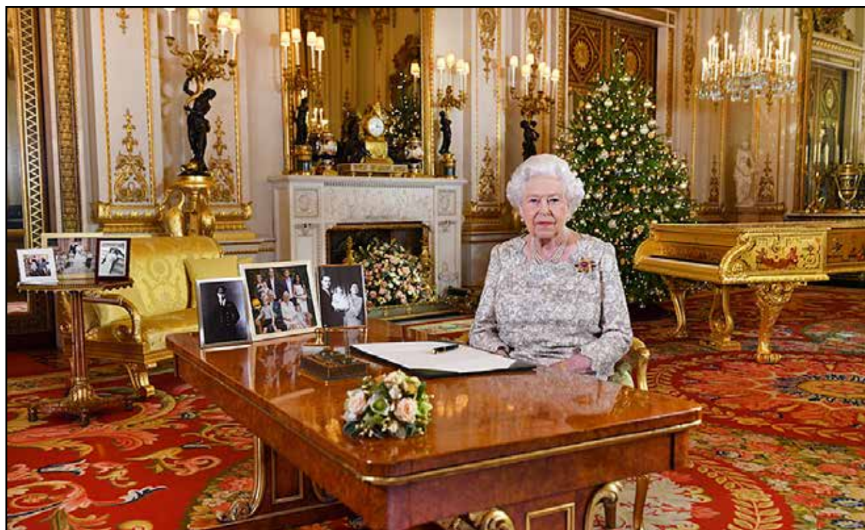
"Even with the most deeply-held differences, treating the other person with respect and as a fellow human being is always a good first step towards greater understanding," the Queen told a global audience on Tuesday

The Christmas broadcast, recorded in the White Drawing Room at Buckingham Palace, saw Her Majesty sitting serenely amid family mementos, royal heirlooms and treasured