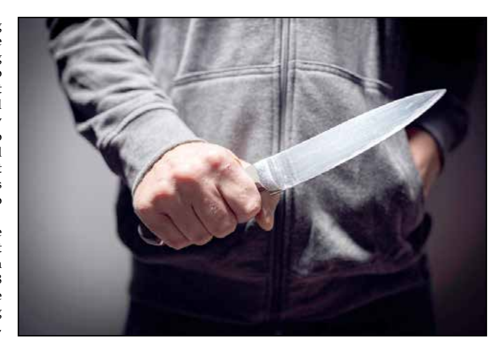
MENACE TO SOCIETY: Nearly 5,000 people sought hospital treatment for knife wounds from April 2017 to March 2018

Seven people have been stabbed to death in Britain already this year. Early on New Year's Day mother