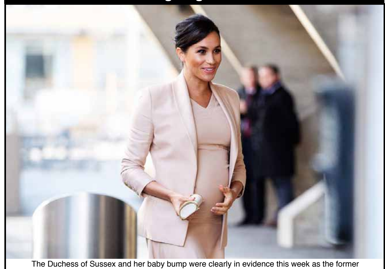
actress made a solo visit to the famed National Theatre on London's South Bank (story, page 4)

News from Britain 2-5 · Meet a Member 8 · Crossword 8 · Stargazing 9 · Sudoku 9 · Brits in LA 10 · Sean Borg 11 · Sport 18-20