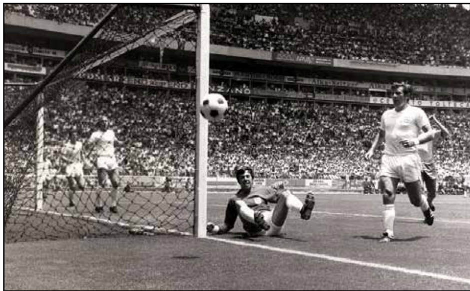
THAT SAVE: Banks is best known for his astonishing point-blank save from Pelé in 1970 World Cup against Brazil in Guadalajara, Mexico

THE WORLD and beyond this week was mourning Gordon Banks, considered England's greatest-ever goalkeeper, who has died aged 81.