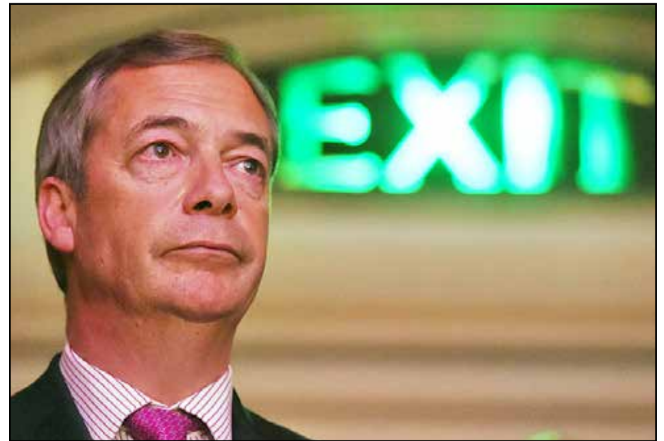
"All they have to do is deliver a proper Brexit," said Farage of the two main parties

trying to persuade MPs to support her plan for a negotiated withdrawal from the EU, but many of her own party want a cleaner break.