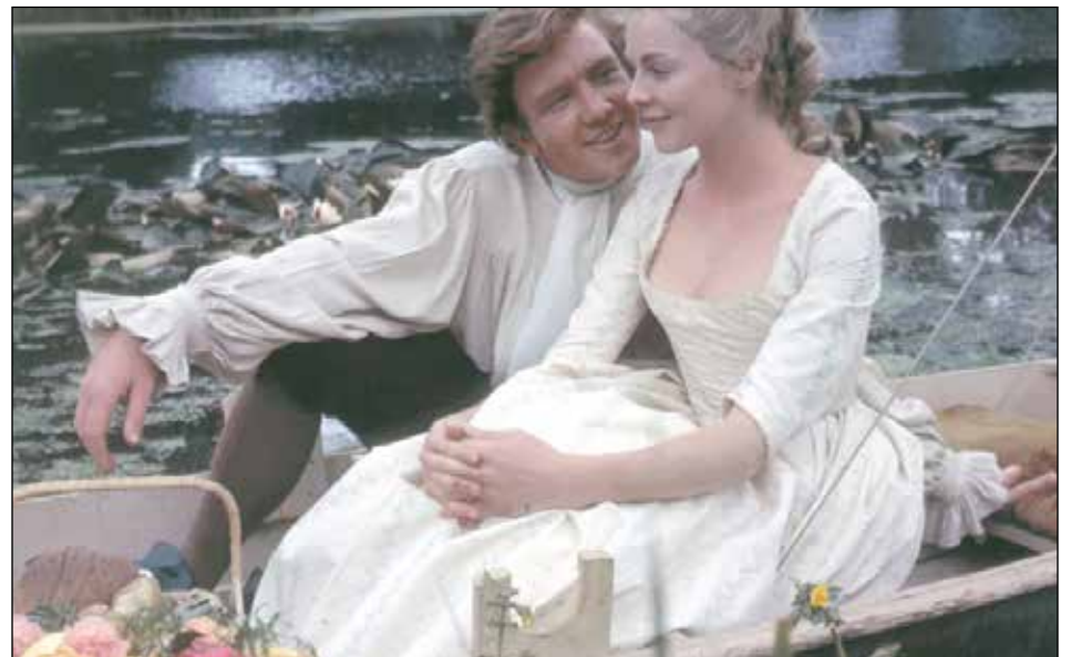
BEST OF BRITISH: Finney became a global star for his turn in Tom Jones , (1963) Tony Richardson’s rollicking comedy, which won four Oscars including Best Picture

Leigh’s 1971 debut feature Bleak Moments .