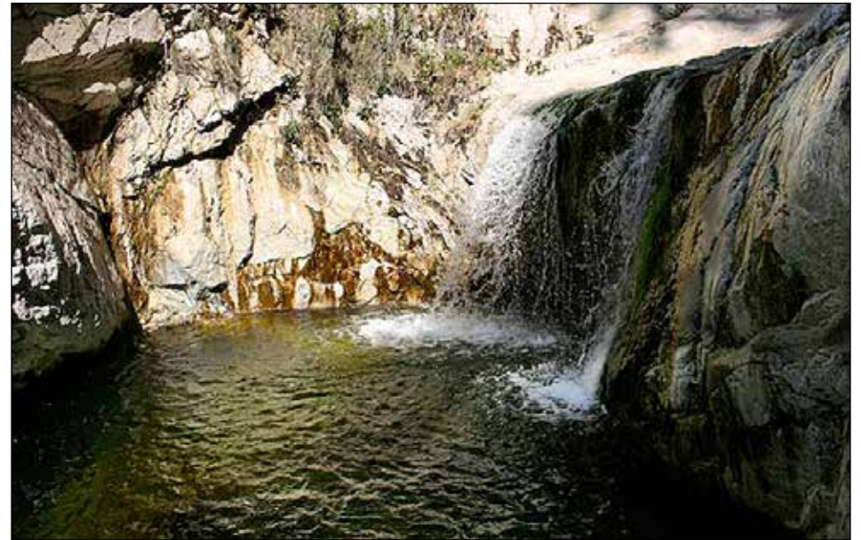
HIDDEN GEM: The Switzer Falls in the San Gabriel Mountains are in full flow

And finally.....can the Oscars get any more controversial? First we had the Kevin Hart debacle, from deciding to go with no host this year, the kerfuffle about how many songs and performers they were going to allow. And now deciding four awards will not air live on the