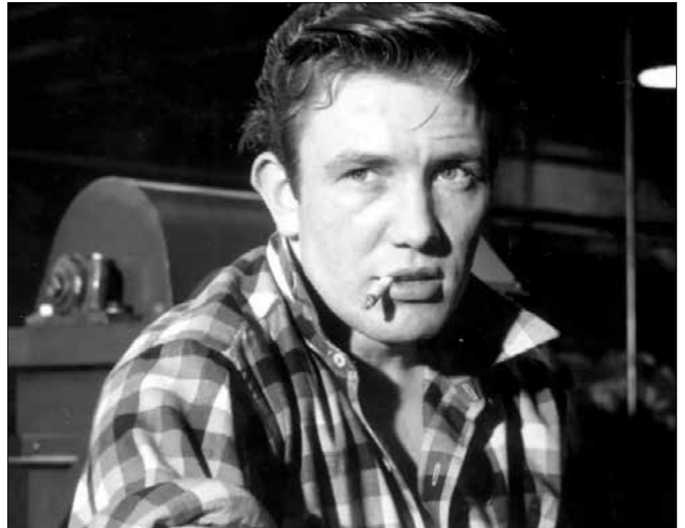
SMOLDERING MASCULINITY: Finney shot to fame as Arthur Seaton in Saturday Night and Sunday Morning (1960) the classic British kitchen sink drama

Roles followed in Karel Reisz’s Night Must Fall and the Stanley Donen-directed Two for the Road , opposite Audrey Hepburn; Finney then turned director, with the 1968 release Charlie Bubbles . Written by Shelagh Delaney, the tale of a successful writer returning to his Manchester hometown was clearly highly personal for Finney, though it would prove to be his only directorial credit. He also used his increased clout – and money – to supporting other British new wave figures, backing Lindsay Anderson’s radical If... and its follow-up O Lucky Man! , as well as Mike