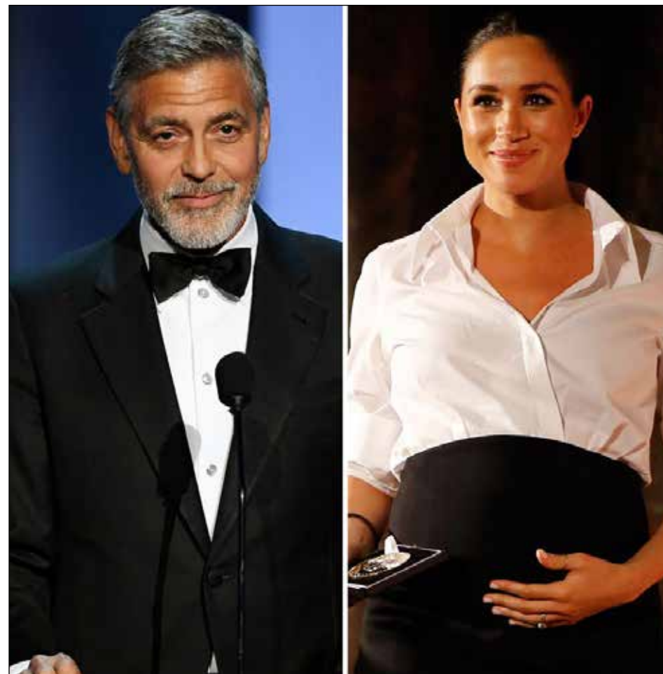
'She's getting a raw deal,' said Clooney of Meghan's media coverage

"We've seen how that ends. I can't tell you how frustrating it is to see that. You're taking a letter from a daughter to a father and broadcasting it