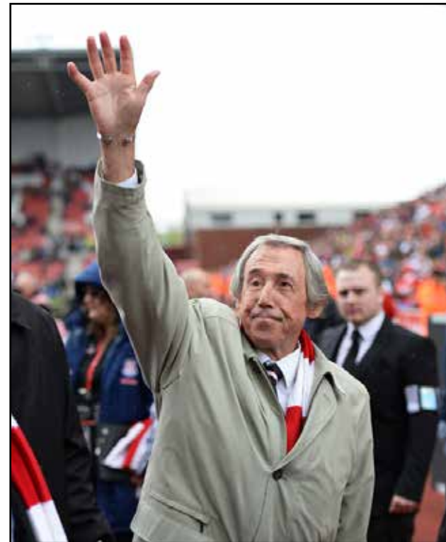
NOT FORGOTTEN: Banks remained a much-loved figure at Stoke City, who he helped to victory in the 1972 League Cup final against Chelsea

By April 1967, however, Leicester had uncovered another fine goalkeeper in the locally born Peter