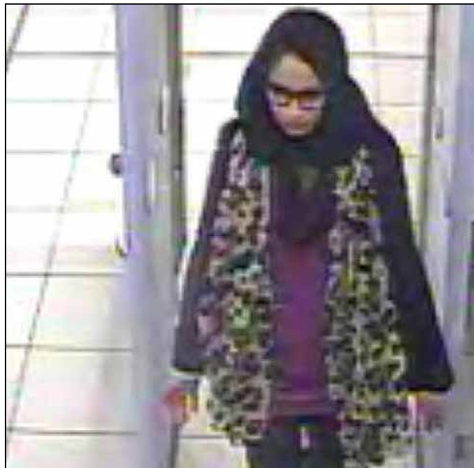
NOT WELCOME: Shamima Begum, who fled London in 2015 to join ISIS