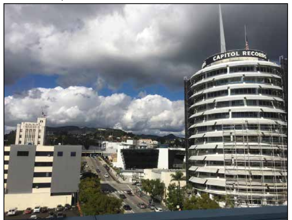
HARD WEATHER, SOFT OPENING: the newly-arrived h Club on Vine Street boasts sensation views of the Capitol Records building and Hollywood Hills

Ye Olde King's Head, 116 Santa Monica Blvd. Santa Monica CA 90401 • Tel: 310 451-1402