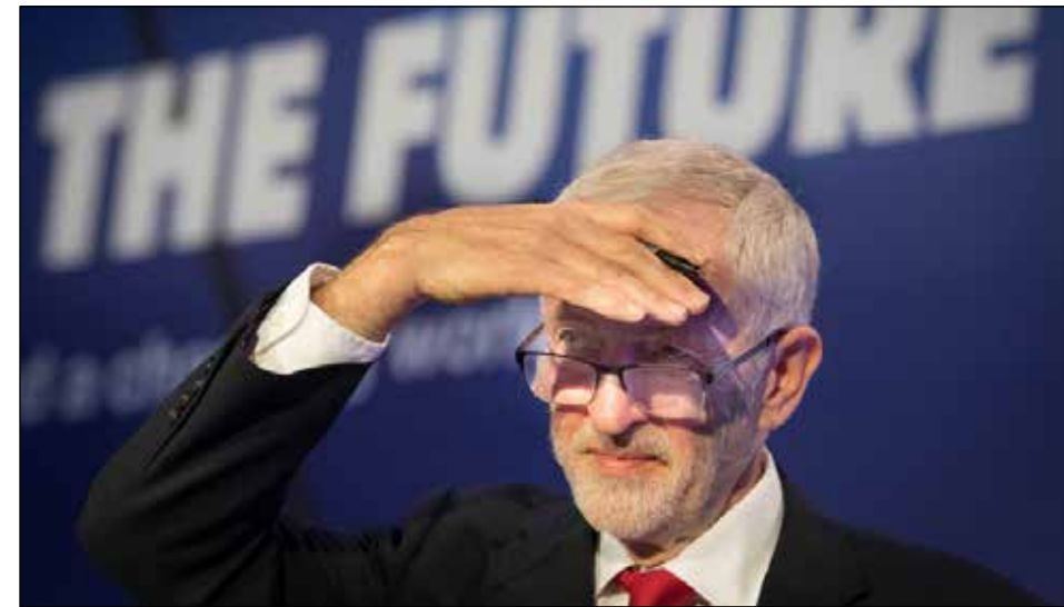
OUTLOOK SUNNY: The Labour leader appeared unflustered by the news

California's British Accent™ - Since 1984