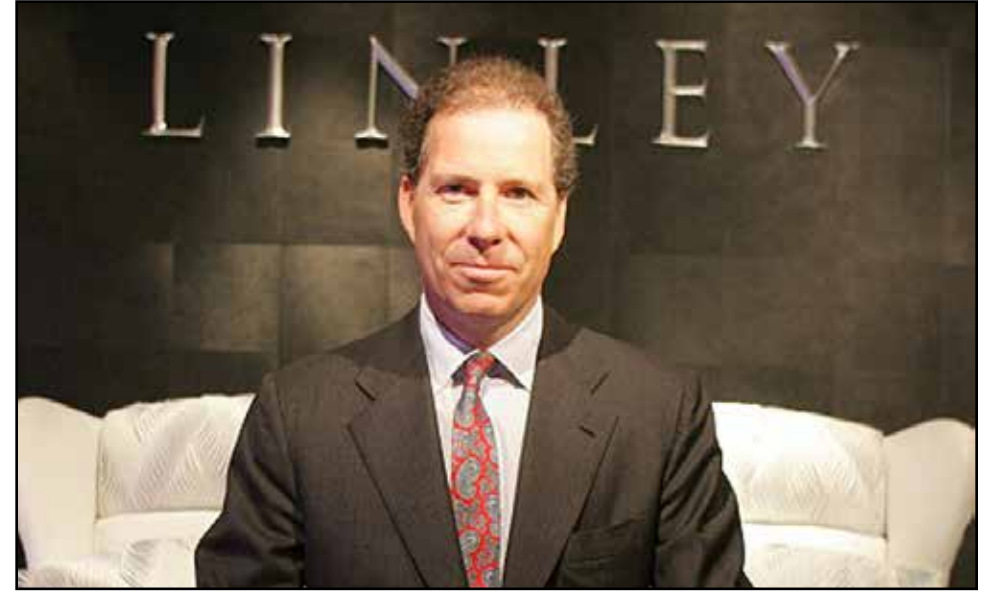
ARMSTRONG-JONES: "It's time to correct this damaging image."

smoking socialite. That was part of her story, of course it was, but only part of it."