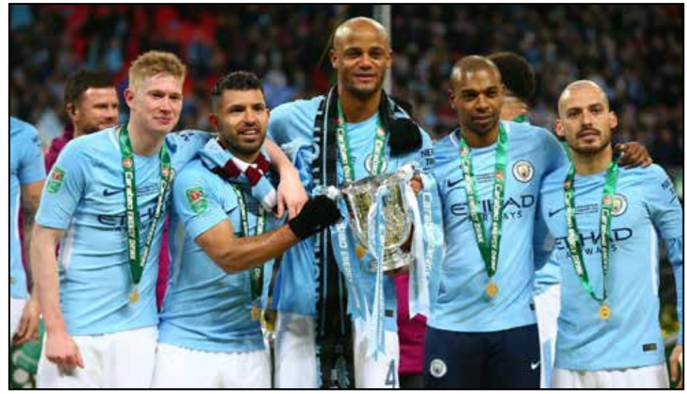
PHASE ONE: City won the Carabao Cup on Sunday with a penalty shoot-out win over Chelsea. The match finished goalless after extra time.

"It's almost impossible. We are going to try to win as many games as possible, obviously, and if you do that you must be considered the best team ever because nobody has done it. However, we are not looking at that."