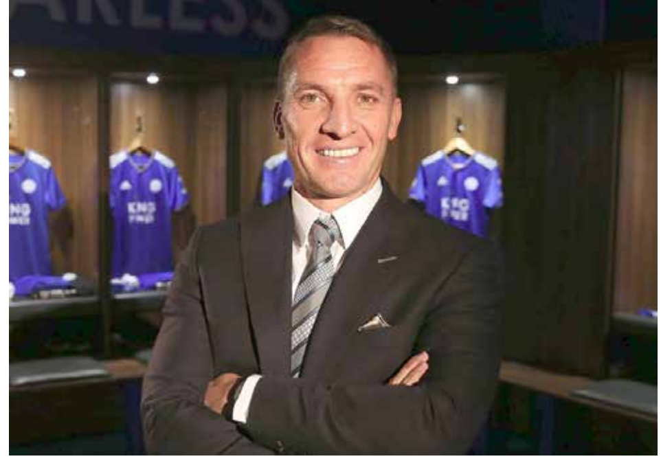
HE'S BACK: Brendan Rodgers was installed as new Leicester boss this week