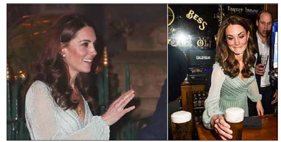
PRINCESS OF PINTS: The Duchess showed off her skills in Belfast this week

Cooper, designed to pin the PM down by placing her promise in a motion approved by Parliament, was passed by a majority of 482 - with 20 Tory hardliners opposing it and scores of Conservatives abstaining.