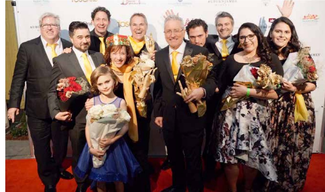
SHINY TOSCAR PEOPLE: the cast and crew of best picture winner "Coma".

Ye Olde King's Head, 116 Santa Monica Blvd. Santa Monica CA 90401 • Tel: 310 451-1402