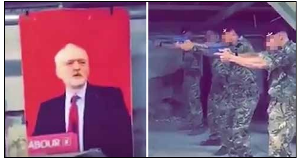
HAPPY WITH THAT? the video came from a shooting range in Afghanistan

All five men in the lower ranks of the 3rd Battalion,