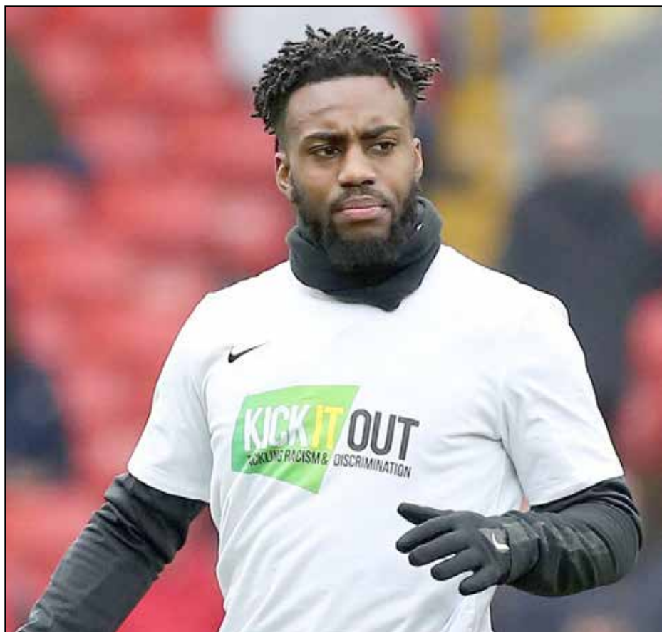
DANNY ROSE: I've got five or six more years left in football, and I just can't wait to see the back of it."