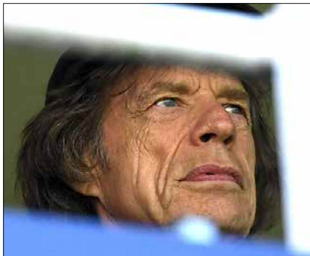
JAGGER: struck down by mystery illness