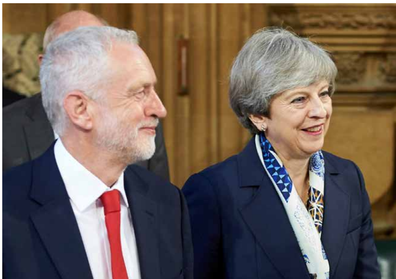
ALL SMILES (FOR NOW): but Theresa May's talks with Jeremy Corbyn sparked fury on the Tory backbenches

A Downing Street spokesman said: "Today both sets of negotiating teams met for four and a half hours of detailed and productive technical