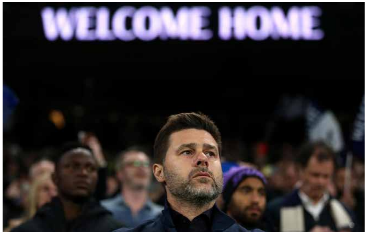
MAURICIO POCHETTINO: "I am very romantic but football is not about being romantic."

Pochettino, however, has already warned Levy winning will only come about if he is prepared the