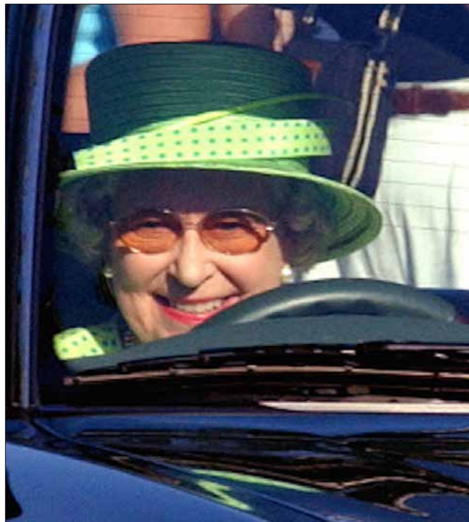
AS THE WHEEL TURNS: the royal couple's driving privileges have been publicly questioned since Prince Philip's crash in Sandringham in January

Only a day after the collision involving her husband, who is 97, the Queen was spotted