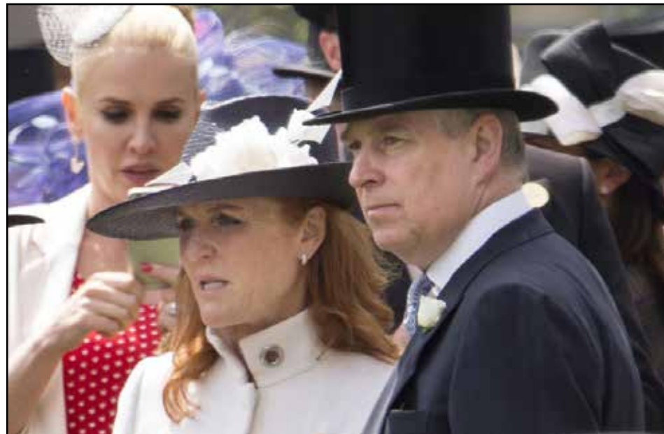
ALL SMOKE, NO FIRE? Fergie and Andy have denied rumors of a romance

Andrew went on official business from Monday to Wednesday last week – aides said his trip was funded "privately". But instead