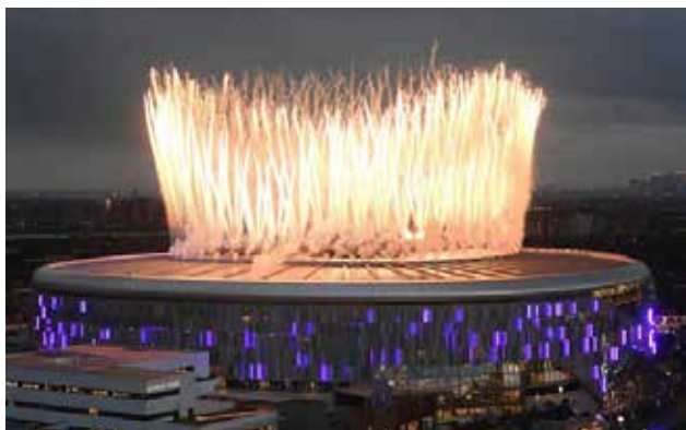
SPLASHY DEBUT: the new Spurs stadium