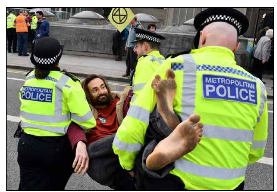
TAKING IT TO THE STREETS: Extinction Rebellion protesters have been blocking squares and key intersections in Central London this week

It is calling for an ecological emergency to be declared, greenhouse gases to be brought to net zero by 2025, and the creation of a citizens' assembly to lead action on the environment. XR says the systems propping up "modern consumerfocused lifestyles" will lead to mass water shortages, crop failures, sea level rises and the displacement of millions.