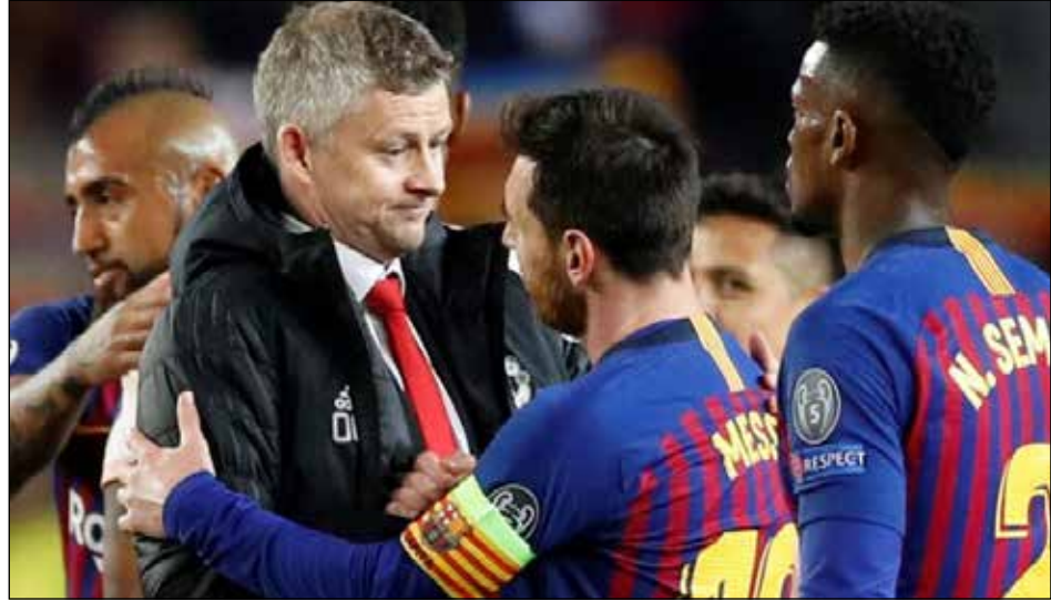
MESSI DISPLAY: As so often, Lionel Messi was United's tormentor-in-chief at the Nou Camp on Tuesday night