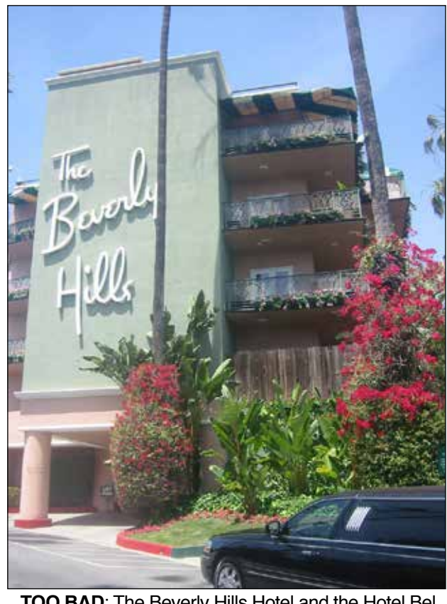
TOO BAD: The Beverly Hills Hotel and the Hotel Bel Air are both part of the Sultan of Brunei's portfolio

Only in the recent years did I declare myself fully, without fear of judgement or persecution. But my gay counterparts in other parts of the world have no choice but to remain closeted. They are not so