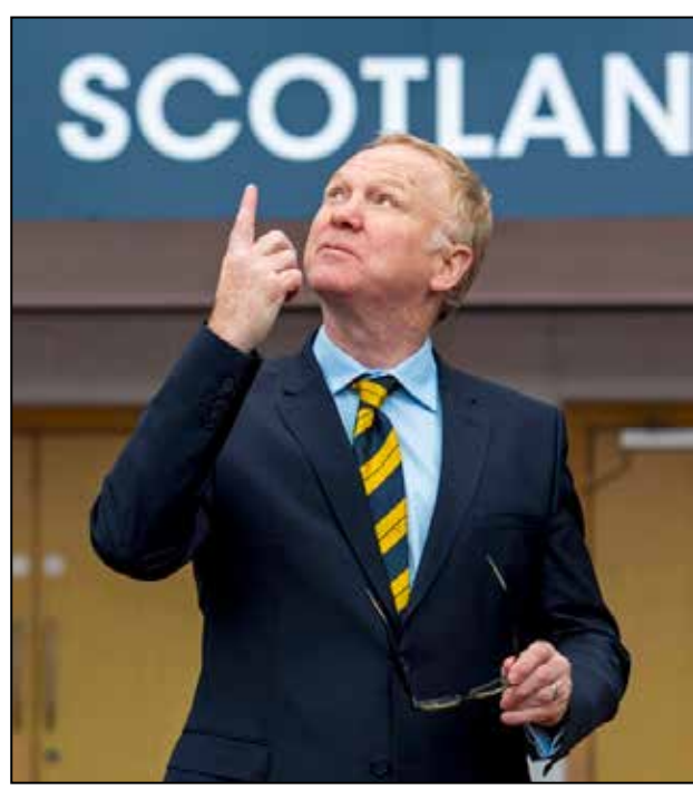
THE ONLY WAY IS UP? The Scottish FA say the search for a successor "will begin immediately".

His departure comes a month after Scotland were humiliated 3-0 by world ranked 117 nation Kazakhstan, then recorded unconvincing 2-0 win