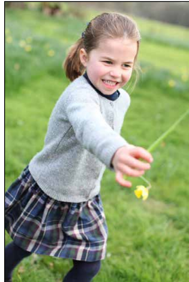
LITTLE MISS BOSSY: Charlotte puts her best foot forward in the gardens of Kensington Palace

William, 36, has also given little insights into his daughter's character,