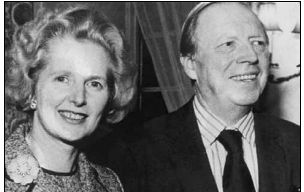
AIREY NEAVE: one of Margaret Thatcher's closest confidants

Mr Hands, MP for Chelsea and Fulham, wrote on Twitter this week: "Great news for my constituents, the Neave family, as Airey Neave assassination reopened by UK police after my meetings with Sajid Javid. Thanks Sajid for taking this up!"