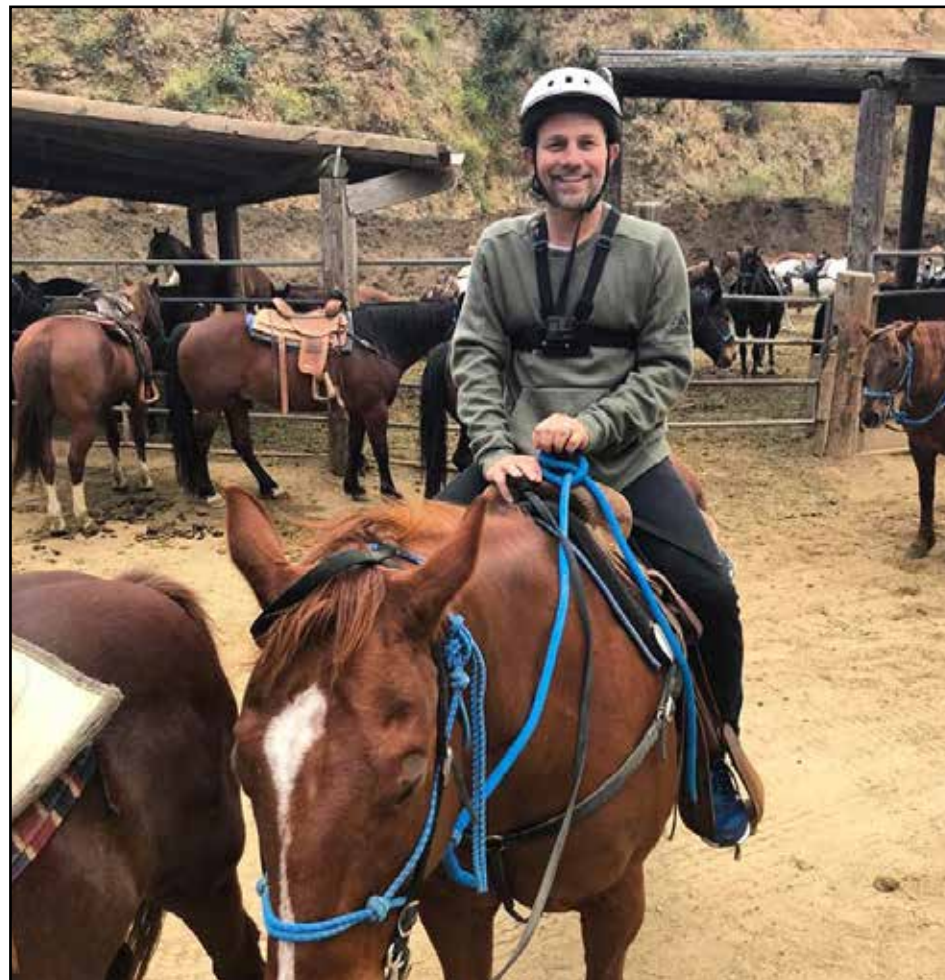
HE HATES TO BE A NAG: Craig horsing around in the Hollywood Hills

Garcetti sets a target of 28,000 publicly available electric-vehicle chargers by 2028 with the city streamlining permitting for chargers, expanding rebate programs and requiring more chargers through the building