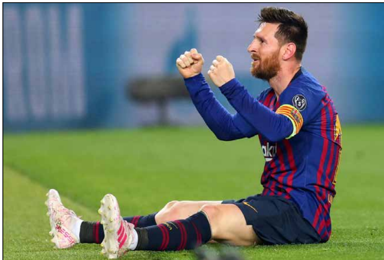
PURE GENIUS: Leo Messi celebrates his astonishing free kick at the Camp Nou Wednesday night

In the second half at the Nou Camp on Wednesday, Liverpool - who were beaten by