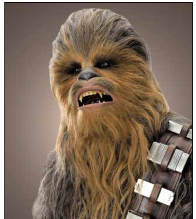
ICONIC ROLE: Mayhew as Chewbacca