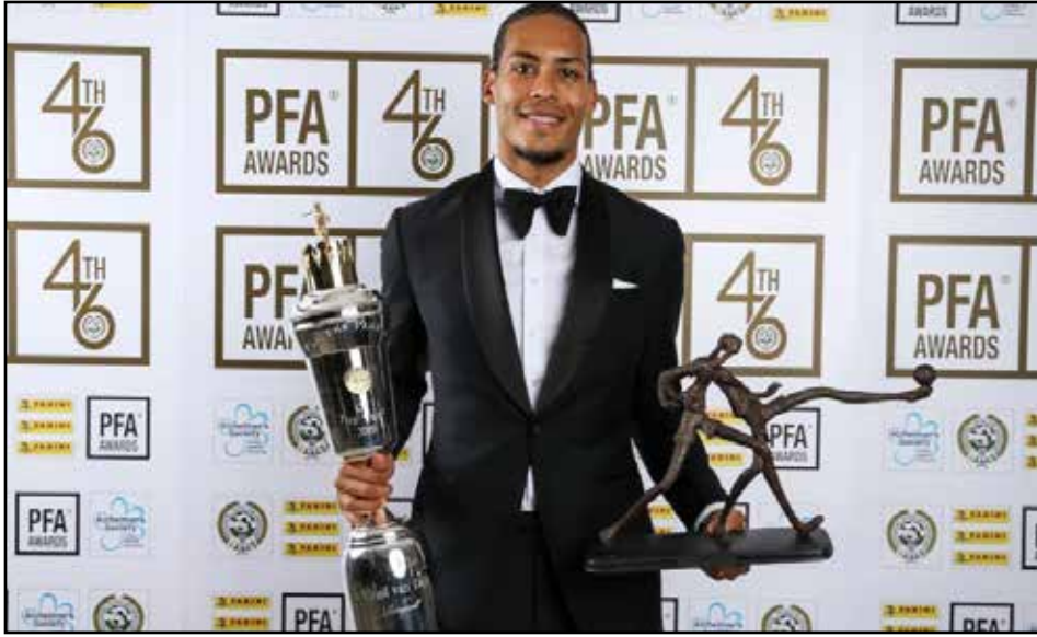
POPULAR ACCLAIM: Liverpool's Virgil Van Dijk has been in superb form this season