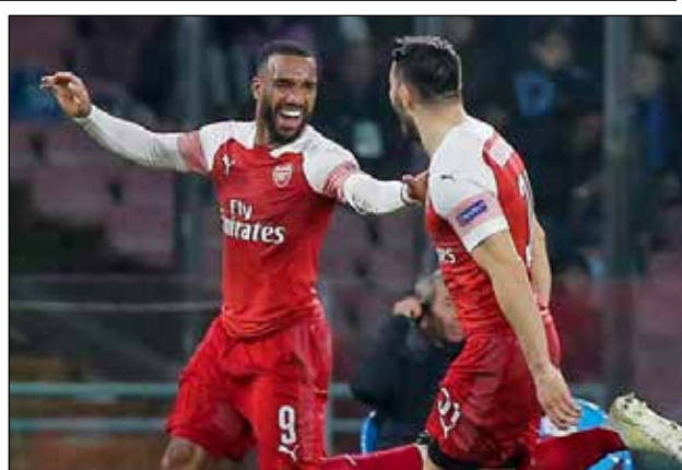
LACAZETTE: double for Arsenal Thursday night

And Aubameyang's late volley ensured Arsenal