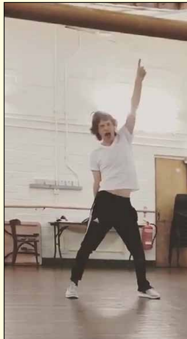
ROCK OF AGES: Mick Jagger busts a move in a video released this week

Sir Mick said he was “devastated” to let down fans after postponing the tour dates in the US and