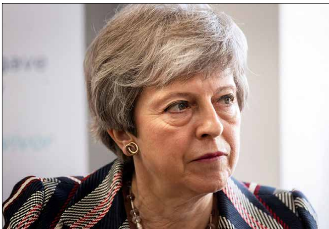
THERESA MAY: the Prime Minister will make one final effort to get her Brexit deal approved next month

Right now, the expectation is that vote will be lost (although it is not impossible, of course, that Number 10 could turn it round). And even though the letter doesn't spell it out, it is understood that if May's Brexit plan is defeated again, she will