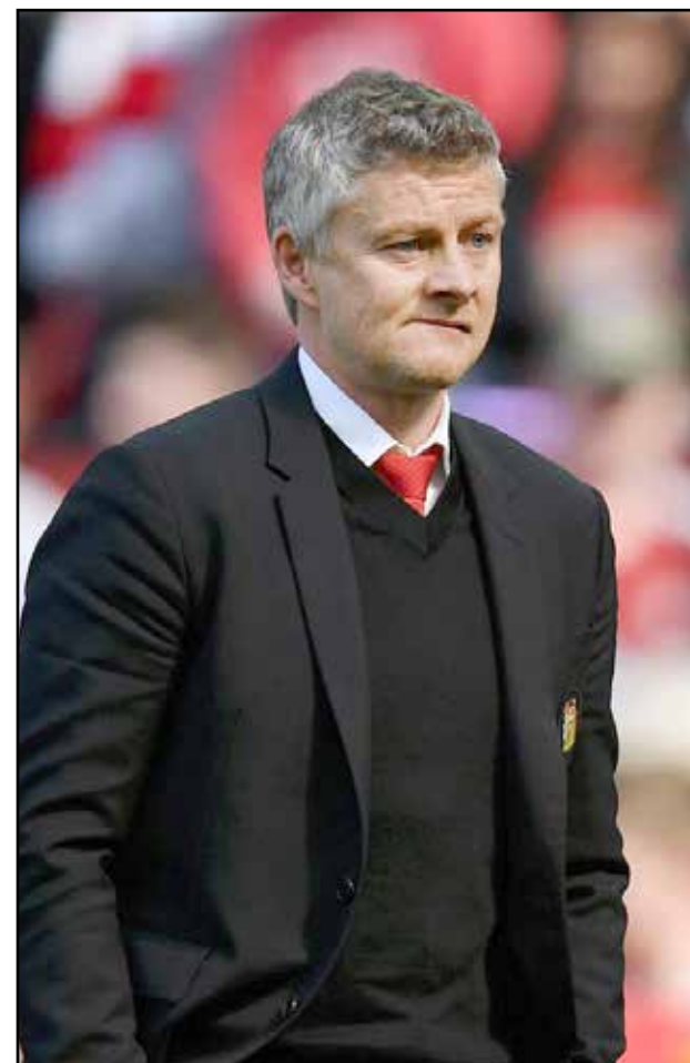
SOLSKJAER: saw United collapse in recent weeks

He added: "When you are almost alone, in that you don't have the support of the club close to you, while certain players go somewhat