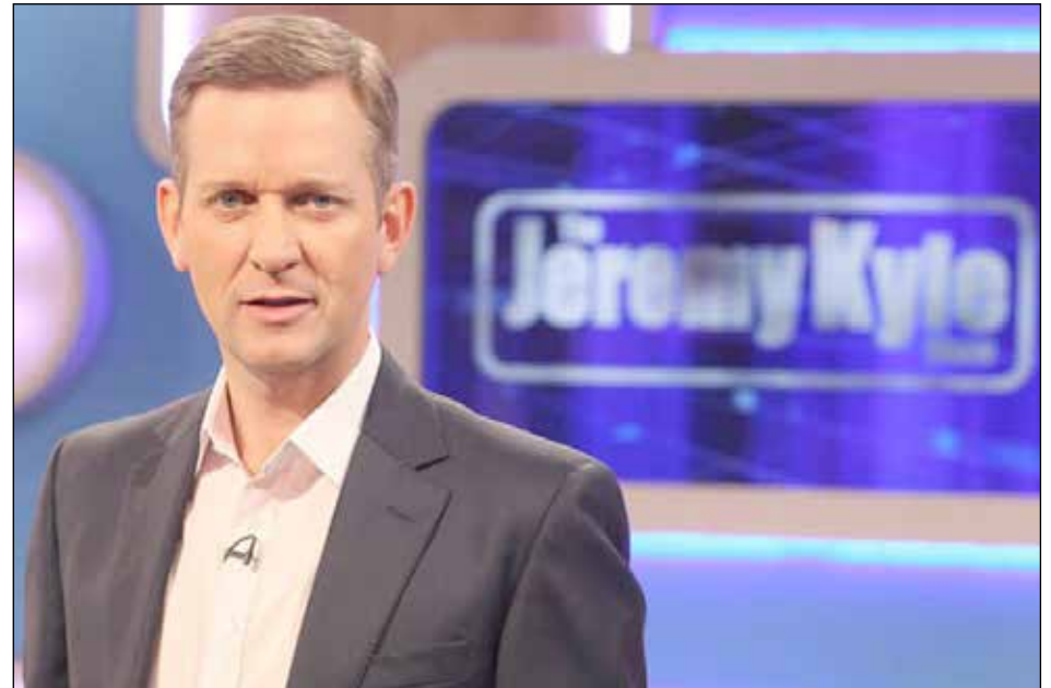
CONTROVERSIAL: Jeremy Kyle has been likened to the Jerry Springer in the US