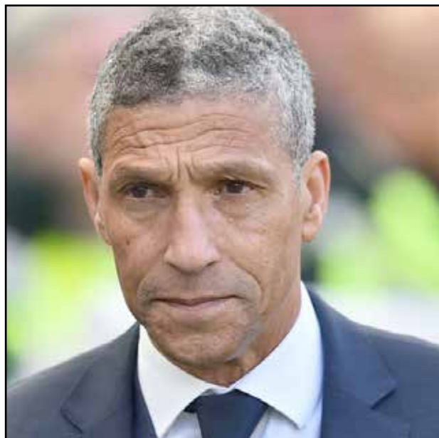
HUGHTON: the seventh Premier League manager to be sacked this season