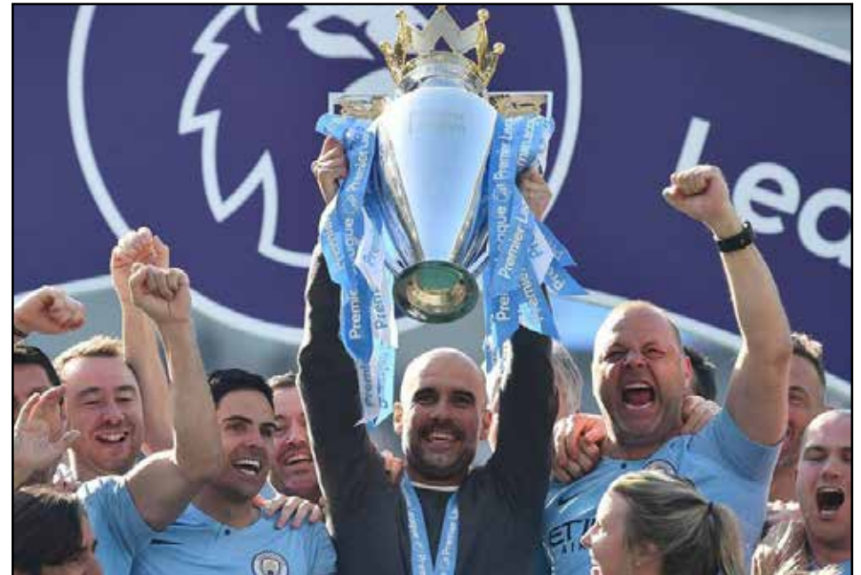
SERIAL WINNER: Guardiola clinched his eighth title in ten years on Sunday

are the only club to win three consecutive Premier League titles and have done so twice, from 1998-99 to 2000-01 and 2006-07