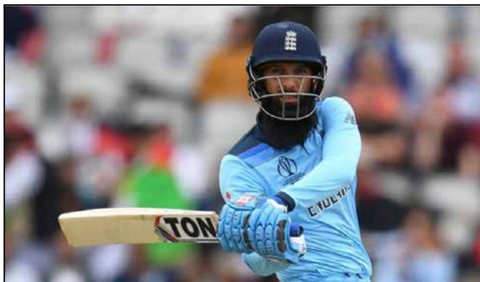
Moeen hit an unbeaten 31 from nine balls against Afghanistan on Tuesday

That was evident in Tuesday's win over Afghanistan at Old Trafford, where captain Eoin Morgan hit 17 sixes