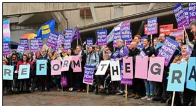
Trans rights campaigners have rallied outside Holyrood to call for reforms