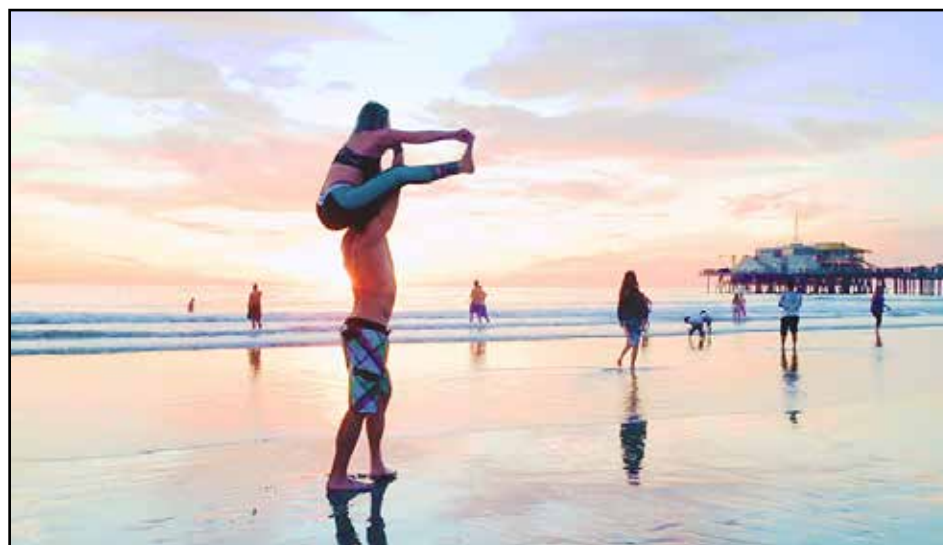
NOT JUST A BEACH....but a beautiful outdoor gym

There's no doubt exercising on the sand burns more fat because of the intensity involved in the movement of the body across the beach. Being outside at the beach and not indoors also greatly increases the temperature of the body and tests its