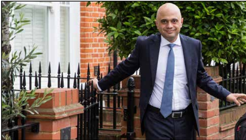
NOT QUITE A BIG BEAST: The Home Secretary puts on a brave face

It has been one of the so-far unreported quirks of the leadership race that the campaign teams for Mr Javid and Jeremy Hunt were based on the fifth and sixth floors of the same block of serviced offices near St James's Park Tube