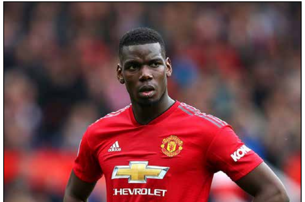
POGBA: linked with a move to Real Madrid or a return to Juventus

Solskjaer said: "Juan is the ultimate professional and one of the most intelligent players I have worked with."