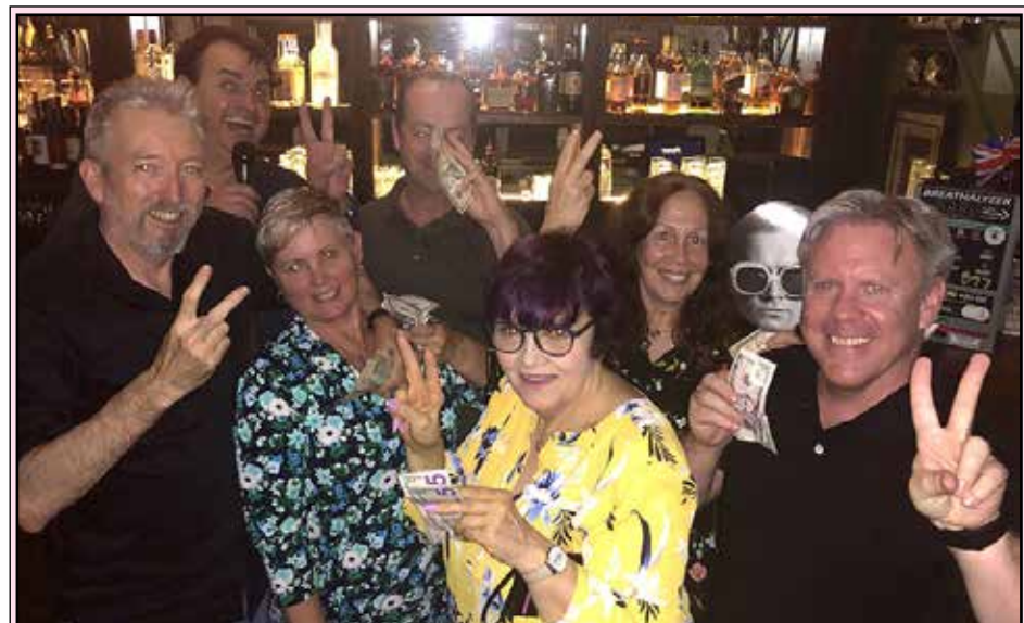
Trivia team The Churchills flash the V for Victory sign after their triumph at the latest Brits in LA Pub Quiz on Tuesday.