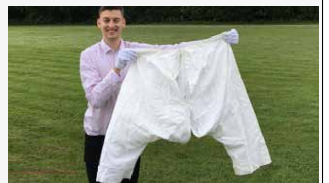
HARDLY SCANTY: the pantaloons have a 44' waist

The handmade undergarments were listed by a vendor whose great aunt worked as a lady-in-waiting in London during the Victorian era. The plus-sized pantaloons, which have a 44in (112cm) waist, have the crowned initials VR (Victoria Regina) embroidered on them, as well as the number "2". Such