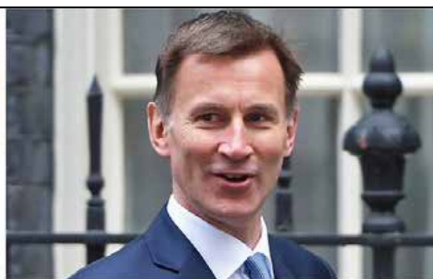
JOHNSON AND HUNT: the final two contenders will be voted on by 160,000 party members nationwide