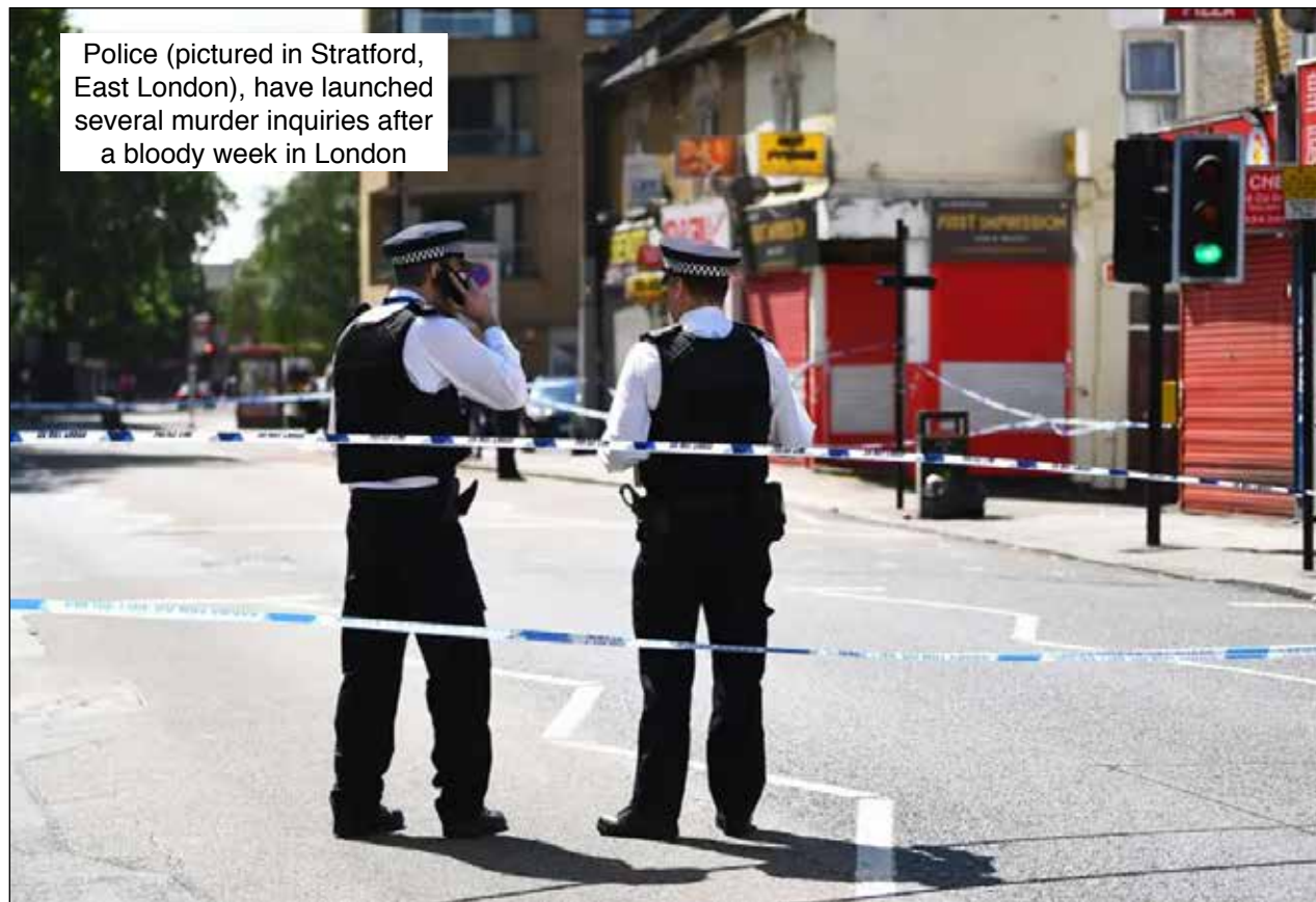
Police (pictured in Stratford, East London), have launched several murder inquiries after a bloody week in London

In 2017, 205 people were murdered in St Louis, Missouri, which has a population of just 318,000. That's like nearly double all of London murders happening in just one