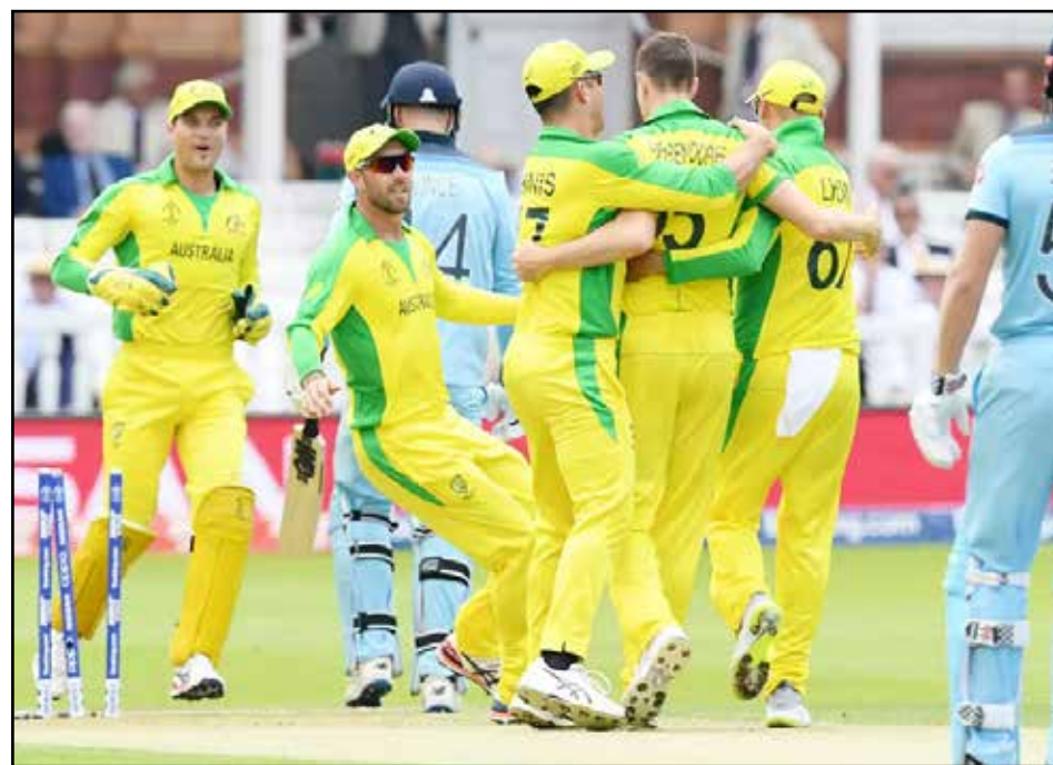
AUSSIES ON THE RISE: Aaron Finch's side were in formidable mood at Lord's

Now, with Warner and Steve Smith restored, captain Finch and coach Justin Langer moulding the side and their fast bowlers firing, they are in hunt to retain their title and win a fifth World Cup in six. This win, their sixth