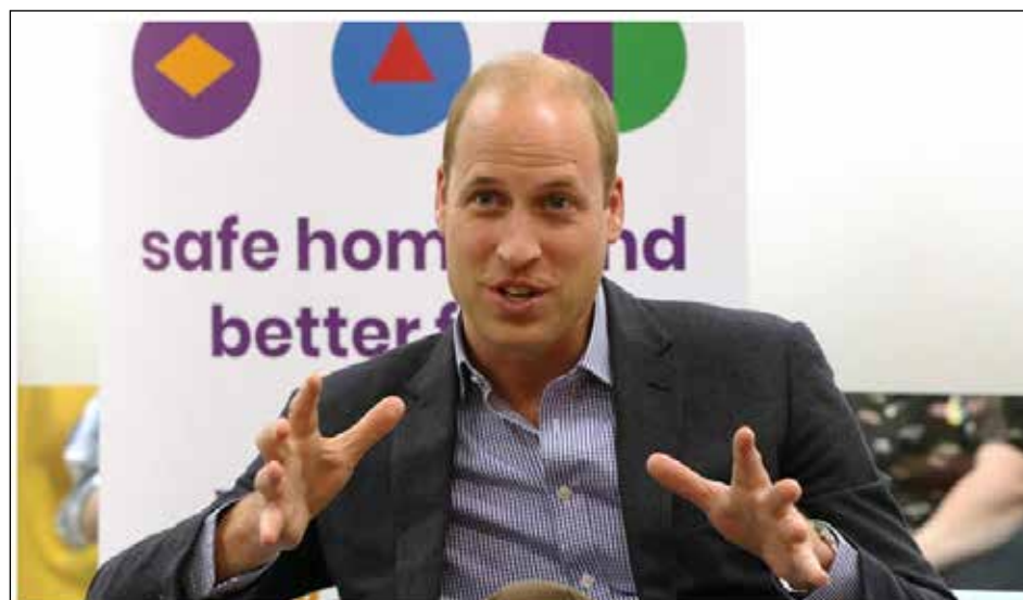
Prince William told staff and clients of the Albert Kennedy Trust that he was shocked by a recent attack on two lesbians on a bus

William answered: "It cont. on page 2, col. 4