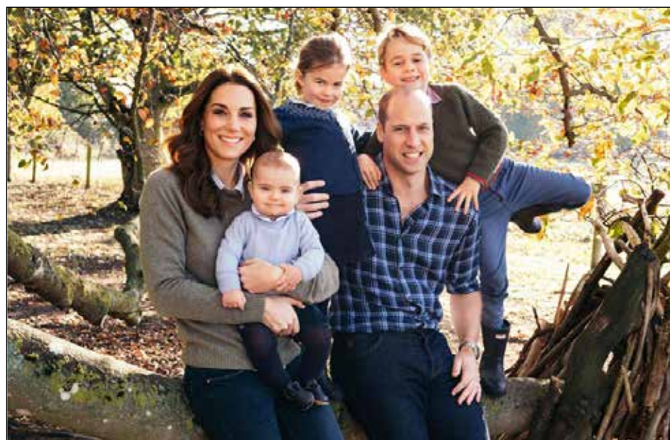
THOROUGHLY MODERN ROYALS: the Duke said he had talked with his wife about how they would respond if Prince George, Prince Louis or Princess Charlotte came out as gay