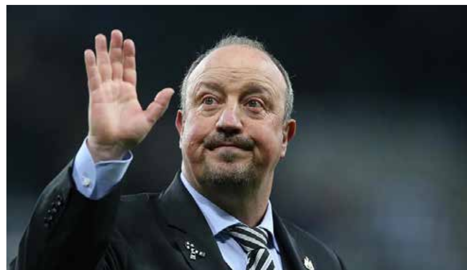
BENITEZ: the Spanish manager formed a special bond with Toon fans, but ultimately paid the price of Mike Ashley's bottom line approach to the team

among the early favorites to succeed Benitez, after the Arsenal legend completed his first campaign in European management at Nice.