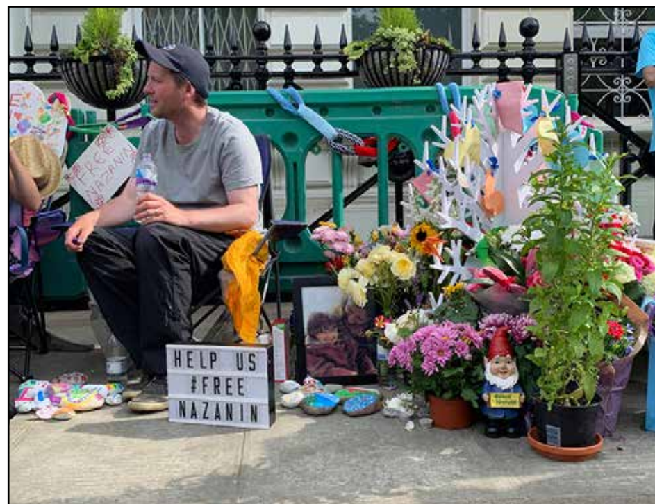
PROFILE IN COURAGE: Richard Ratcliffe is campaigning for the release from an Iranian jail of his wife Nazanin Zaghari-Ratcliffe