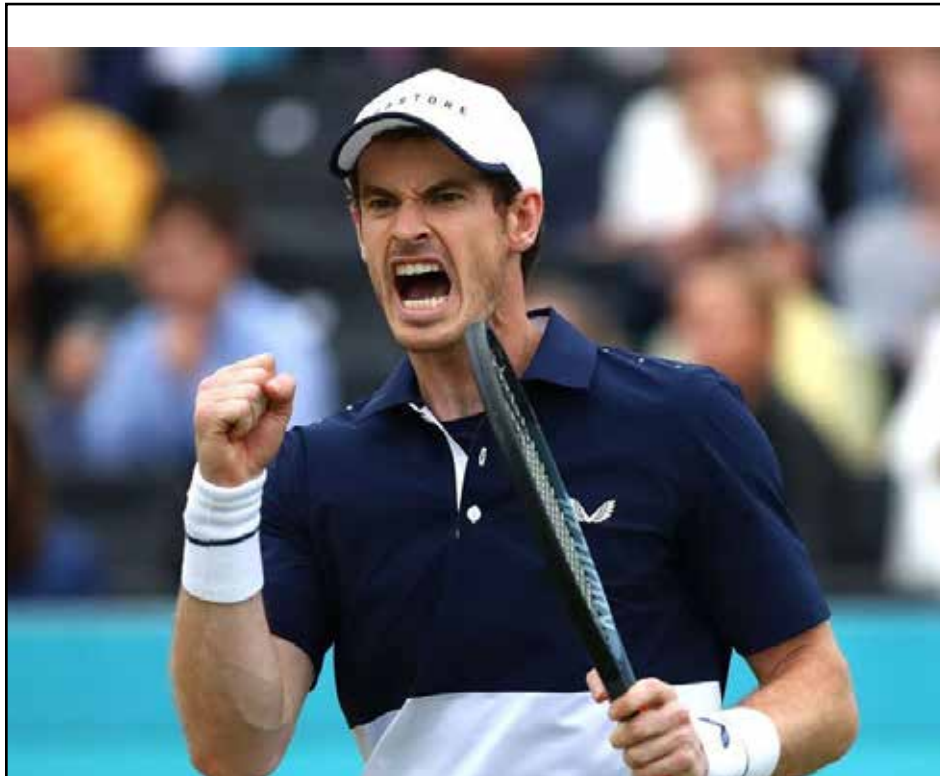
BUOYANT MOOD: Andy Murray enjoys the moment at the Queen's Club