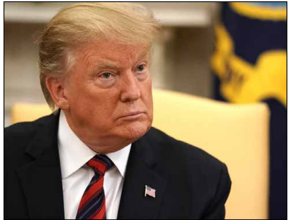
TRUMP ON MAY AND BREXIT: "I told her how it should be done, but she decided to go another way."

Meanwhile, Foreign Secretary Jeremy Hunt last night said that politicians should "call a spade a spade" when dealing with Mr Trump.