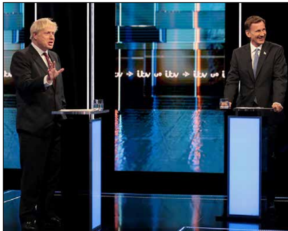
CUT AND THRUST: the bitter tone of the Conservative leadership contest has led some Tories to voice concern that the party's divisions over Brexit will grow deeper

"It's not do or die is it? It's Boris in Number 10 that matters."