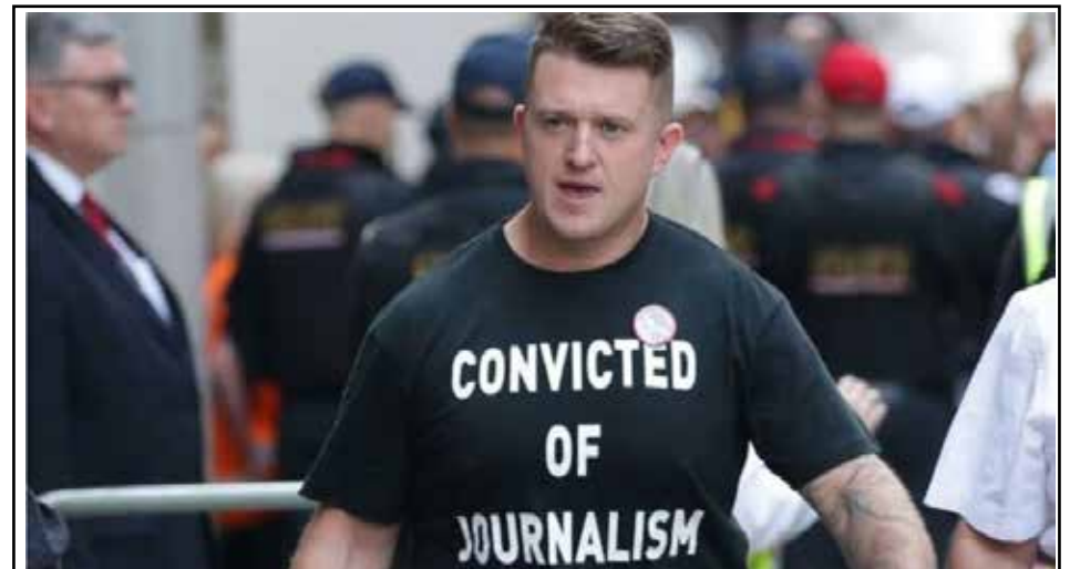
TOMMY ROBINSON: his Facebook Live video of a trial has put him behind bars