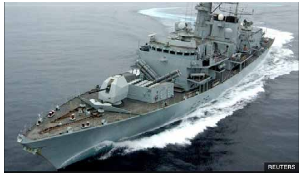
HMS Montrose was shadowing a British tanker as it moved into the Strait of Hormuz

The government of Gibraltar said it would not comment on matters relating to the vessel as it was the subject of a police investigation. It said the matter was also