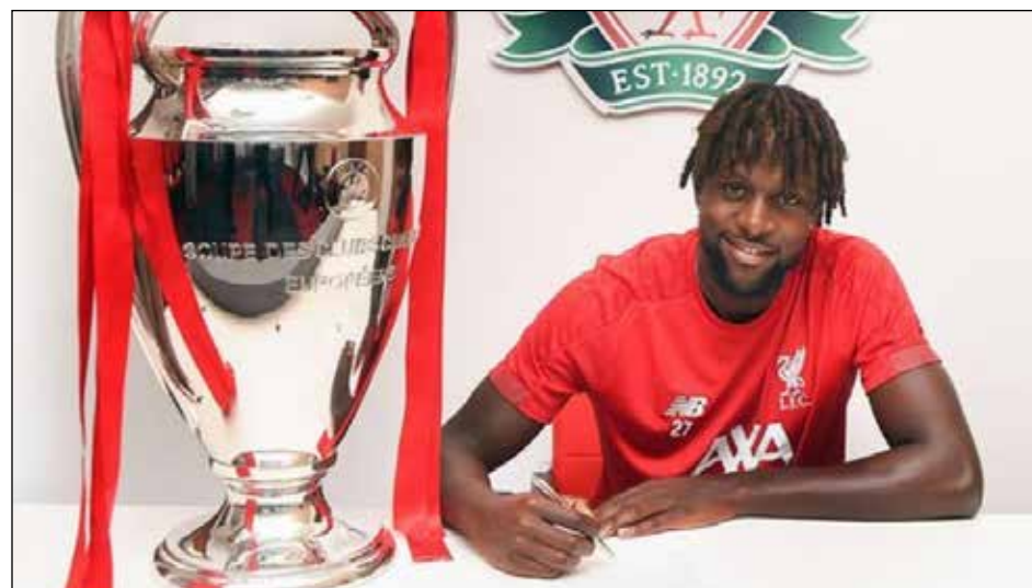
Divock Origi has scored 28 goals in 97 appearances for Liverpool

"It's a story really only football can write," said Liverpool manager Jurgen Klopp. "It didn't really work out at Wolfsburg and, coming back, he was thinking about leaving.