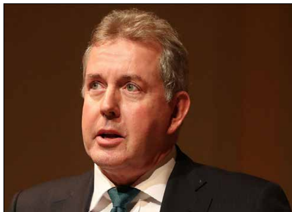
LEAKED EMAILS: Sir Kim Darroch had described Trump as 'clumsy and inept'

Europe Minister Sir Alan Duncan - who backs Mr Hunt in the leadership contest - said it was "contemptible