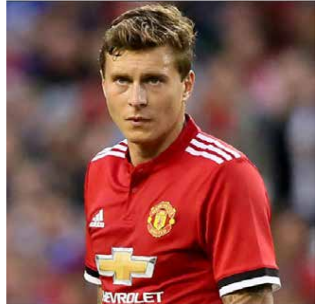
LINDELOF: headed to Barcelona?

Solskjaer's other problems include De Gea, who is out of contract next summer and yet to sign a new £350,000-a-week contract that is on the table,