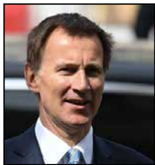
HUNT: 'black day'