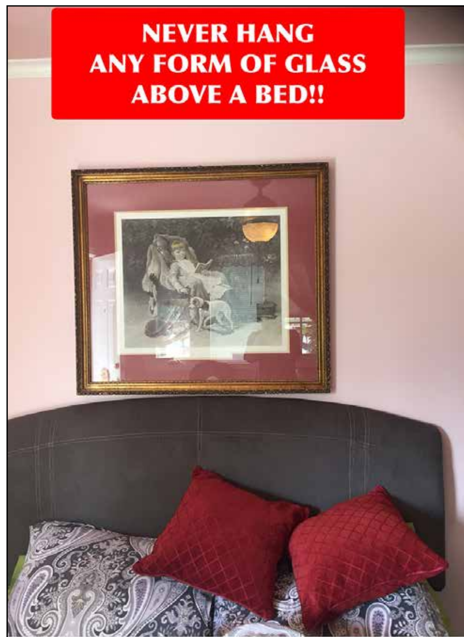
EARTHQUAKE SAVVY? This is definitely a no-no

In other news, it looks like there is a vacancy at the British Embassy in Washington... I feel very sorry for Sir Kim Darroch. I think he made the right choice to resign. As there was no way he could have continued as our British Ambassador. Being constantly diplomatic