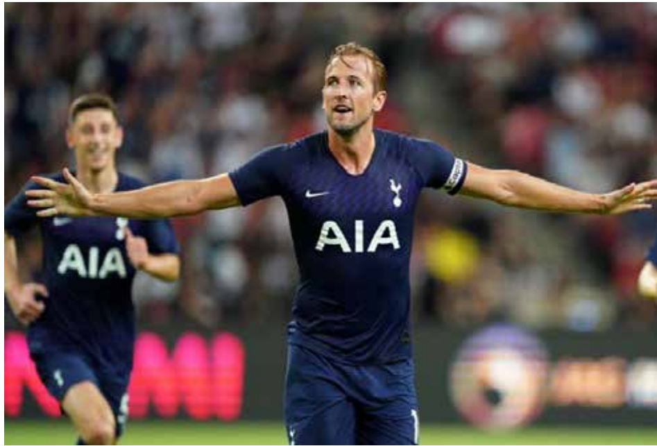
HARRY KANE: opportunistic strike against Juventus this week