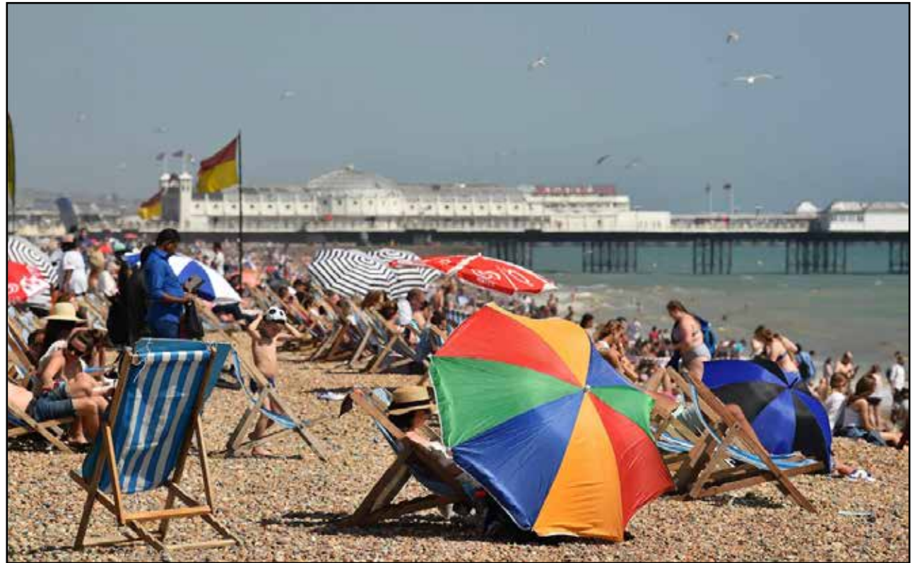
SOMETHING COOL: Brighton's beach were jammed by Brits seeking relief on Thursday

Mr Johnson's aides were understood to have reminded him of the rule.