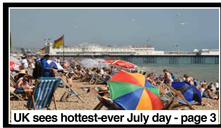
UK sees hottest-ever July day - page 3

California's British Accent™ - Since 1984