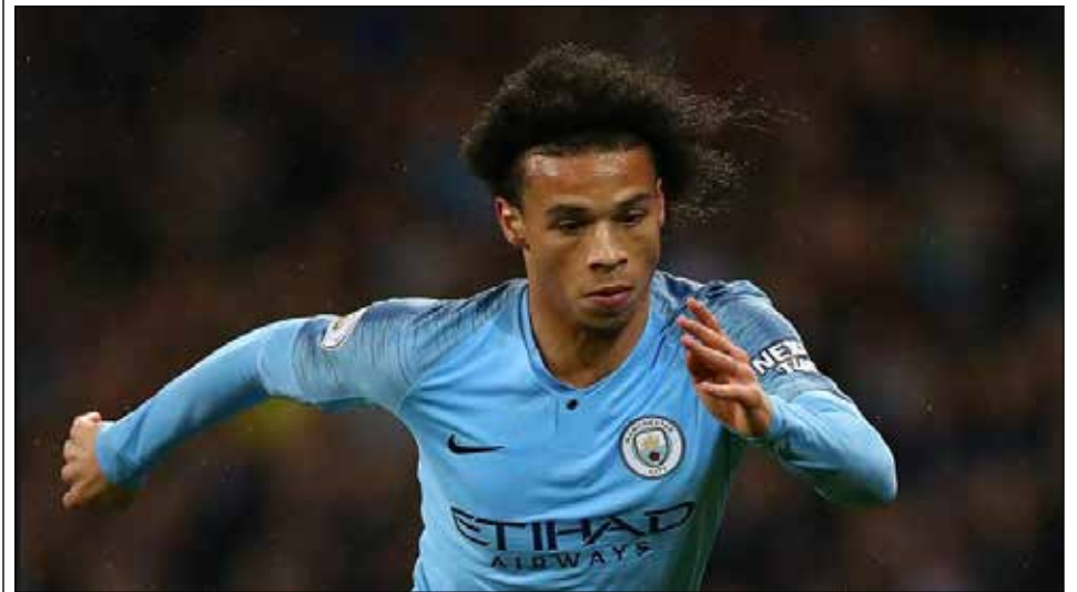
LEROY SANE: The Manchester City winger is wanted by Bayern Munich

Pochettino said it was Spurs' performance that mattered, not the victory. But the way his young side took the game to Maurizio Sarri's experienced team – playing with pace, energy and confidence – was impressive. Striker Troy Parrott, centreback Japhet Tanganga and midfielder Oliver Skipp all looked comfortable against the Italians. Ronaldo had let Spurs off the hook by fluffing first-half chances before Erik Lamela netted from close range. But Ronaldo made amends to equalise with a deflected shot to the delight of his fans in Asia. Gonzalo Higuain fired Juve in front but Tottenham record signing Tanguy Ndombele came off the bench for his debut and made an immediate impact. The Frenchman's first touch was a cool pass to Moura who made it 2-2 with a low strike. Then Kane stole the show with his long-range stunner.