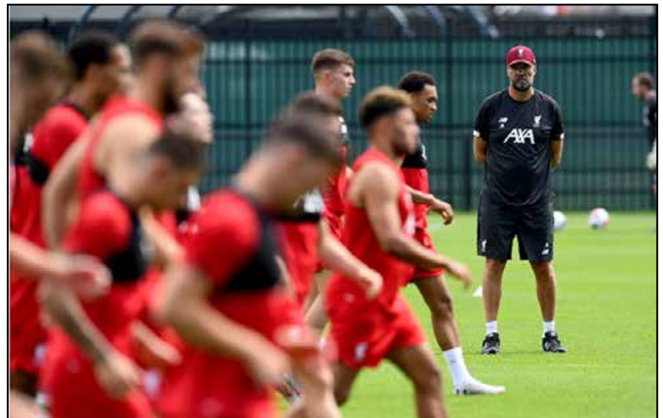
Jürgen Klopp is concerned for his players' long-term health

"For here (on pre-season) it is not a problem. We have all the boys here, apart from the three upfront and Ali (Alisson). That's not the biggest problem for Ali (only having a couple of weeks to prepare) but