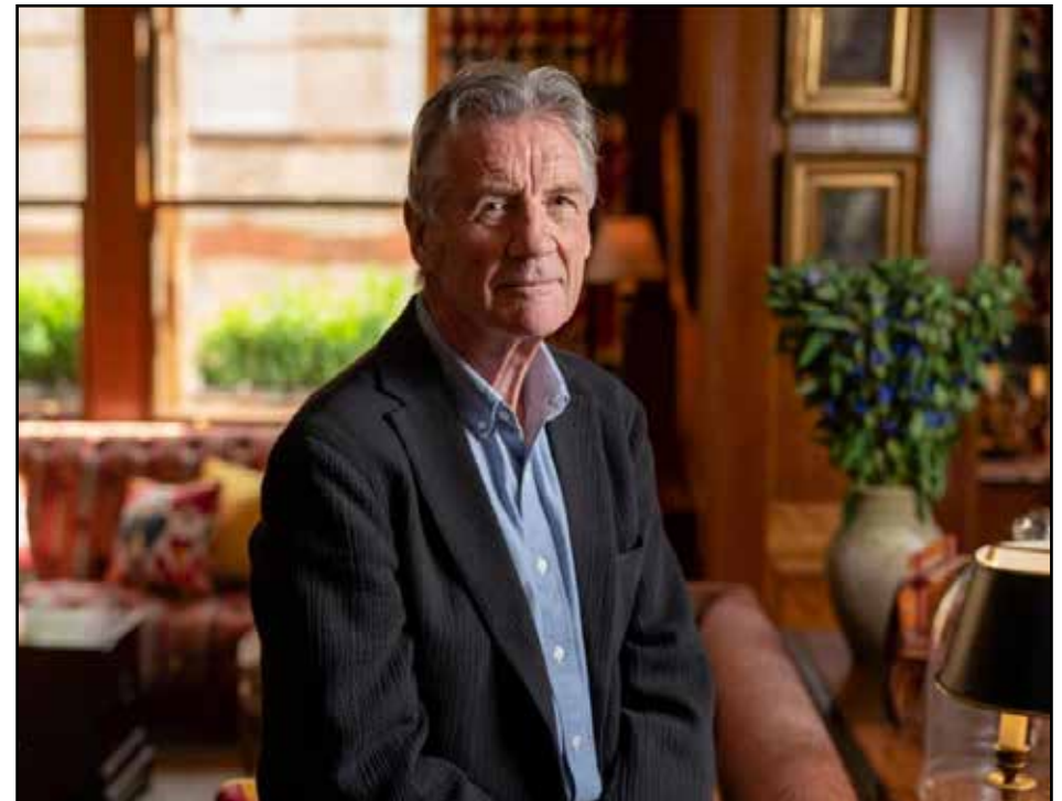
MICHAEL PALIN: "the best way to deal with the march of time is to fall in step with it ..."

The mitral valve is a small flap in the heart that stops blood from flowing the wrong way. According to the NHS website a surgeon will usually get access through a single cut in the chest but smaller