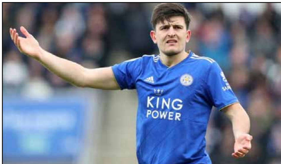
HARRY MAGUIRE: linked with both Manchester clubs this summer

Arsenal submitted an opening bid of about