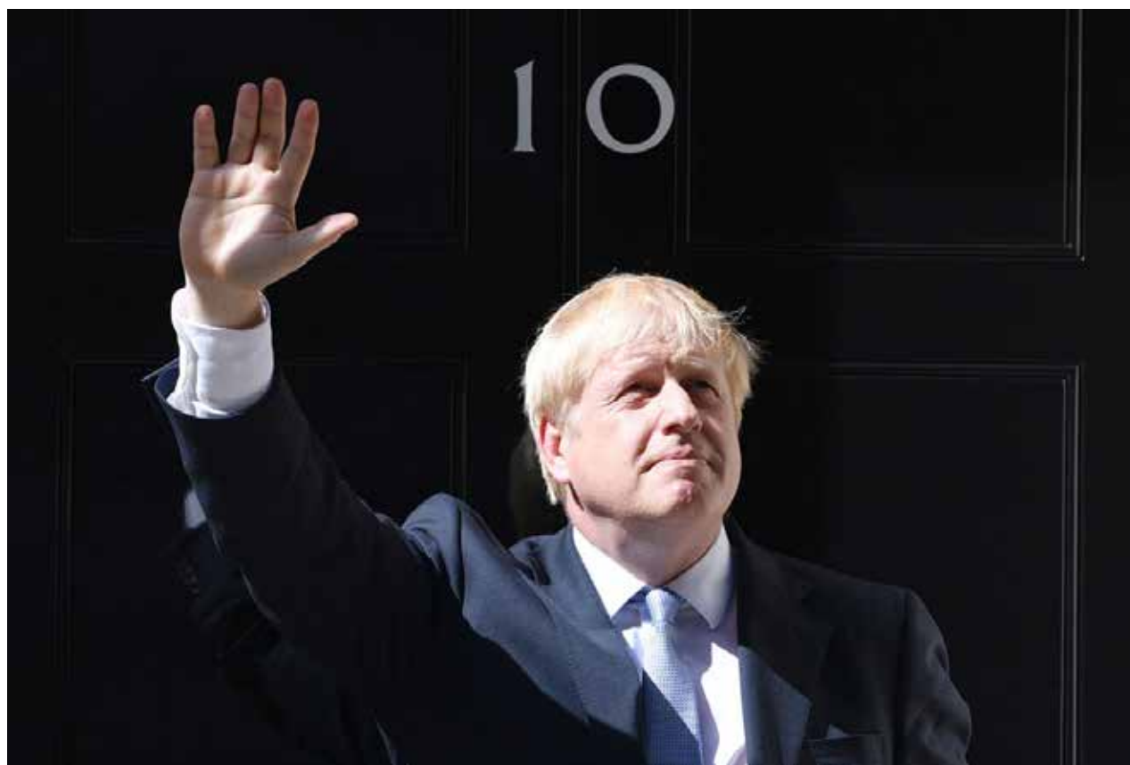
REWARDING FRIENDS, PUNISHING ENEMIES: Boris Johnson has dismissed 11 Cabinet ministers

The scale of the sackings, which will make managing parliament more difficult, has put Westminster on election alert. The nature of his opening address, which included pledges