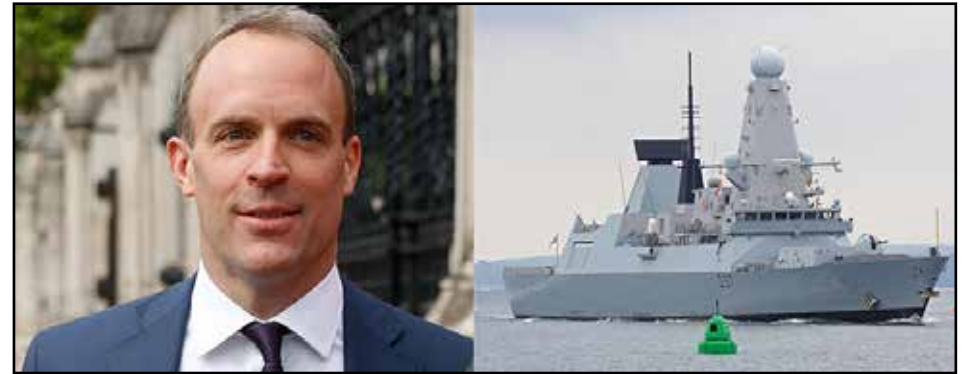
BAPTISM OF FIRE: new Foreign Secretary Dominic Raab faces a crisis in the Gulf as HMS Duncan approached the area to protect British shipping

New prime minister Boris Johnson is likely to find his hands tied militarily by decades of cuts which have left Britain with too small a force to escort every UK-flagged ship. Although HMS Duncan will double the number of UK warships in the area, HMS Montrose is due to go into port for a long-planned period of maintenance. Britain has four small mine counter-measure vessels in the Gulf, but will almost