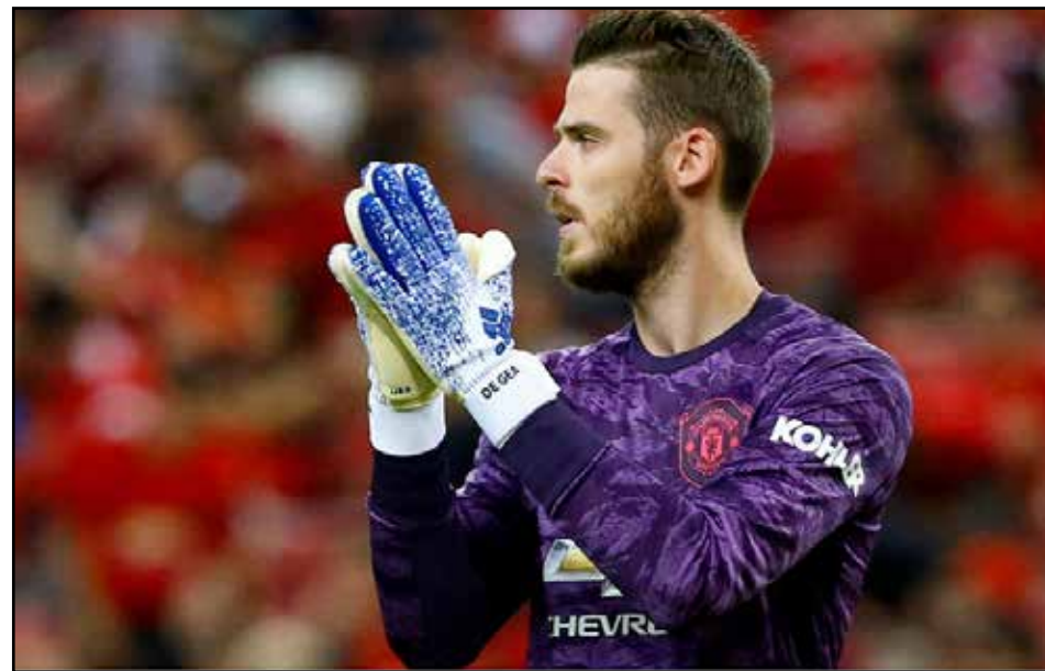
DE GEA: "We are Manchester United, we need to fight for trophies."

United backed away from talks last year as they felt the 26-year-old's £70m price-tag was excessive but they returned to make a bid for the same value earlier this month.