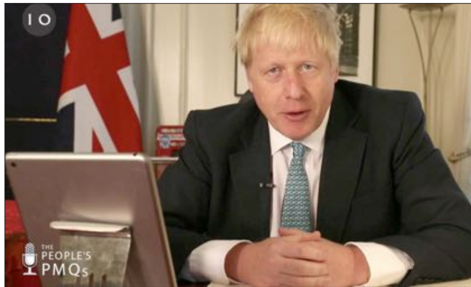
“Dangerous criminals must be kept off our streets,” Johnson said this week

Currently, many offenders sentenced to 12 months or more serve the first half in prison and the second half ‘on licence’ in the