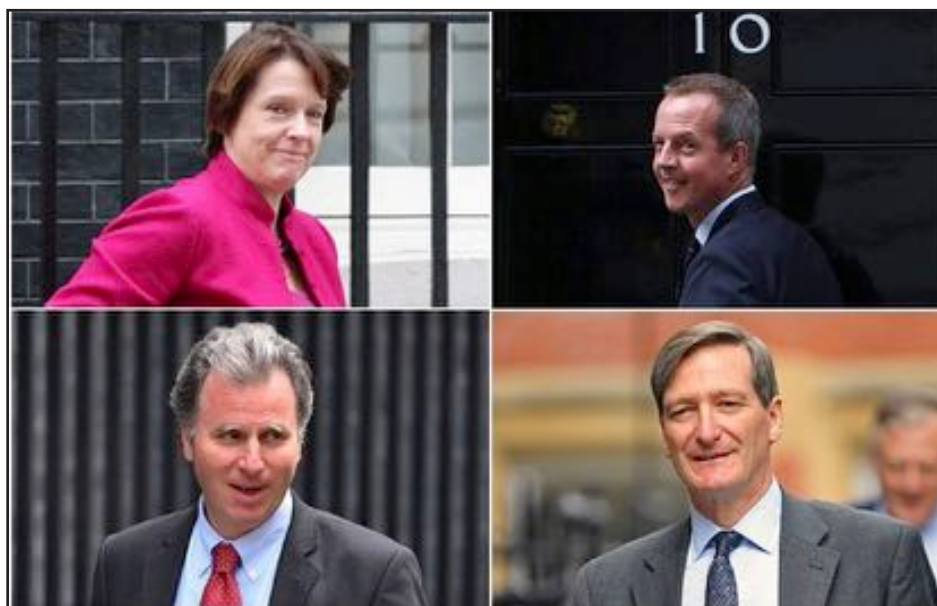
BREAKING WITH THE PARTY: Dame Caroline Spelman, Nick Boles, Sir Oliver Letwin and Dominic Grieve offered to meet with Jeremy Corbyn this week

Urging MPs to take Mr Corbyn’s plan “seriously”, he said: “A short-term Jeremy Corbyn government is less damaging than the generational damage that would be caused by