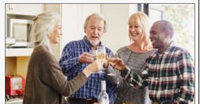
ONLY FOR OLDIES? drinking is increasingly considered undesirable by the young in the UK

revealed 11 million people have been asked for ID when buying alcohol under Britain’s Challenge 21 and Challenge 25 strategies.