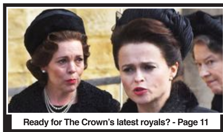
Ready for The Crown's latest royals? - Page 11