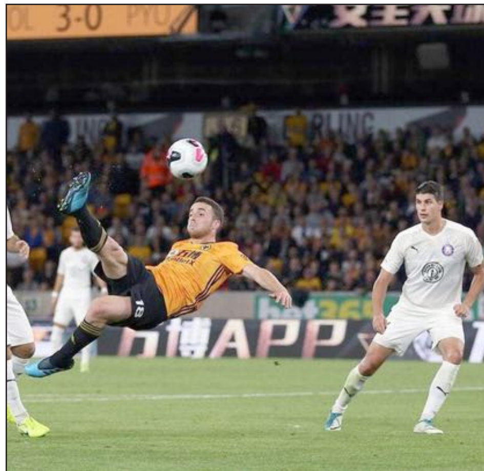
ONE FOR THE SCRAPBOOK: Jota's sublime finish on Thursday

The lack of urgency was clear in a first half largely devoid of chances and it was not until