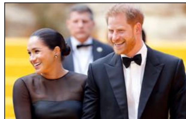
MEGHAN TO BLAME? Farage said that since Harry met his now wife, ‘it’s fallen off a cliff’.