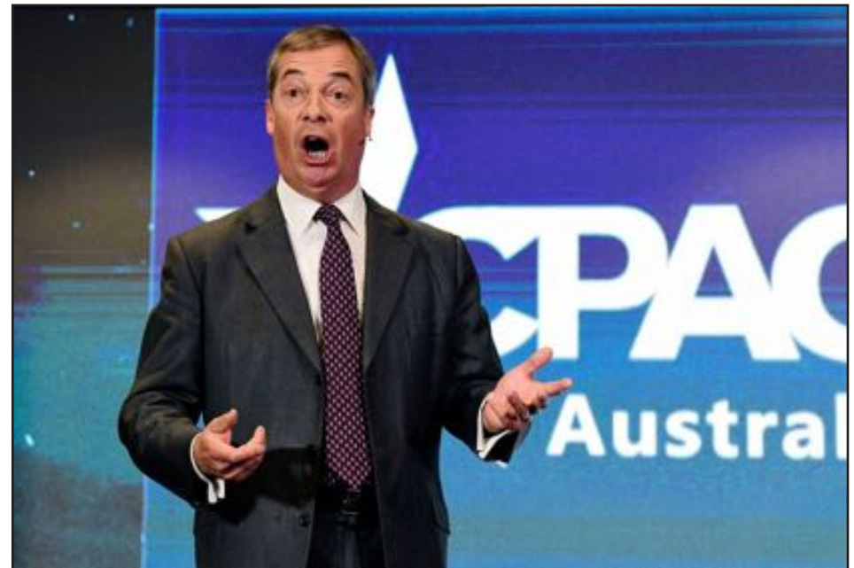
NIGEL FARAGE: his harsh words prompted one critic to describe him as “a blustering, cocksure foghorn”

Mr Farage, who was introduced to the conference as “quite possibly” Britain’s next prime minister, praised the Queen, describing her as “an amazing, awe-inspiring woman, we’re