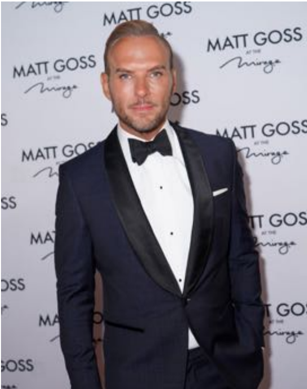
BEST OF BRITISH: Matt Goss has been a Las Vegas headliner for ten years