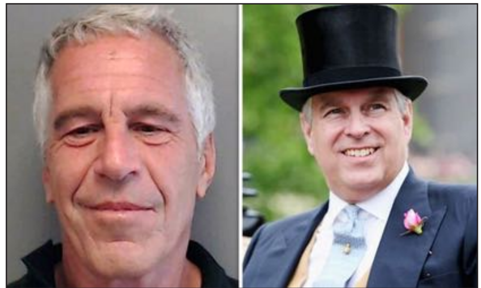
STRANGE BEDFELLOWS: Jeffrey Epstein numbered Andrew among his friends

"As an MP I despair about what has happened in Parliament over the last years," he said.