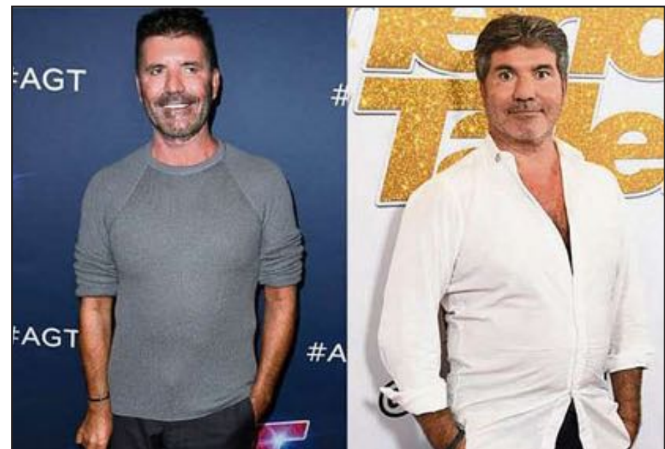
has not shrunk however is his ego. He said: "If I was on a one to 10 scale of being handsome, I was an eight and now I've gone to an 11."