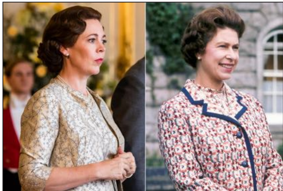
TO THE MANOR BORN: Oscar-winner Olivia Colman takes over the role of the Duke of Edinburgh from Matt Smith, while Helena Bonham Carter will play Tony Armstrong-Jones - a role previously played by Vanessa Kirby. Ben Daniels will take over as The new series will launch on the streaming service on November 17.

The new series of The Crown , covering 1964 to 1977, will see Tobias Menzies take over the