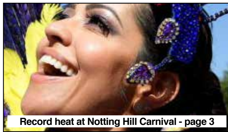
Record heat at Notting Hill Carnival - page 3