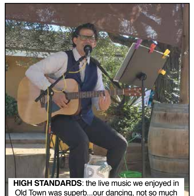
HIGH STANDARDS: the live music we enjoyed in Old Town was superb...our dancing, not so much

Dinner was spent in Little Italy at the most gorgeous steak restaurant called Born and Raised ( bornandraisedsteak.com ) which boasts tableside carts and smoking cocktails (and they do have a vegan option for those so inclined) it's a real gem of a restaurant, if a little bit pricey, but well worth it. After dinner drinks were spent at "False Idol" a hidden Tiki Bar at the back of a restaurant called "Craft and Commerce."