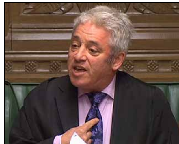
NOT HAPPY: Speaker John Bercow called Johnson's move 'a constitutional outrage'

Brexit Party leader Nigel Farage said the