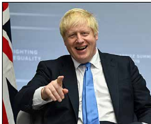
WHY SO SERIOUS?: “We need to get on with our domestic agenda,” insisted Johnson this week

Some of the PM's critics at home and abroad have described his move as a 'a coup', but Johnson himself insisted it was “completely untrue” to suggest that Brexit was behind his decision to suspend Parliament. He