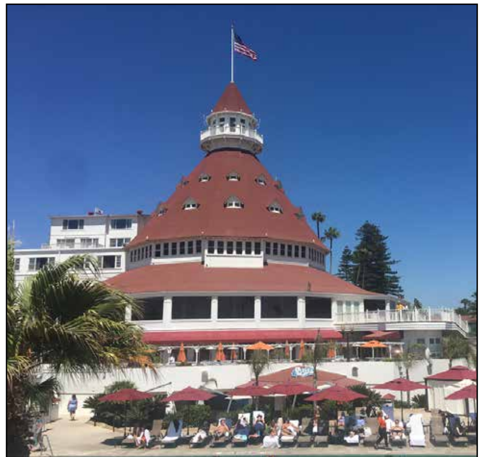
SOME LIKE IT HOT: the famed Del Coronado hotel

Dinner was spent in Little Italy at the most gorgeous steak restaurant called Born and Raised ( bornandraisedsteak.com ) which boasts tableside carts and smoking cocktails (and they do have a vegan option for those so inclined) it's a real gem of a restaurant, if a little bit pricey, but well worth it. After dinner drinks were spent at "False Idol" a hidden Tiki Bar at the back of a restaurant called "Craft and Commerce."