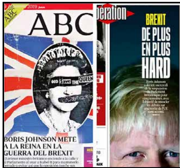
ABC in Spain, Liberation in France and De Morgen in Belgium all condemned the Johnson plan, with one paper describing it as 'the death of British democracy'

In Belgium, La Libre's front page declared the move a "dangerous coup by Boris Johnson".