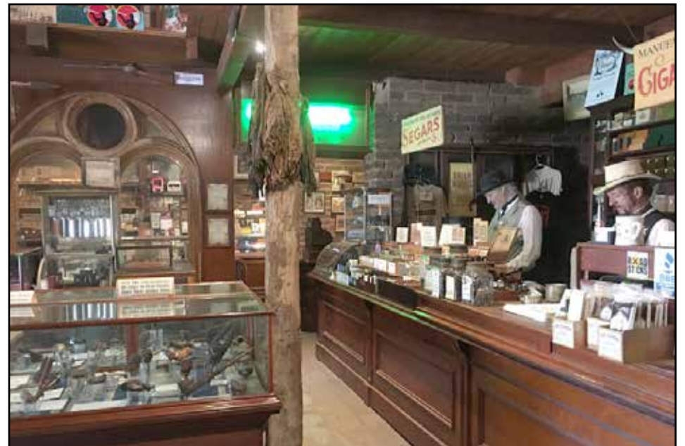
ATMOSPHERIC: San Diego's rich Western and Spanish heritage can be found everywhere in Old Town

Soon after checking in and dropping our bags we set off for San Diego's Old Town for a spot of shopping, margaritas and dancing. Not necessarily in that order. As you walk around the many stores and restaurants one common theme emerges, music and dancing is everywhere. It's a real celebration of the Mexican culture. Old Town San Diego marks the site of the first Spanish settlement on the U.S. West Coast and features 12 acres of Mexican heritage and historical sites, colorful shops, early-California-style restaurants, museums, a theater and the restored Cosmopolitan Hotel. I can only imagine what the cinco de Mayo celebrations are like here... Lisa and I danced to live music in the town square. I'm sure I was less Despacito and more Desperado though! Hey, I'm a gringo!