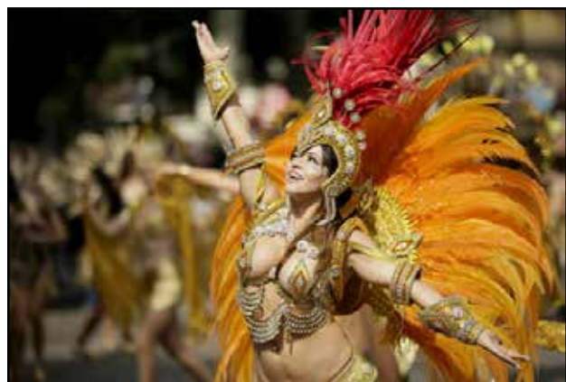
JUST LIKE RIO? The London School of Samba were among the participants at the famed Carnival

been the hottest day in the traditional Caribbean carnival's 50-year history. Nearly 12,500 police and 1,000 stewards attended the two-day event to ensure a "safe and spectacular" festival. Scotland Yard has also increased the number of screening arches used to detect knives and other weapons.