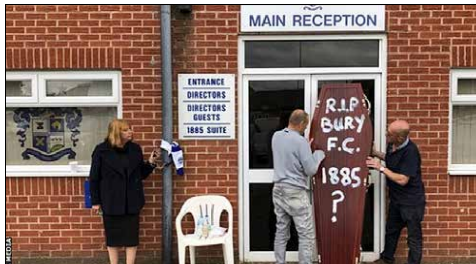
SIGN OF THE TIMES: Bury fans at Gigg Lane show their feelings at the club's demise

However they said on Tuesday they would "continue to work through