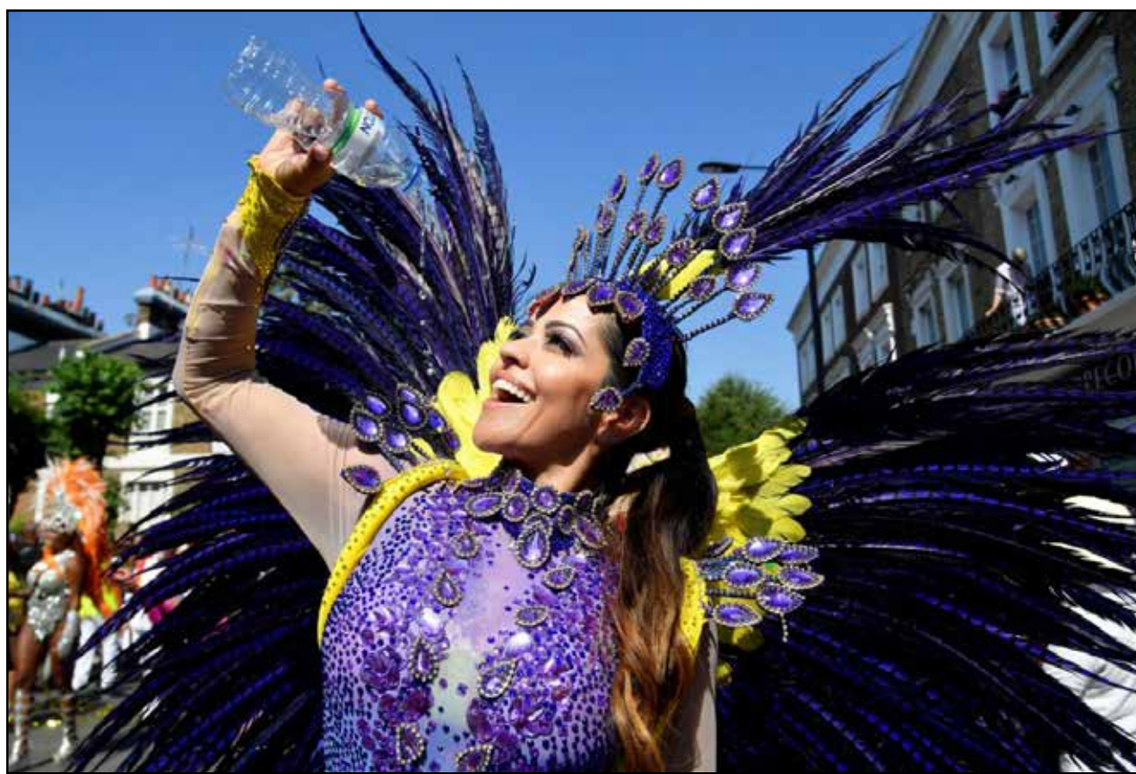
HOT, HOT, HOT? A reveller waves to crowd on Westbourne Park Road. Temperatures climbed into the 90s at what organizers described as a 'safe and spectacular' festival

hottest place to be, hitting nearly 92F – just over 33C – in the afternoon. Sunday's scorcher comes just a month after Britain's second hottest day brought a high of more than 101F in Cambridge.