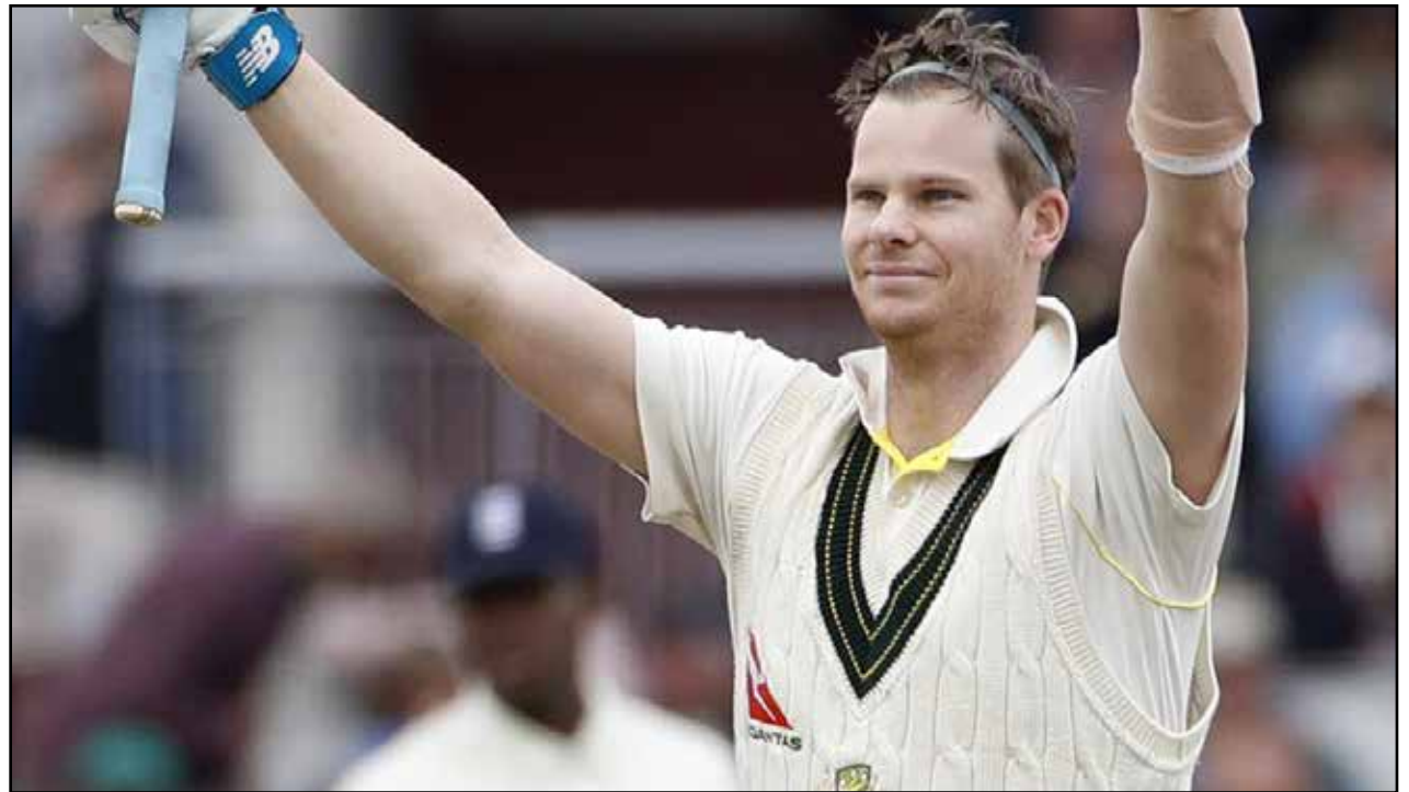
THE NEW BRADMAN: Steve Smith hammered 211 for Australia at Old Trafford

Much of the pre-match hype had focused on the resumption of Smith's battle with Archer but while the former was left toasting another wonderful achievement, the paceman left the field wicketless for the first time in Test cricket and with his worst first-class