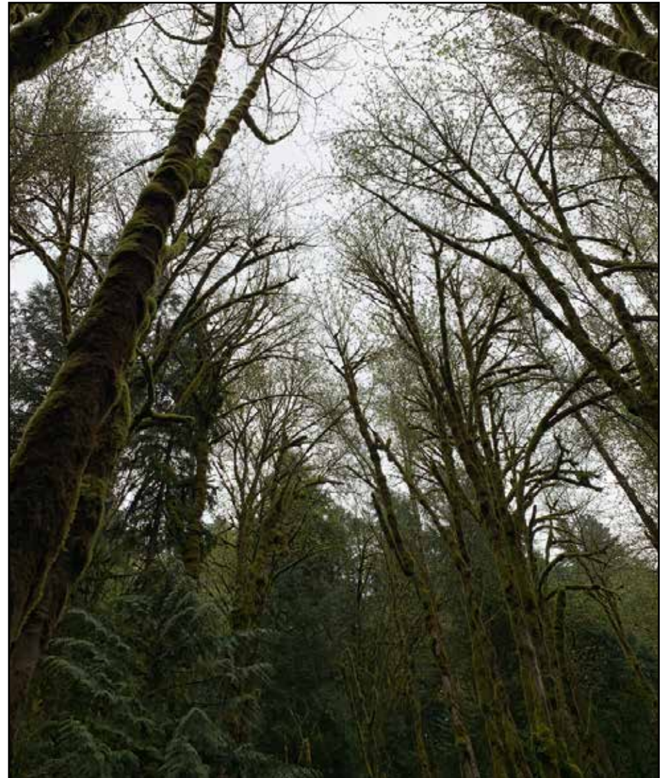
TOTALLY IMMERSIVE: The VR experience 'Tree' takes you right into the heart of the amazing Amazon

A few days before news of Brazil's fires broke, I got to try out a new VR experience simply called "tree" wherein you start out as a little seedling, breaking the earth's soil and growing into a beautiful gorgeous tree, with the wonders of nature all around you, coincidentally, in the Amazon. The sounds of running