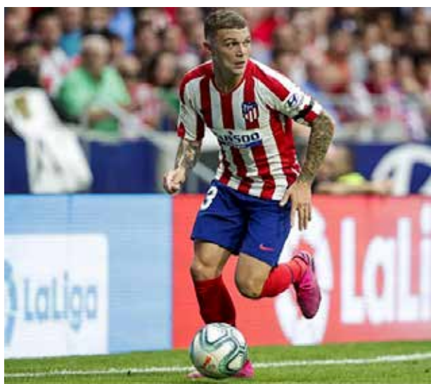
TRIPPIER:: thriving at Atleti

The Atletico Madrid defender felt he was forced to leave White Hart Lane after his poor form was made worse by the constant rumours saying that he was no longer part of Pochettino's plans. But after admitting to having a poor season after scoring in the World Cup semi-final, Trippier believes that if he had been treated differently,