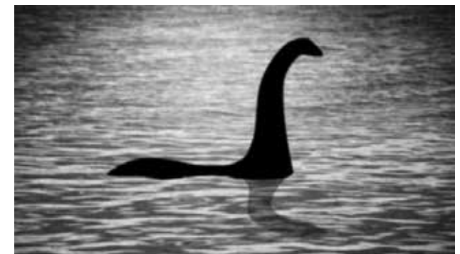
Giant eels could be the most logical solution to the Loch Ness puzzle, scientists now say

“Eels are very plentiful in Loch Ness, with eel DNA found at pretty much every location sampled – there