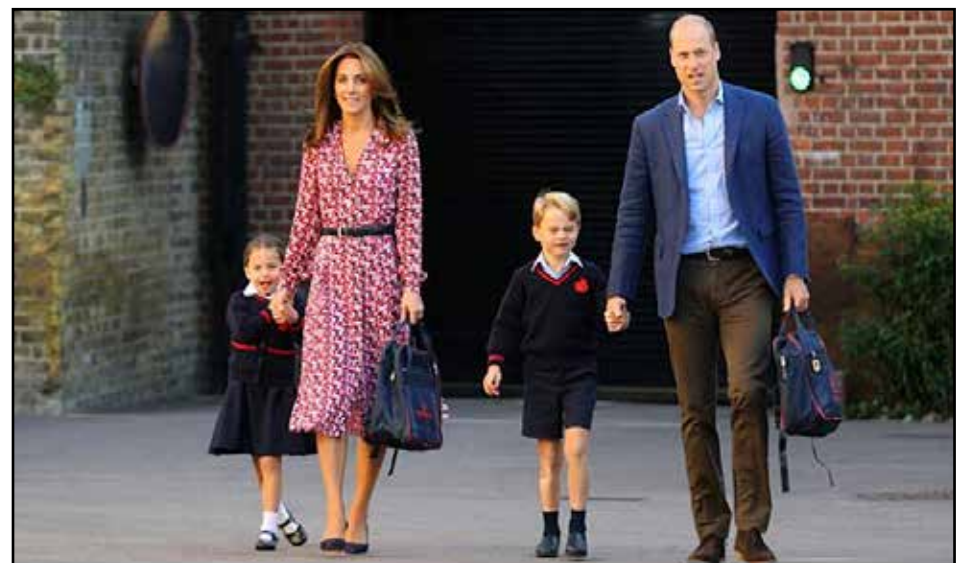
Princess Charlotte arrives with her mother, the Duchess of Cambridge, brother Prince George and father the Duke of Cambridge

Kate said: "How are you? Did you have a nice