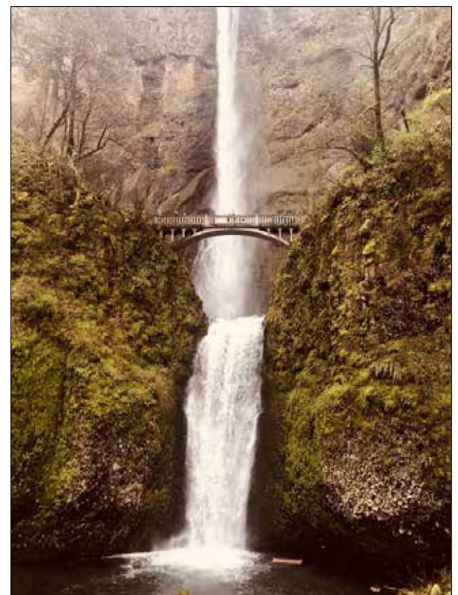
ALL YOUR SENSES: parrots, monkeys and yes, waterfalls, are all part of the "Tree" experience

water in the distance in your headphones, and the sound of parrots who come to perch on your branches, monkeys playfully swinging on your vines are all there, until, in the far distance you start to see smoke, coming towards you at a rapid pace. The VR Operator lights a match under your nose to heighten your senses, but you are a tree and you can't run anywhere - your trunk is firmly planted in the ground - you can do nothing but await your demise. I looked down and saw my trunk slowly burning - the VR operator has a heated Dyson fan at my feet. It felt so real and as I looked up to the sky... I was helpless. It's an emotional journey and one that truly moved me. Nature truly is remarkable and lets face it - trees, bushes and plants are all living