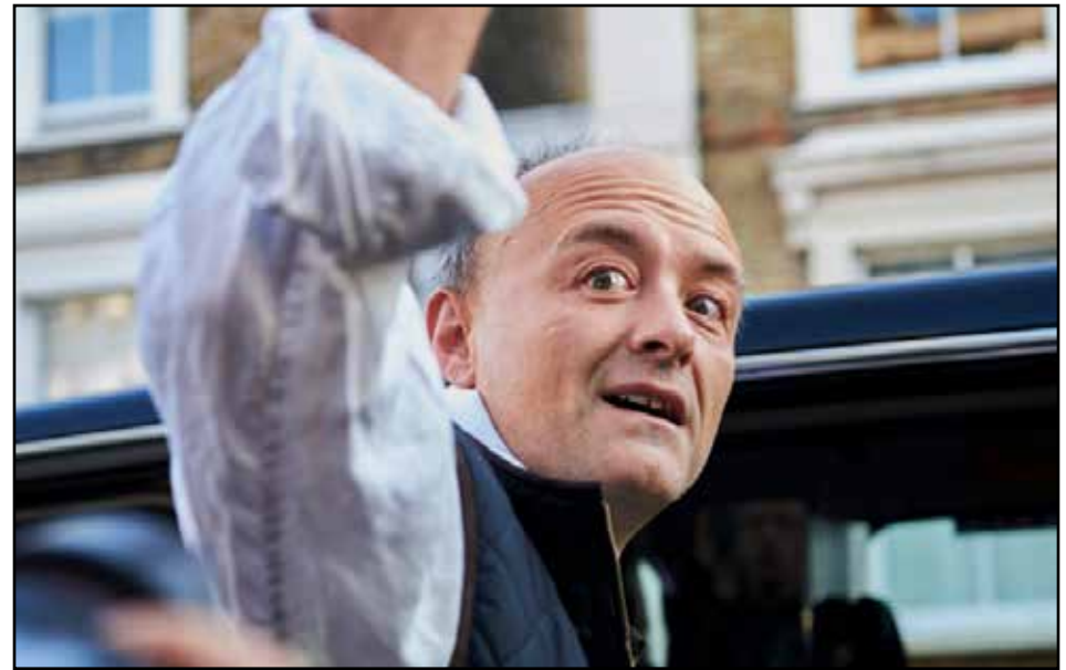
STRANGE BEDFELLOWS: "The Tory Party is run by people who basically don't care about people like me," - Dominic Cummings, now a fixture at No. 10

Describing Cummings as "the perfect foil" to Sir Eddie Lister, Mr Johnson's "calm and considered" co-chief of staff, the source added: "I've not heard Dom raise his voice but he does do a lot of his business standing up and pacing around. He inherited a lethargic, undynamic government and made it much more responsive. The easiest thing to do is to love the PM and hate the adviser but every decision that's been taken is because Boris has decided to take it. You do need a complete f----- behind the scenes getting this stuff done".