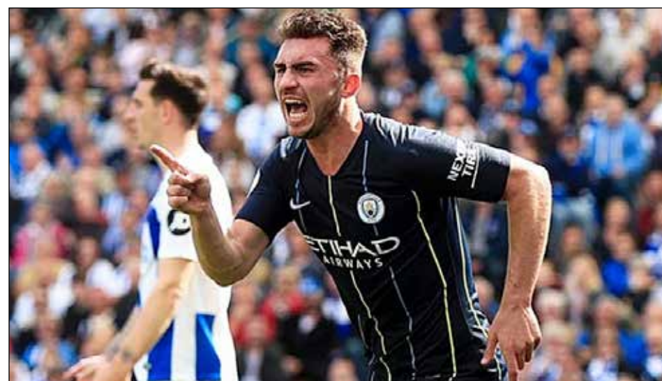
Aymeric Laporte made 51 appearances last season for Manchester City

However, following his £20million move to Atletico, Trippier is back in the England squad for the upcoming double-header against Bulgaria and Kosovo with his new club sitting top of La Liga. And in a final dig in the ribs for Tottenham, the 28-year-old says he is benefiting from working with coach Diego Simeone. "I think he can take me to the next level," he said. "For a defender I don't think there's a better place in the world to be."