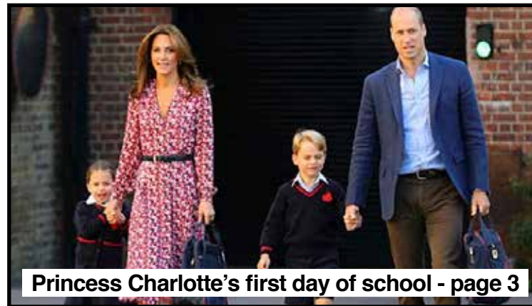
Princess Charlotte's first day of school - page 3

California's British Accent™ - Since 1984