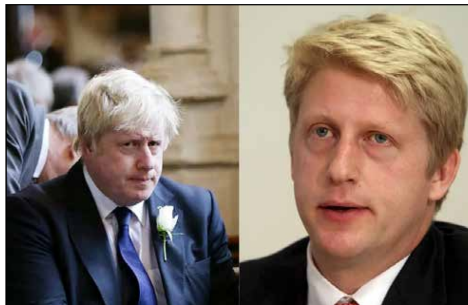
FAMILY ISSUES: Boris Johnson and (right) brother Jo Johnson

During his speech at a police training centre in Wakefield, the prime minister reiterated his call for an election, which he wants to take place on 15 October.