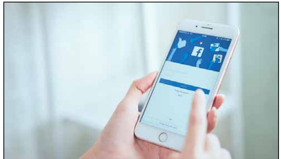
420m Facebook users worldwide had their names and phone numbers ‘scraped’