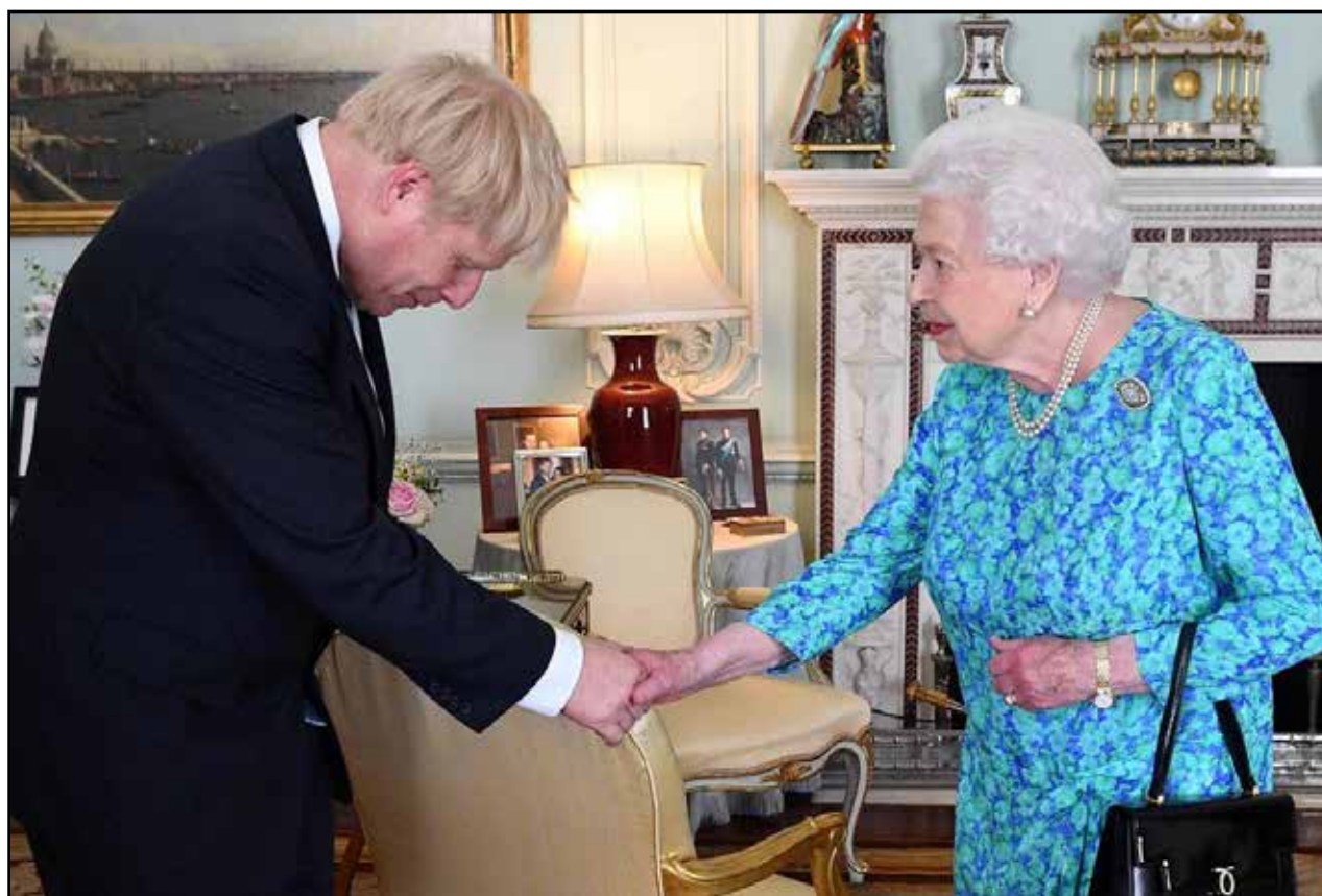
SHAKY RELATIONSHIP? Johnson is accused of misleading the Queen over his motives for proroguing Parliament

Mr Johnson has suggested it was "nonsense" to suggest the move was an attempt to undermine democracy, insisting it is normal practice for a new PM.