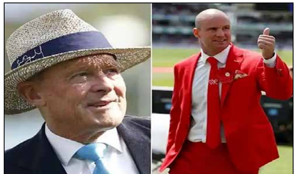
FAVORITE FIGURES: Theresa May is a keen cricket fan, perhaps explaining her decision to honor former England cricket stars Geoffrey Boycott and Andrew Strauss