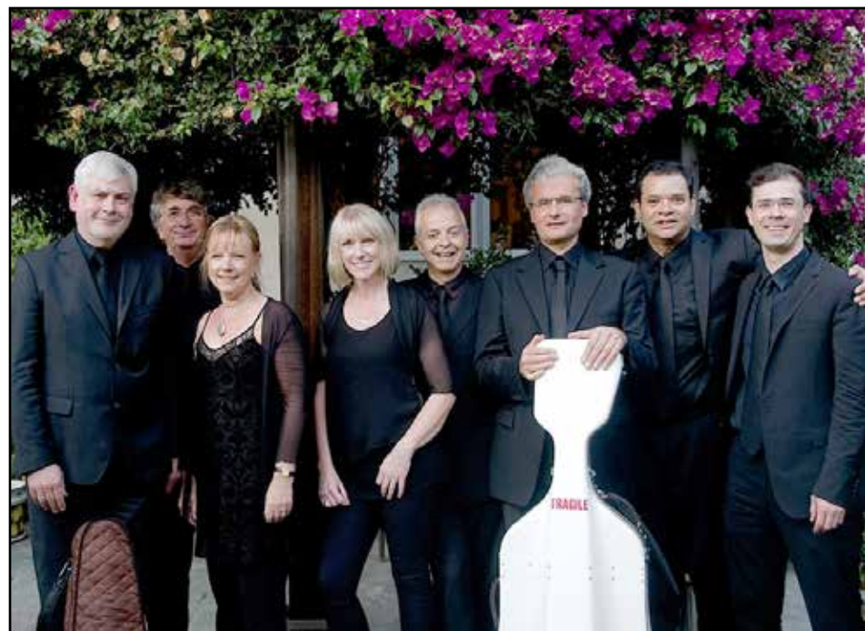
The Academy of St Martin in the Fields Chamber Ensemble - "An ensemble of first-rate musicians, technically superb, generously expressive and obviously enjoying themselves." — Dallas Morning News