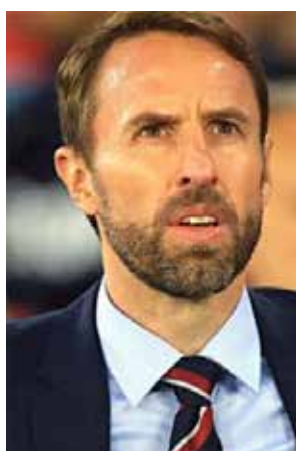
"A bizarre game really," said Southgate

as rampant England, inspired by the magnificent Raheem Sterling, responded ruthlessly with five goals inside the first 45 minutes.