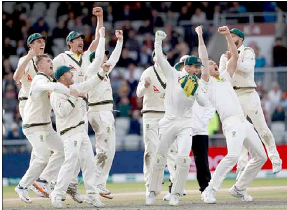
SWEET VICTORY: Australia celebrate retaining the Ashes on Sunday