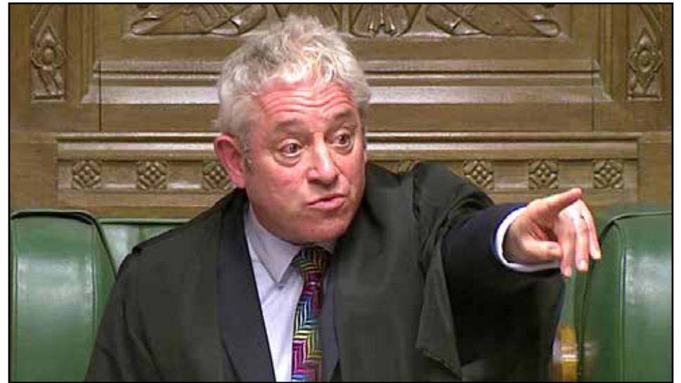
John Bercow: "Not obeying the law must surely be a non-starter. Period."

The UK is due to leave the EU on 31 October, but