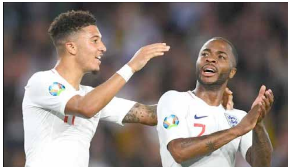
POWER COUPLE: Jadon Sancho and Raheem Sterling starred at St Mary's

"So, actually it was in many ways a better experience than strolling through the game at five, six or whatever, even though we probably all could have done without it."