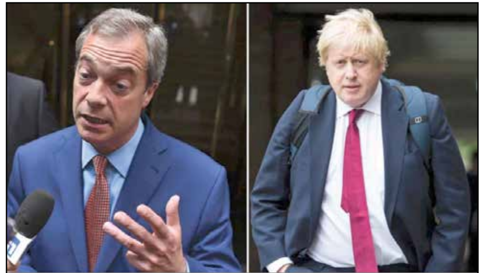
FARAGE ON JOHNSON: "It's a massive decision for him but if he wants to win the election with a workable majority I don't think he's got any other option."

is one little proviso – we do not want the Withdrawal Agreement, the European treaty, to be revisited. It would appear his tactic is to get the backstop changed.