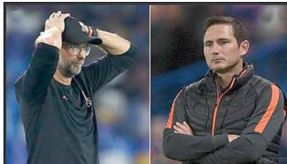
SETBACKS: Klopp saw the Reds go down 2-0 in Naples, while Lampard's body language says it all during Chelsea's 1-0 home loss to Valencia

"We probably should have won, or at least