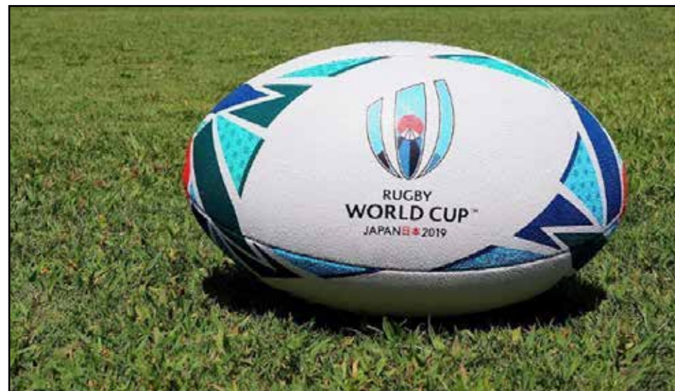
HERE WE GO: The Rugby World Cup runs from now until the final on November 2

If one of the home nations is to bring home the William Webb Ellis Cup for only the second time, and the first since England landed the prize in 2003, they will need to break a southern-hemisphere stranglehold.