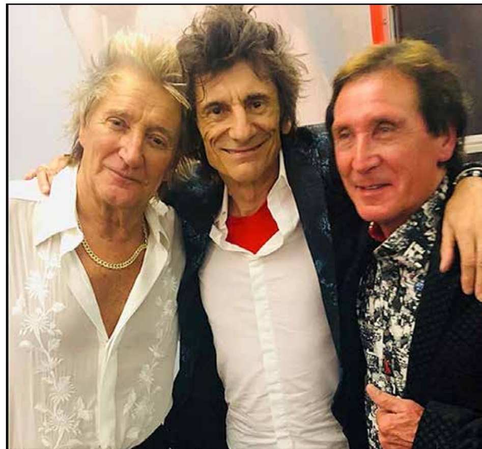
ROCK OF AGES: Rod Stewart in Surrey this week with former Faces bandmates Ronnie Wood and Kenney Jones