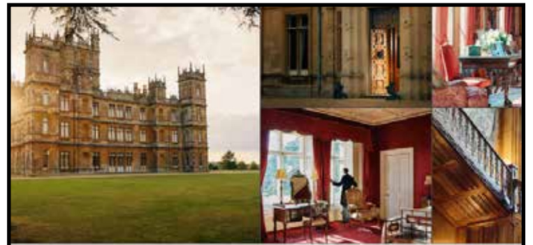
Downton home comes to Air B&B - page 4