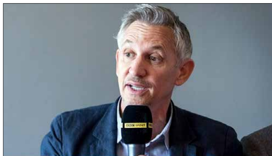
THAT'S RICH: the highly paid former England striker also fronts BT Sports Champions League coverage

"There are pundits on Sky that in recent times are paid double what I'm on,