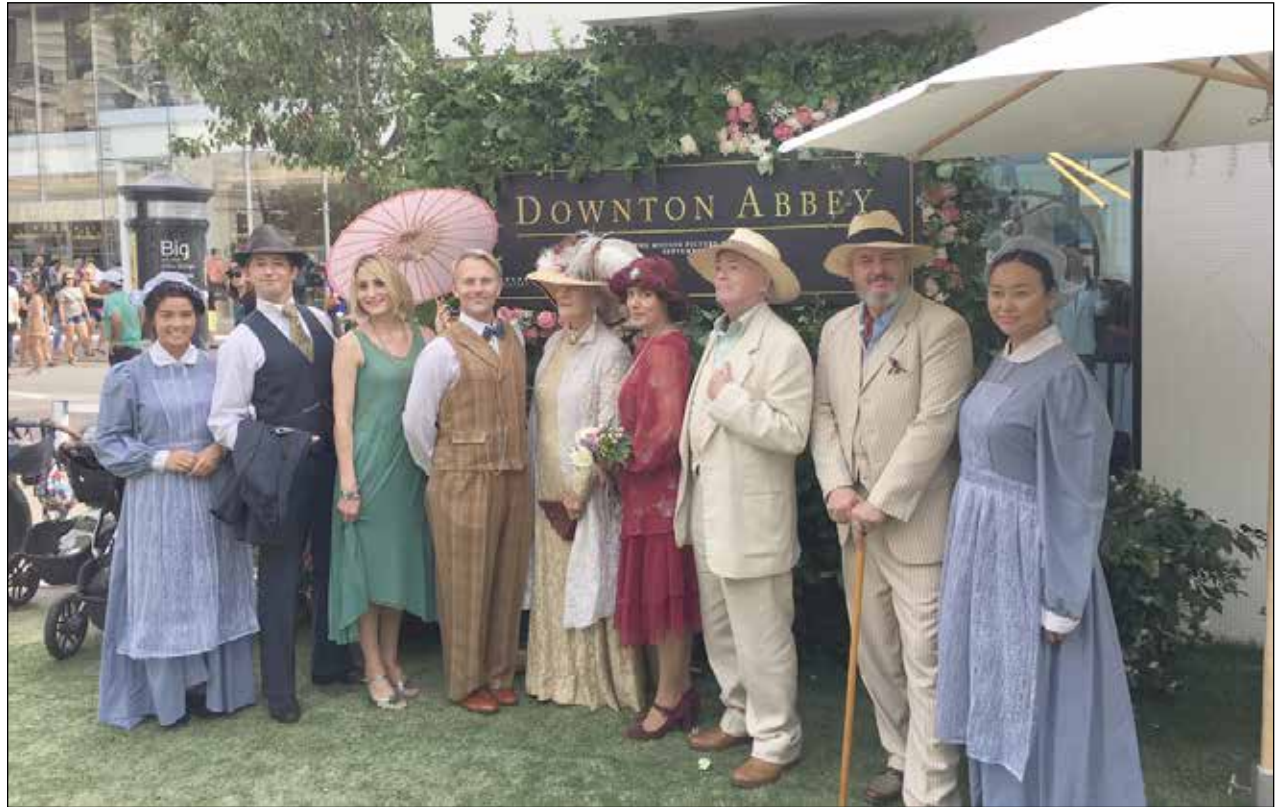
DRESSING THE PART(Y): (above) getting into the spirit of Downton at the Grove last weekend and (below) the fun continued at Cecconi's at Tuesday's British Breakfast

Meanwhile Tuesday morning was also another chance to celebrate everything Downton. As guests sat down and enjoyed a full English breakfast at Cecconi's in West Hollywood, Focus Features provided wonderful prizes for all those who made the effort to dress up.