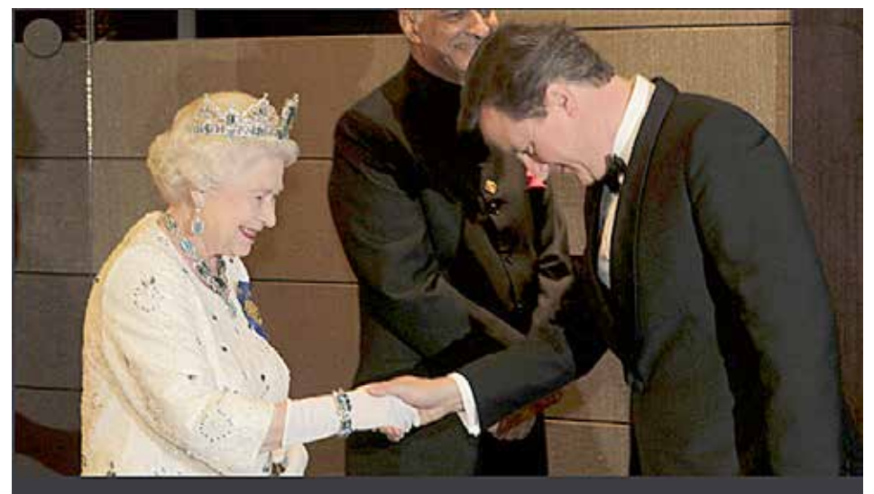
HE'S NOT THE PRIME MINISTER....he's a very naughty boy. Alex Salmond criticized the disclosure, saying: "David Cameron was clearly trying to mobilise the Queen to help his political interest."

At First Minister's Questions in Holyrood, Nicola Sturgeon was asked whether she was