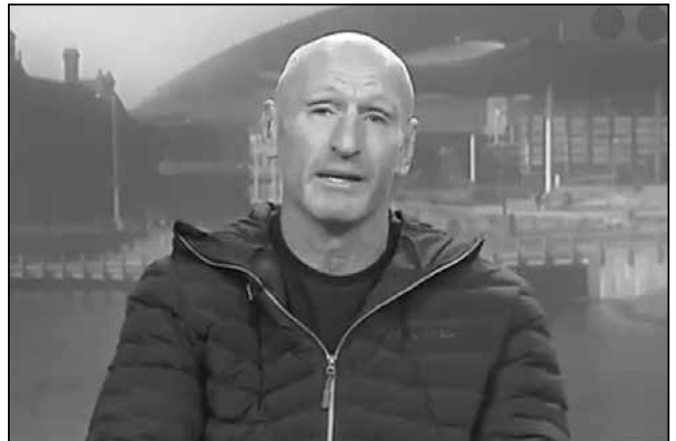
GARETH THOMAS: the UK's first top sportsman to talk openly about the condition and (below) Thomas embracing his husband during last week's Ironman Wales

Famous names lined up to praise Gareth. TV presenter Carol Vorderman, 58, tweeted: "We love you Alfie. You will always have our support x."