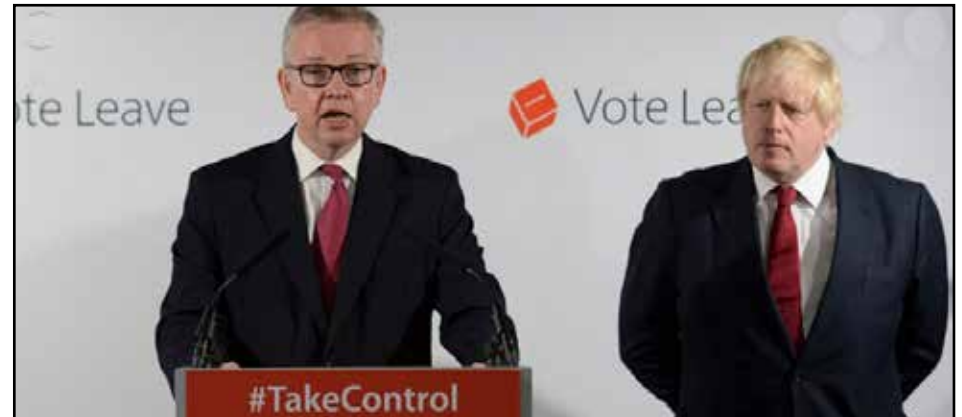
HARD WORDS: Cameron accused Michael Gove and Boris Johnson of becoming "ambassadors for the expert-trashing, truth-twisting age of populism."

long-awaited book, For The Record , the ex-PM also writes about his decisions regarding the EU referendum. He said: "There are those who will never forgive me for holding it, or for failing to deliver the outcome – Britain staying in a reformed EU – that I sought."