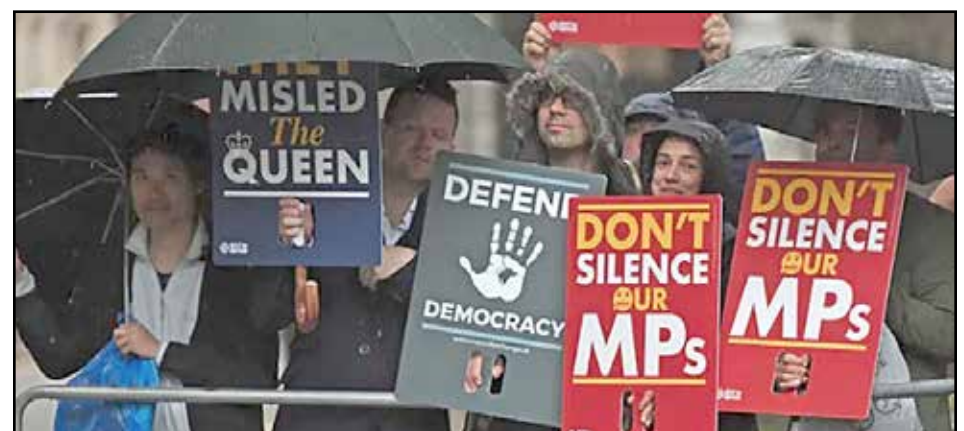
BIG STAKES: Protesters outside the Supreme Court welcomed the verdict