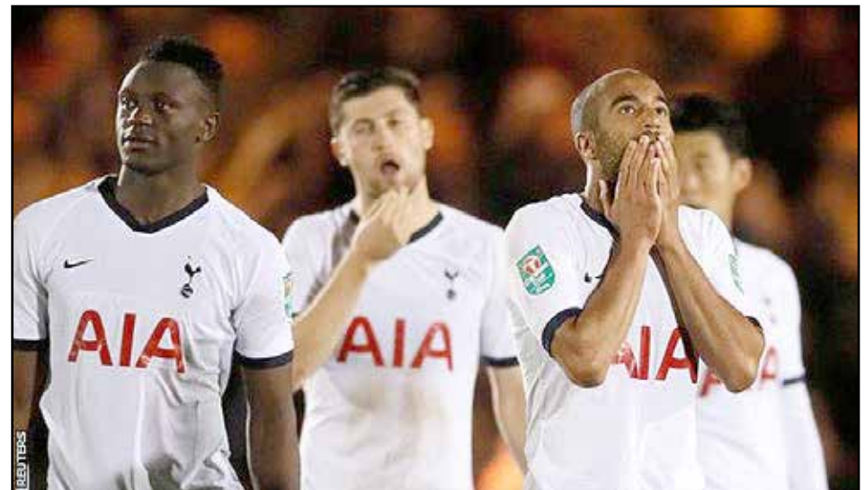
BACK TO BEING SPURSY? Tuesday night would suggest so...

because we dominated last third in the way you job, and this lack of the 90 minutes, but we expect. aggression in the last third were not aggressive in the "It's about doing your made the reality."