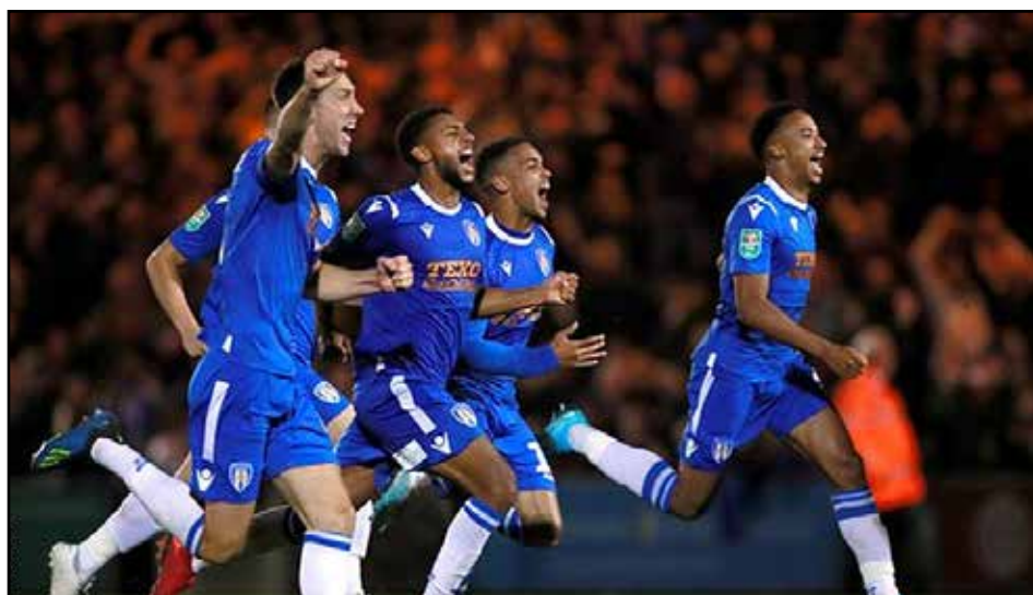
JOY UNCONFINED: Colchester's players react to their stunning upset

10am Az vs Man Utd Noon Arsenal vs Standard Liege