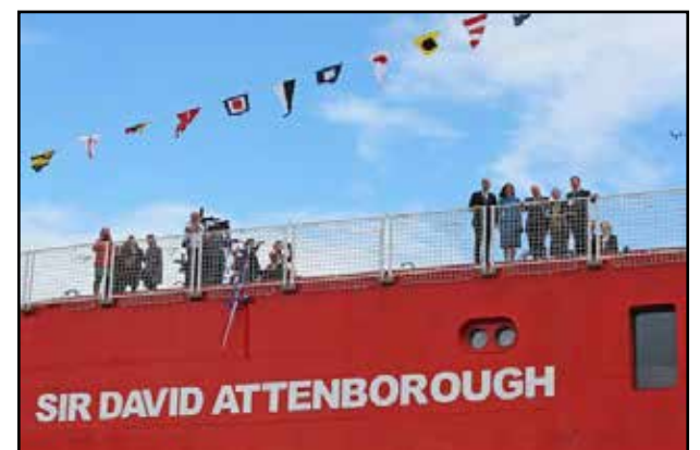
A BIT MORE DIGNIFIED? One of the ship's submersible vehicles will be named Boaty McBoatface

"There could be no more important function for any ship, anywhere in the world, than those which are going to be dealt with by this remarkable