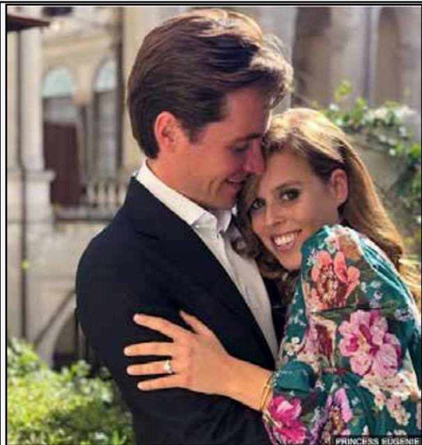
The couple said they were 'extremely happy' to share news of their engagement