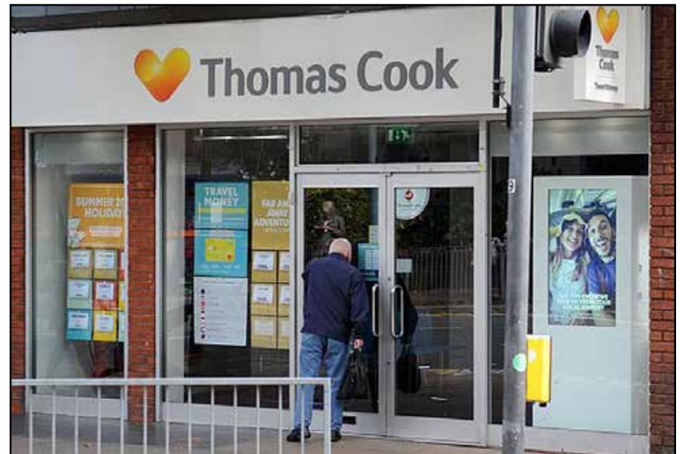
IF IT CAN HAPPEN TO THEM: Thomas Cook was founded in England in 1841

What can you do to protect yourself when you book future travel? I would recommend booking everything with a credit card, and if possible a card that offers travel protection. I hear that the Chase Sapphire Card is excellent, however it does come with an annual fee of $450; although I am sure it is worth it if you ever have to claim. Contrary to popular belief, the American Express