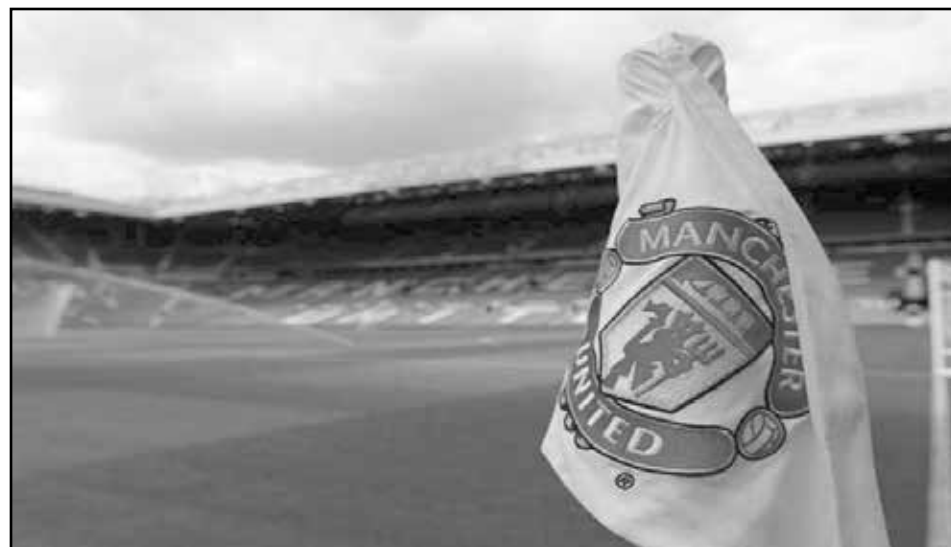
INCOME FAR FROM FLAGGING: Revenues hit a record £627m at Old Trafford

There is now a real danger of the club falling behind their traditional rivals in mainland Europe for the right to be branded the world's richest. Last week, Spanish giant