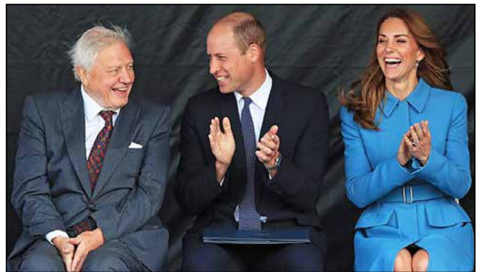
Sir David Attenborough with the royal couple: "There has never been a more important moment for this ship to get to work," the Duke said.

"As last week's climate protests the world over and yesterday's report on our oceans and frozen regions demonstrated, there has never been a more important moment for this ship to get to work," the duke said. "And there is no person