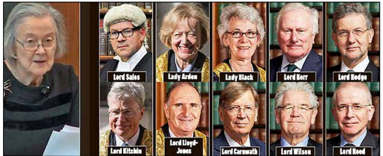
PUTTING THE BRAKES ON: The eleven-member Supreme Court was unanimous in its ruling

The mood in Westminster grew even more polarized and vitriolic following the decision, with figures on both sides of the Brexit divide told to “mind their language” and