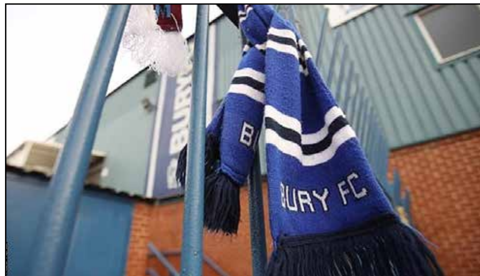
Bury must now apply to the Football Association for a place in non-league football.

local MPs, the Mayor of Greater Manchester Andy Burnham and supporters' group Forever Bury - wrote to the EFL to plead for the club's reinstatement, with confirmation of "active bidders" and