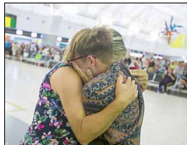
MISERY: Stranded holidaymakers at Las Palmas airport in the Canary Islands on Tuesday

On Wednesday the Civil Aviation Authority launched Operation Matterhorn to repatriate British tourists, using 45 aircraft leased from other airlines. The programme, which will last two weeks, will focus on 53 airports in 18 countries including the United States, Mexico,