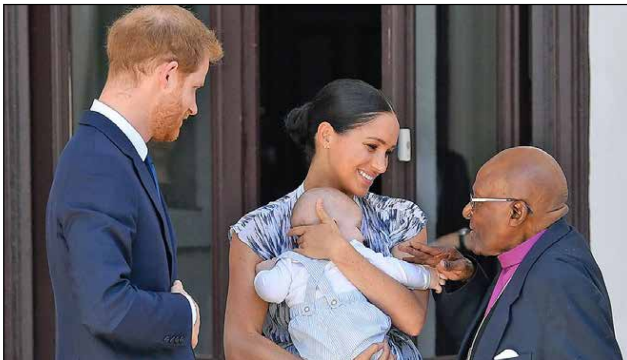
OLD SOULS? The royal couple spent 30 minutes with Archbishop Tutu at his Legacy Foundation

Later Meghan, 38, met female entrepreneurs at a city tech-hub. She revealed that she was enjoying being a working mother, despite the added pressure of being a royal. Meghan told mum-of-