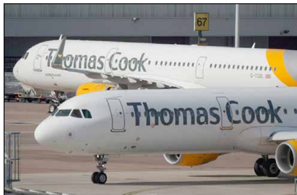
GROUNDING: Thomas Cook collapsed after failing to secure £200m in funding

with holiday company tactics were not already bad enough, it emerged that rival holiday companies were quick to exploit the lack of alternatives by raising their own prices, with the cost of one Jet2 break to Cyprus almost doubling to £800 within a few hours of the news of the Cook collapse.