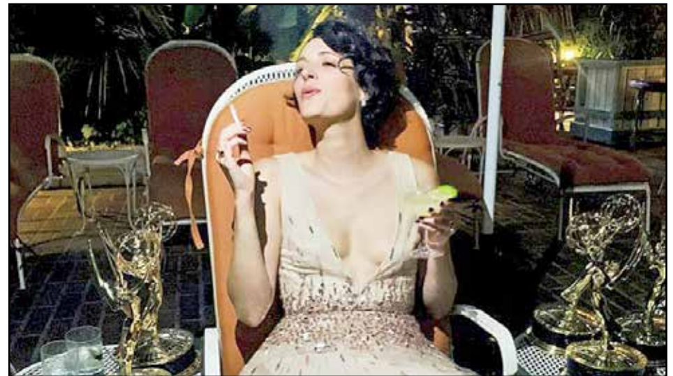
A MAGGIE AND A CIGGIE: Phoebe Waller-Bridge savors the moment

Fleabag upstaged Veep , HBO's other Emmys