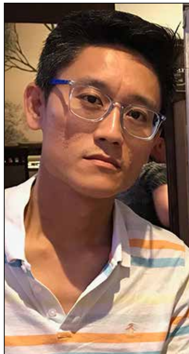
LONDON KIM: the London transplant is a fan of the sashimi at A-Won restaurant in Koreatown (below)