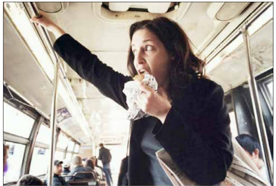
Dame Sally Davies has proposed a ban on eating or drinking on buses and trains

Dame Sally added that the sponsorship decision by English cricket chiefs was "absolutely appalling". She told the BBC's Today programme: "I've suggested that we should look at whether we should say that people can only sponsor if it is their low-calorie healthy foods