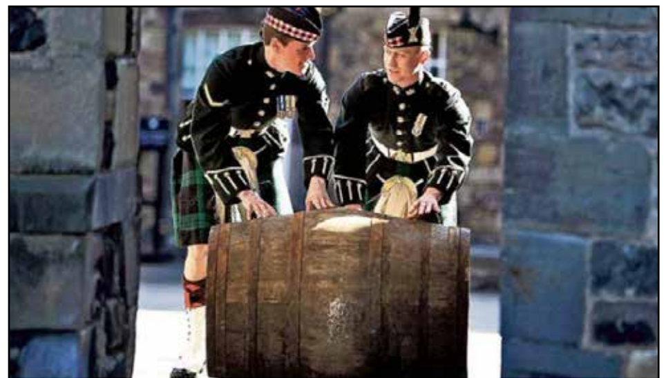
The US is Scotch whiskey's largest market, with annual sales of more than £1bn

David Mundell, the former Scottish secretary, expressed bewilderment at the government's reluctance to do so, adding that it "doesn't