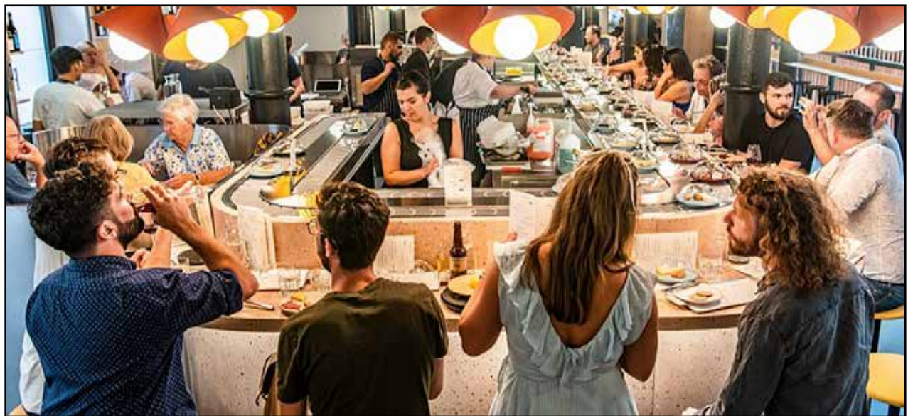
CRACKERS ABOUT CHEESE: the restaurant has proved a smash hit since its opening last month

The restaurant, created by the team at the Cheese Bar, a restaurant in London's Camden Market, also has a specially curated wine list from natural wine retailers Les Caves de Pyrene that diners can pair with their selection of cheeses. The list includes white, red, rosé, orange, and sparkling options as well