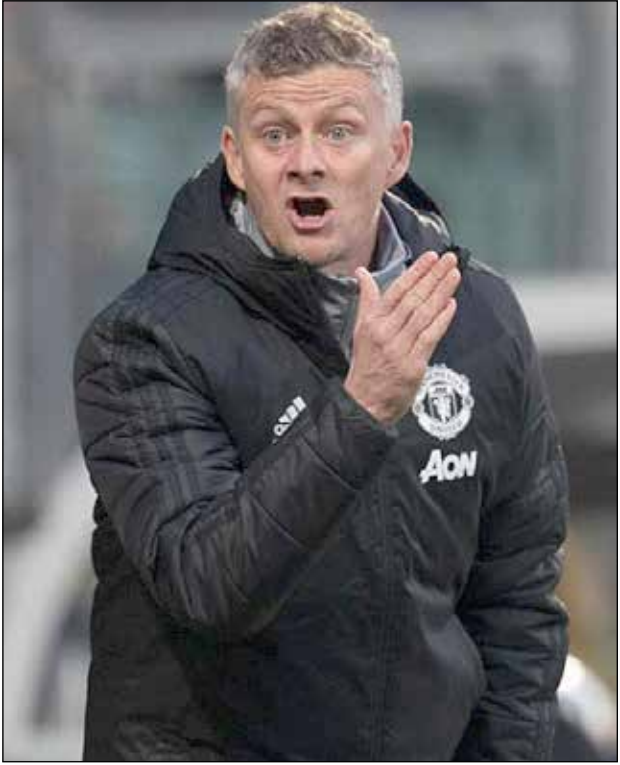
UNDER PRESSURE: Ole Gunnar Solskjaer

Pogba flew out to Dubai during the international break for warm-weather training in a bid to ensure he