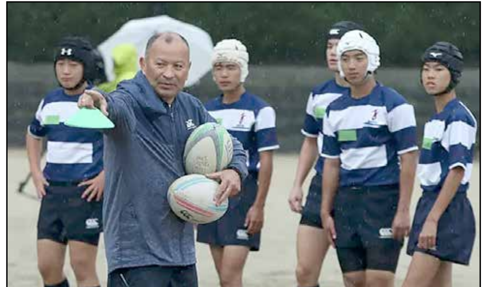
Eddie Jones took his mind off England's quarter final against Australia on Saturday by doing some coaching at a Japanese high school in Beppu.

The two nations have met in six of the eight