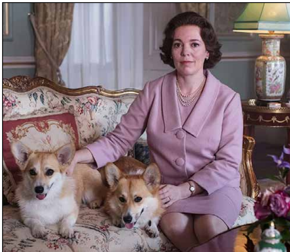
COMING SOON: season three of The Crown debuts on Netflix on November 17