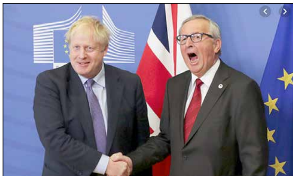
ALL SMILES NOW (sort of): Boris Johnson and Jean-Claude Juncker in Brussels

The party also objects to Northern Ireland potentially being part of a different VAT regime to the rest of the UK and is concerned about the deal violating the Good