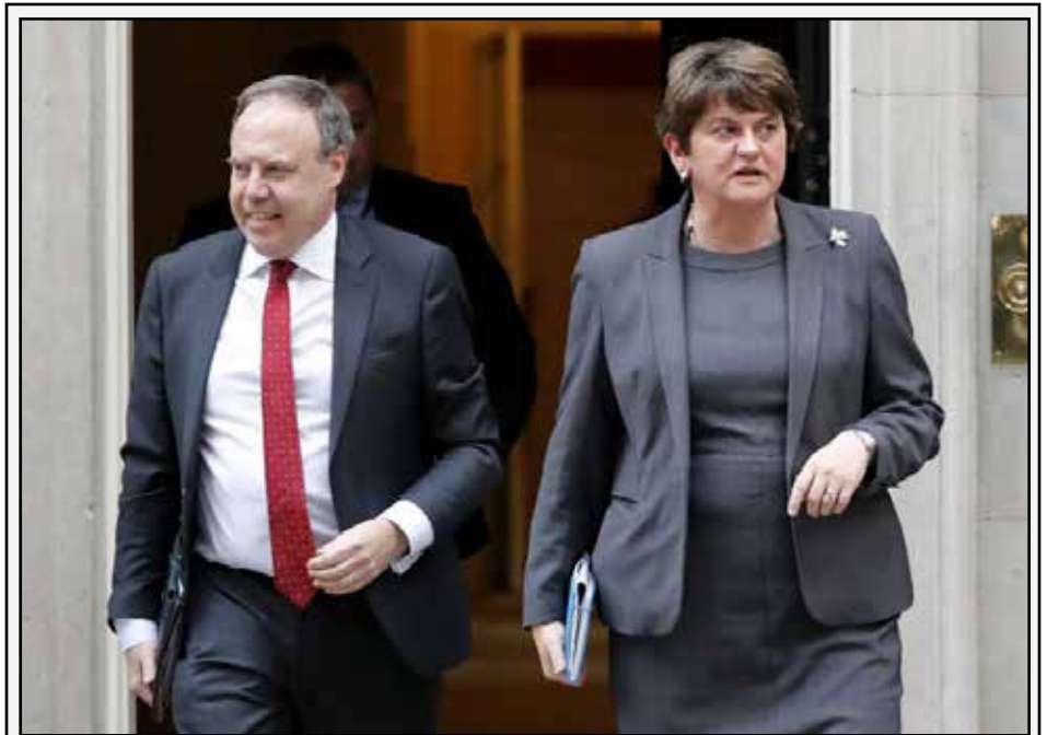
DEAD AGAINST IT: The DUP's Nigel Dodds, pictured with party leader Arlene Foster, accused the prime minister of being "too eager by far to get a deal at any cost".

As the French President Emmanuel Macron said when he arrived at the summit, Boris Johnson assured him he had the votes to get this agreement through the House of Commons. If there's a hiccup then there's always the safety valve of an extension to the Brexit deadline, despite what leaders are currently saying. Unveiling the deal, EU chief negotiator Michel Barnier said: "This text... provides legal certainty and certainty where Brexit creates uncertainty."