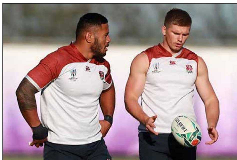
Tuilagi and Farrell will shore up England's defence this weekend