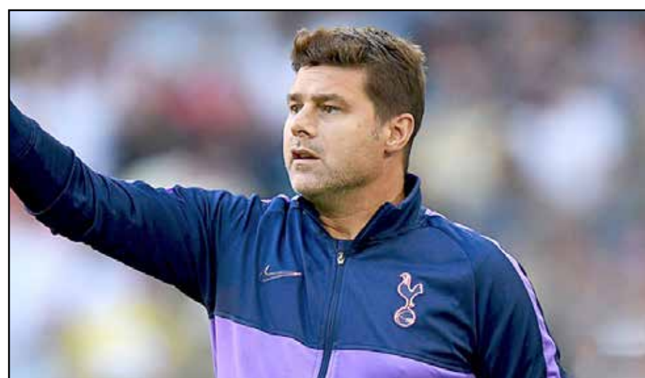
POCHETTINO: "I'm not going to change the way I think or see things."

That poor run of results led to speculation Pochettino could use the