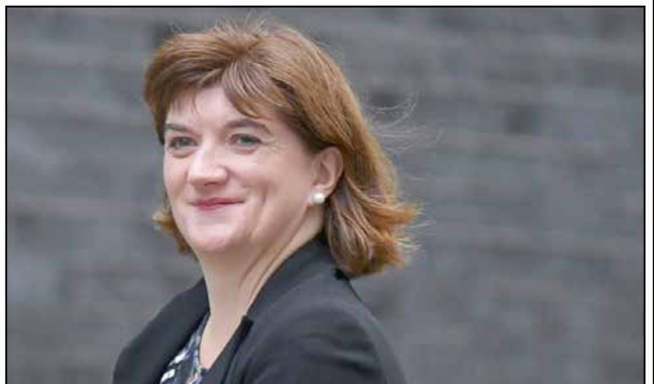
... "the abuse for doing the job of a modern MP can only be justified if, ultimately, Parliament does what it is supposed to do – Nicky Morgan

Earlier, Ms Rudd sparked an extraordinary row with Downing Street after revealing she would quit despite having made peace with Boris Johnson. The former