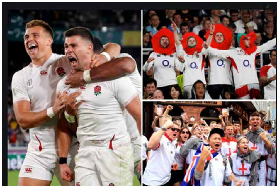
The mood was buoyant as England downed the mighty All Blacks on Saturday

“You can never take anything for granted. You have to go out there