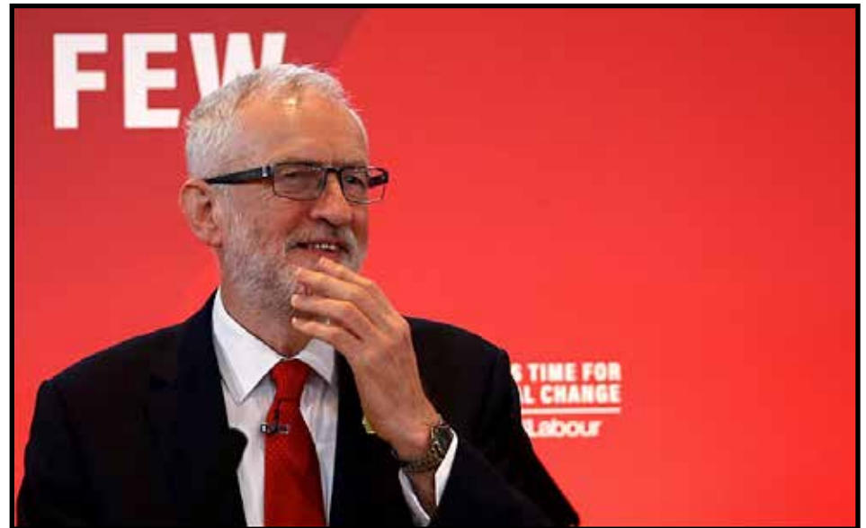
"People aren't fooled so easily. They know the Conservatives are the establishment elite." - Jeremy Corbyn

Mr Johnson promised to "stimulate the wealth-creating sector" if the Conservatives win the election, saying the contest was not about "background" but a "vision for the country".