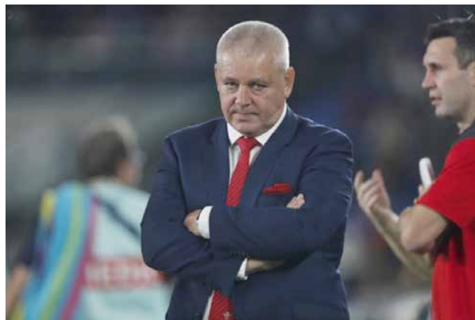
"We can hold our heads up high and leave Japan with a lot of pride," - Warren Gatland

"It's not easy. You're going to be nervous. You're only human. So you try to stick to your process and, luckily, I had a good day leading up to that kick so confidence was pretty high.