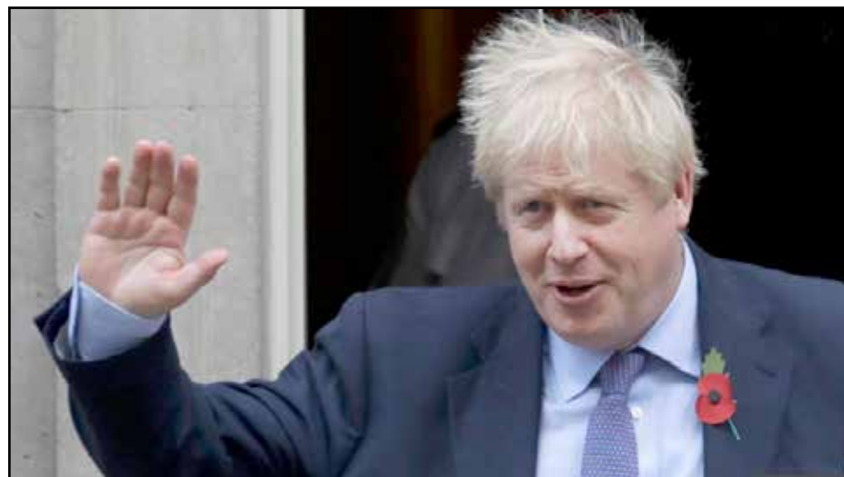
BORIS JOHNSON: "I think it's time for the country to come together, get Brexit done and go forward."