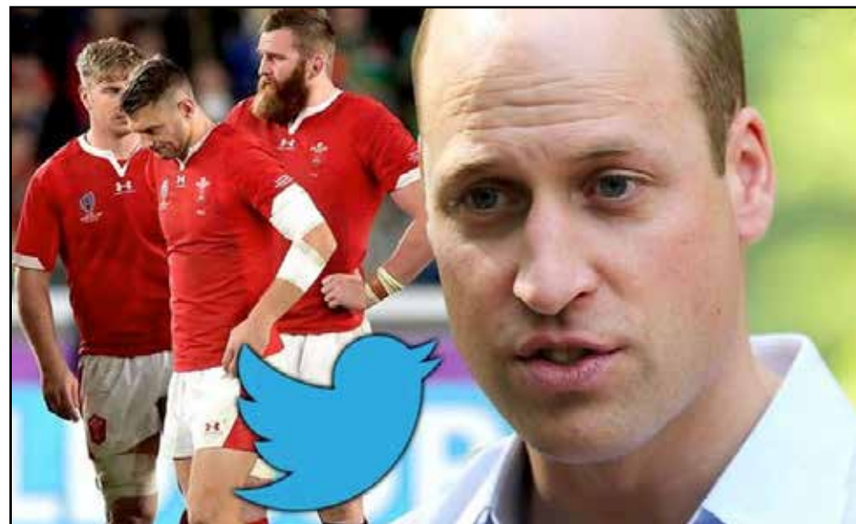
Catching the fever: Prince William (above) tweeted to express his support for Wales after their defeat in Sunday's semi-final and (below) Welsh fans in Yokohama