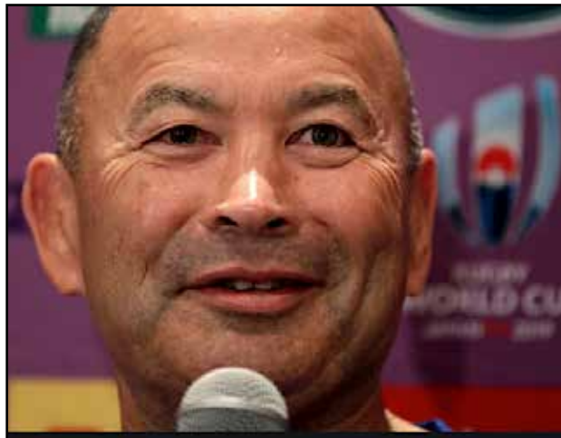
JONES: “We're ready to go. Hang on to your seats”

The form shown by the 10-12 combination of Ford and Farrell and the outstanding displays of Sinckler, Maro Itoje, Tom Curry and Sam Underhill have persuaded Jones - in his 50th game in charge of the side - to stick with the same XV for the first