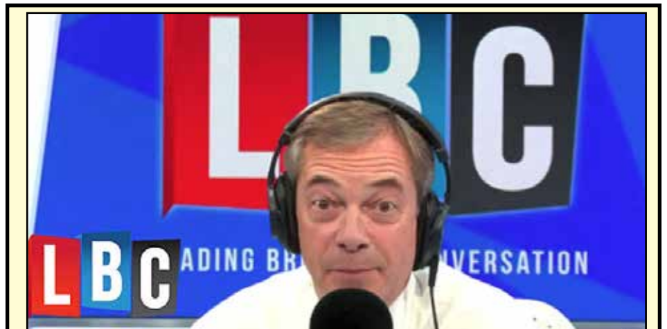
OLD BUDDIES: Trump was speaking on Nigel Farage's LBC show