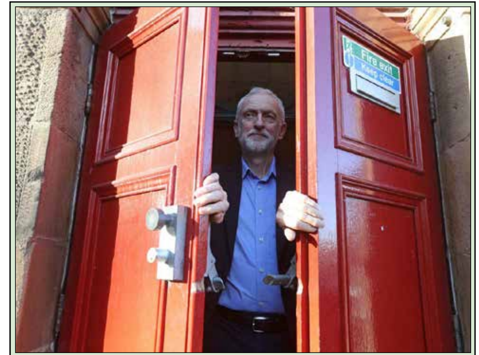
JEREMY CORBYN: opening doors...or shutting out the unwanted?

Lib Dem leader Jo Swinson said: "The Conservative Party are the Brexit Party now."