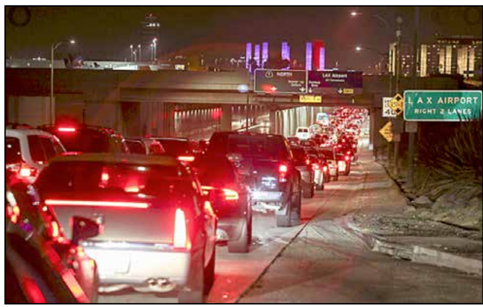
IT'S NOT PRETTY: if you're going to the airport....leave even earlier

When I arrived back I thought it would be much easier to have a friend pick me up curbside (thanks friend) than having to deal with the commotion. He said it took two hours from Sherman Oaks, and the last quarter of a mile it was absolutely chaotic because of the back up of taxis and Ubers. The bottom line: it's still a long wait, but with the added nightmare of gridlock at the airport entrance.