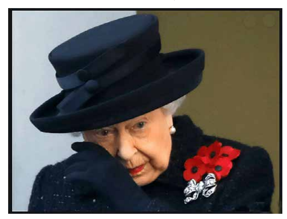
EMOTIONAL : the Queen watched the ceremony from a Foreign Office balcony

"We take allegations of antisemitism extremely seriously, we are taking robust action and we are absolutely committed to rooting it out of our party and wider society."