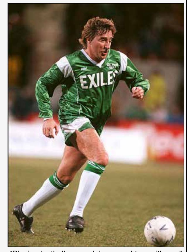
"Playing football so much has caught up with me," said Stewart, who needs a total knee replacement

After the UK, he starts an American tour with Blondie before heading to Australia and New Zealand, and on to South America. He said: "I try to plan all my tours around the school holidays of my