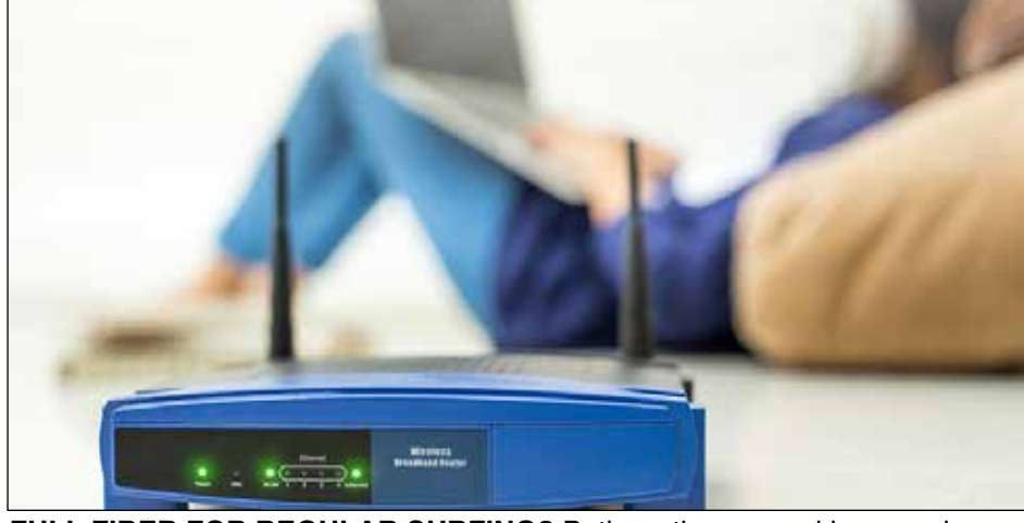
FULL FIBER FOR REGULAR SURFING? Both parties are making promises

Broadband packages in the UK cost households an average of around £30 a month, according to broadband comparison site Cable - which people would no longer have to pay