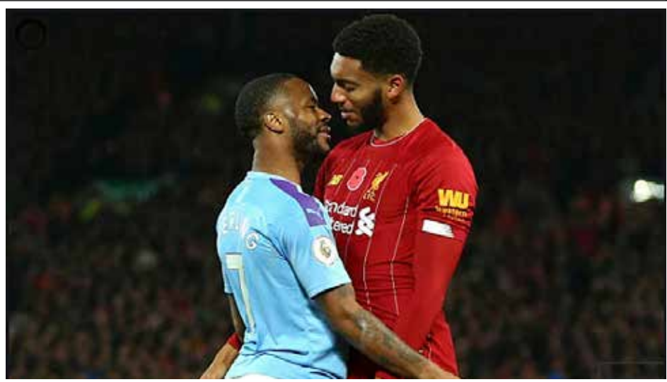
FLASHPOINT: Sterling and Gomez go nose to nose in Sunday's Premiership clash