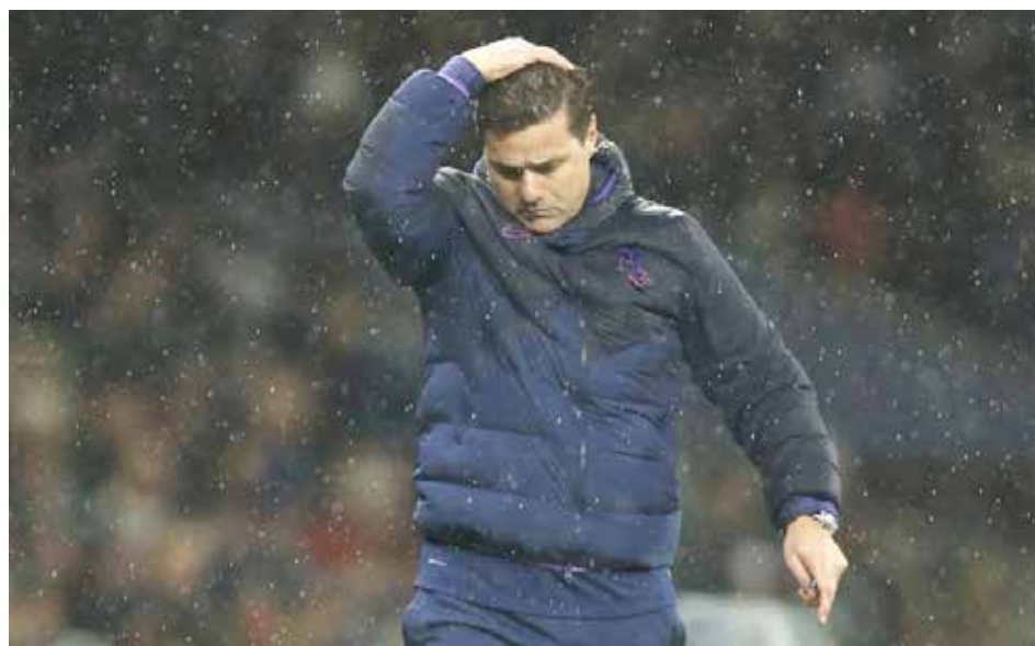
HE'S STILL MAGIC, YOU KNOW: Mauricio Pochettino was fired by the North London club on Tuesday after five and a half years in charge