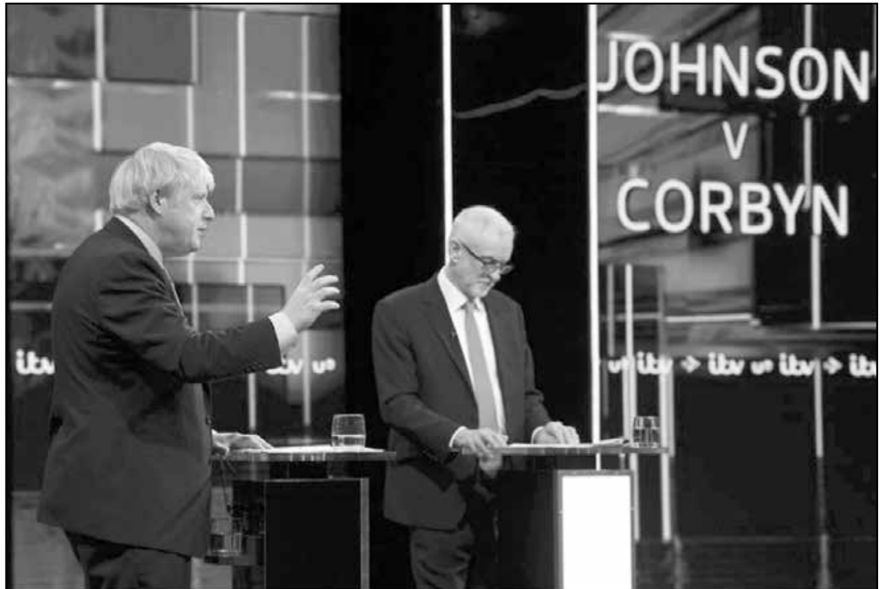
A COUPLE OF DUDS? Both Mr. Johnson and Mr Corbyn were booed during the ITV debate this week

Mr Johnson was repeatedly reprimanded by the host, Julie Etchingham, for overrunning his allotted time as he drove home his claim that he could "get Brexit done" while Mr Corbyn's policy of a renegotiated EU deal and referendum offered only more delay.