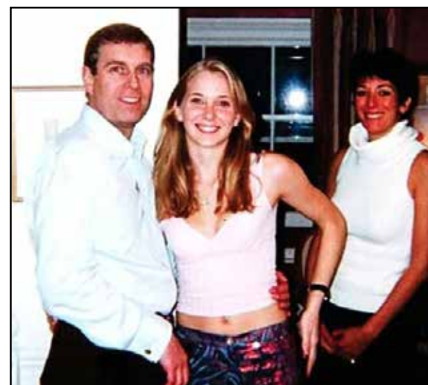
INCRIMINATING? The Prince with Virginia Roberts in London in 2001

In his BBC interview cont. on page 5, col. 1