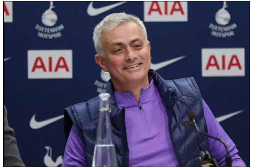
STILL SPECIAL? "I'm not going to make the same mistakes," Mourinho said. "I'm going to make new mistakes. I'm going to be stronger."

"From an emotional point of view I'm relaxed, motivated and ready and I think the players felt that these two days. I'm ready and I'm here to support them. In life you go through periods like this, where it's not about myself, it's about my