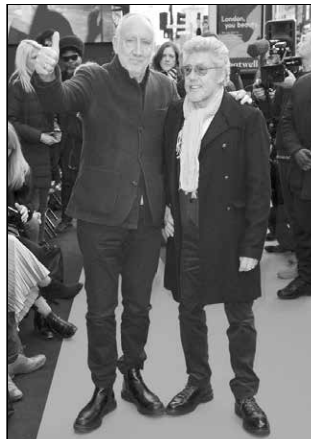
ROCK OF AGES: Townshend and Daltrey at the Music Walk of Fame in Camden this week

THE Who became the first act to be immortalised on the Music Walk of Fame on Tuesday. Frontman Roger Daltrey and guitarist Pete Townshend unveiled the founding stone in Camden, north London.