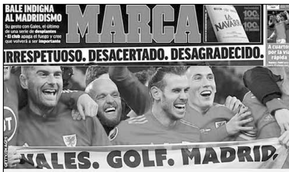
A LITTLE EXTRA? Spanish media reacted angrily to the banner displayed by Gareth Bale as Wales celebrated reaching Euro 2020

Their opponents in the play offs - Bulgaria, Hungary,