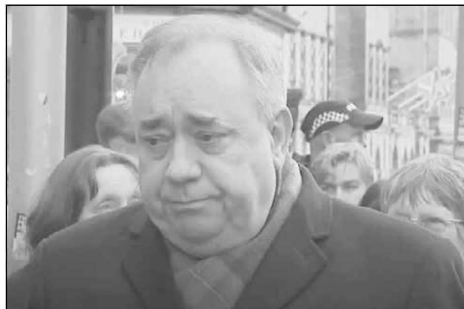
"I AM INNOCENT." The former First Minister denies all the charges against him

• Sexually assaulted the same woman in December 2010 or December 2011 in the Ego nightclub in Edinburgh by touching her arms and hips with his hands