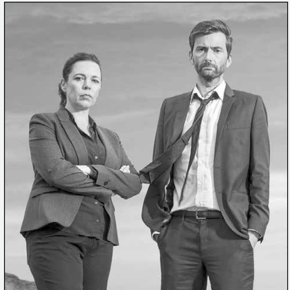
GREAT BRITS: Olivia Colman and David Tennant starred together in Broadchurch

Rounding off the top 10 are Sir Derek Jacobi, Dame Judi Dench, James Nesbitt, Steve Coogan and Sean Bean. Bean – who famously lost his head in HBO hit Game Of Thrones – was the actor most