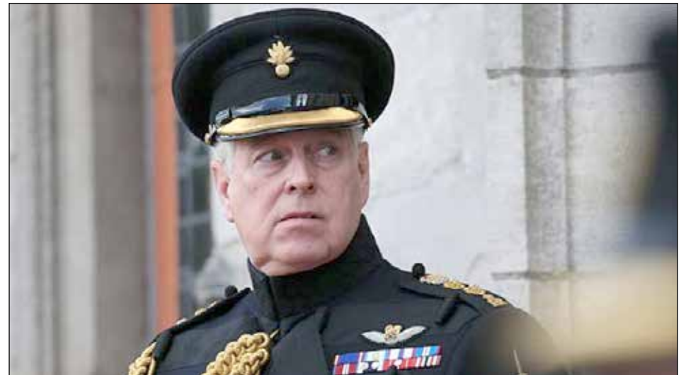
The Duke of York has consistently denied having sex with Virginia Giuffre