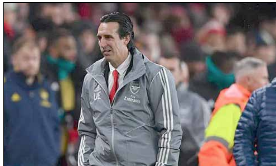
OH, EMERY, YOU ARE AWFUL: the Spaniard presided over Arsenal's worst run without a win in 27 years

The club also brought in midfielder Dani Ceballos on loan from Real Madrid. They started this season with back-to-back victories against