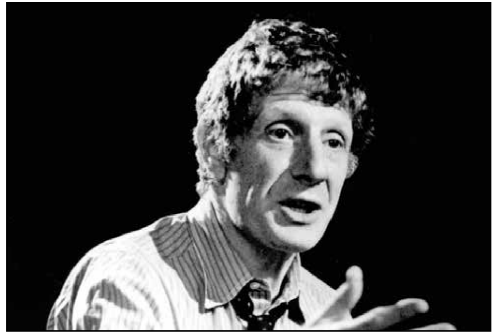
Jonathan Miller: "a creative genius whose imagination knew no bounds... he brought arts and culture to millions on the BBC"

"His intolerance of inauthenticity and laziness on stage was matched by the urgency and rigour of his search