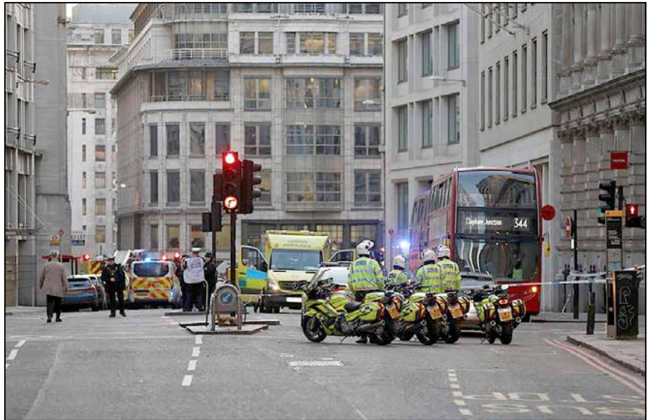
Police and emergency services block an approach road to London Bridge after Friday's incident

cordons will remain in place and extra police patrols will be held across the capital.