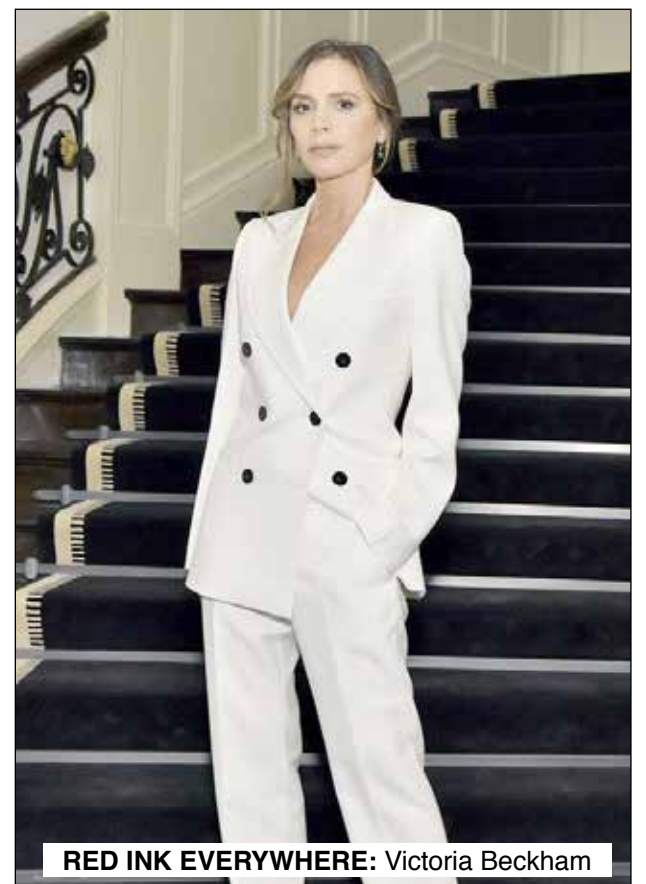
RED INK EVERYWHERE: Victoria Beckham

digital channels and refining its product to more closely reflect Victoria Beckham's aesthetics and values." It also said that the company had £30million in new investment which had gone into the appointment of a "world class leadership team". The report said the investment was targeted at digital marketing and other strategies to allow greater distribution. It said the strategy was paying off and sales were increasing in 2019 in "certain segments" as well as there being a reduction in losses.