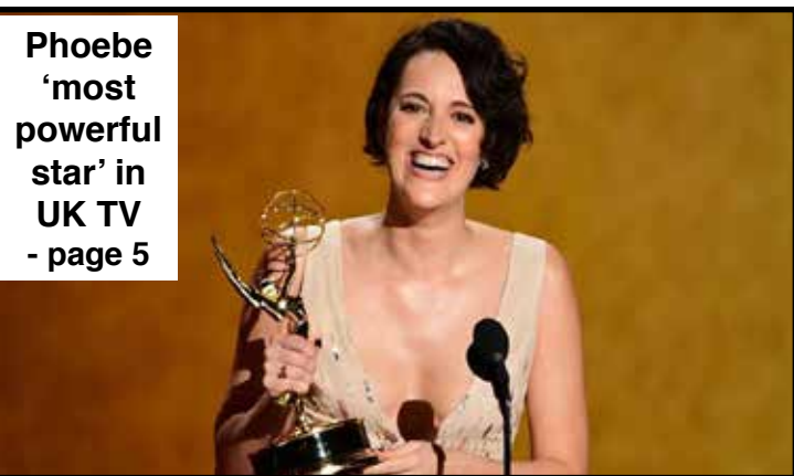
Phoebe 'most powerful star' in UK TV - page 5

California's British Accent™ - Since 1984