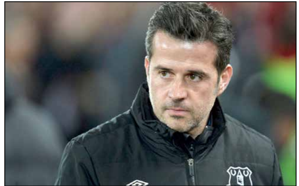
SILVA: Everton have won just four Premier League games this term under his guidance

They are a point adrift of safety ahead of Chelsea's visit to Merseyside and will follow that game up with top-flight fixtures