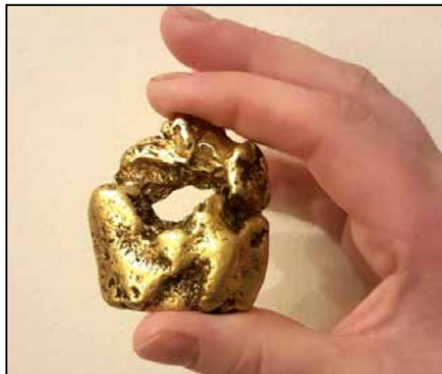
The Reunion Nugget could fetch £80,000 on the open market, once its provenance is confirmed

"One mineralogist thought it looked like an entry and exit hole that could've been made