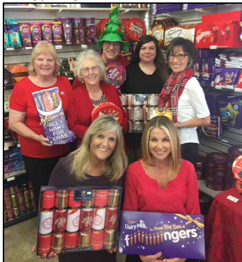
"All of us at The British Connection would like to thank all of our customers for their continued support. Merry Christmas and a Happy New Year"

I released my debut album and first two music videos at the end of 2019, and will be releasing more throughout 2020. For more information and links to everything, head to: diamondshake.com or soundcloud.com/diamond-shake and @instagram @thediamondshake