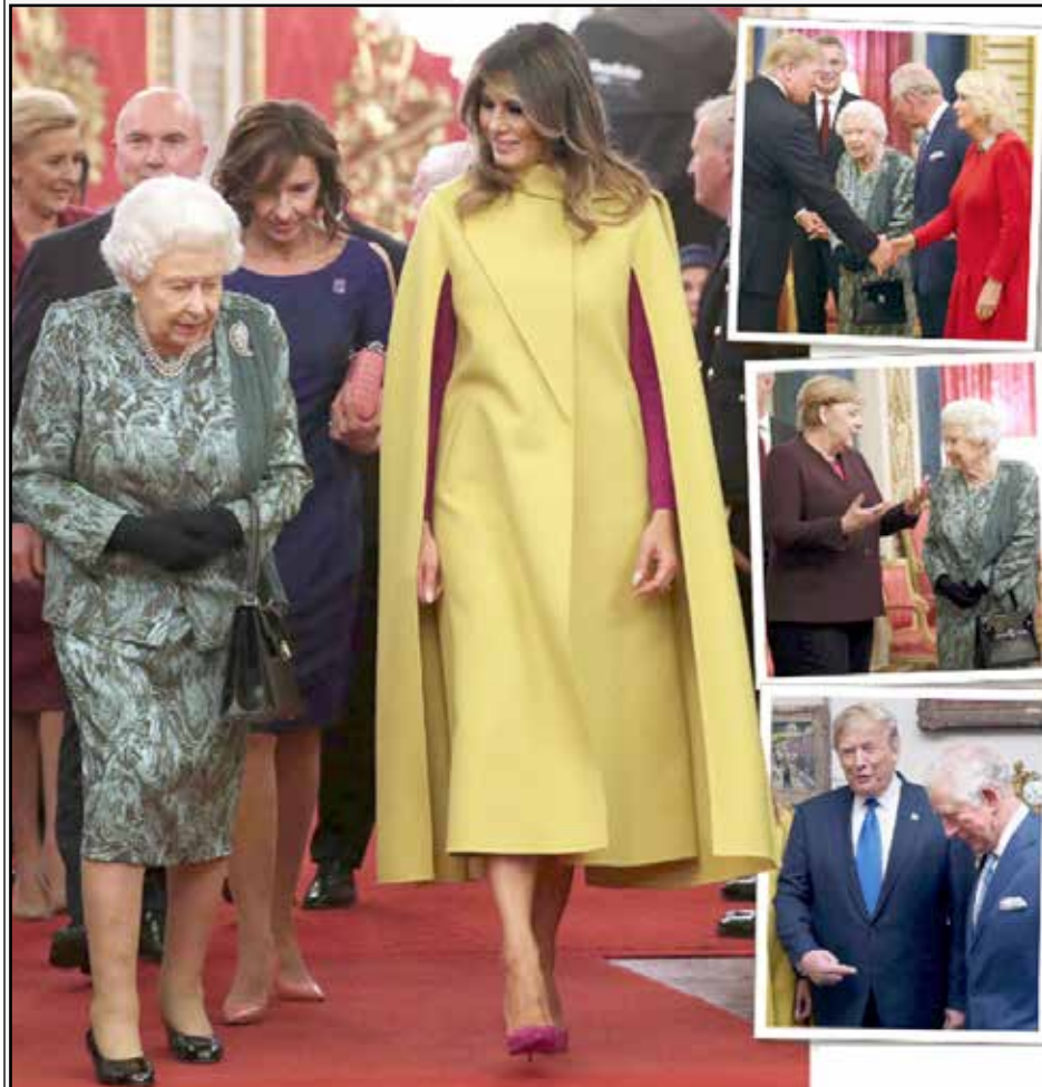
ROYAL RECEPTION: The Queen with First Lady Melania at Buckingham Palace on Tuesday and from top, Camilla meets Mr. Trump, Her Majesty chats to Angela Merkel and Charles with President Trump