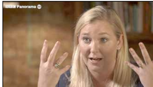
PERSUASIVE? Giuffre appeared on Panorama on Monday