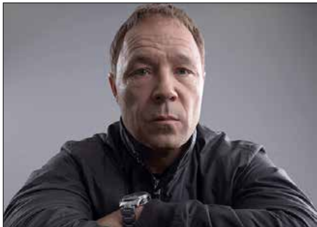
RISING FAST: Stephen Graham starred in the BBC's wildly popular police procedural Line of Duty

Phoebe, 34, shot to fame with her award-winning first series of Fleabag in 2016, followed by hit thriller Killing Eve in 2018. A sell-out theatre show and second outing for Fleabag earlier this year saw Phoebe signed as scriptwriter for the next