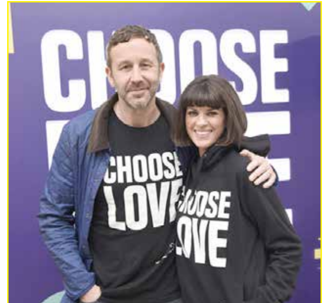
DOING GOOD: Chris O'Dowd and Dawn O'Porter

It is stories like these that make me realize how lucky I am, I might not have lots of money