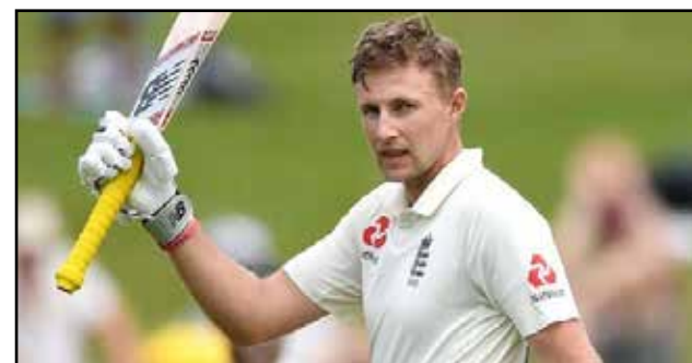
CAPTAIN'S INNINGS: Root scored 226 at the weekend

Root's third double-hundred of his career also took him into the top 10 England Test run-scorers by moving past Wally Hammond's total of 7,249, and none of those has scored more runs at a better average than Root's 7,282 at 48.54. But such is the expectation, fans and