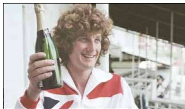
Willis, pictured celebrating another match-winning performance, was Test cricket's second highest wicket taker when he retired