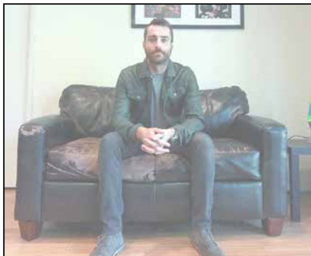
Put everything you have into succeeding, so you can live with failure - Matt Hitchens