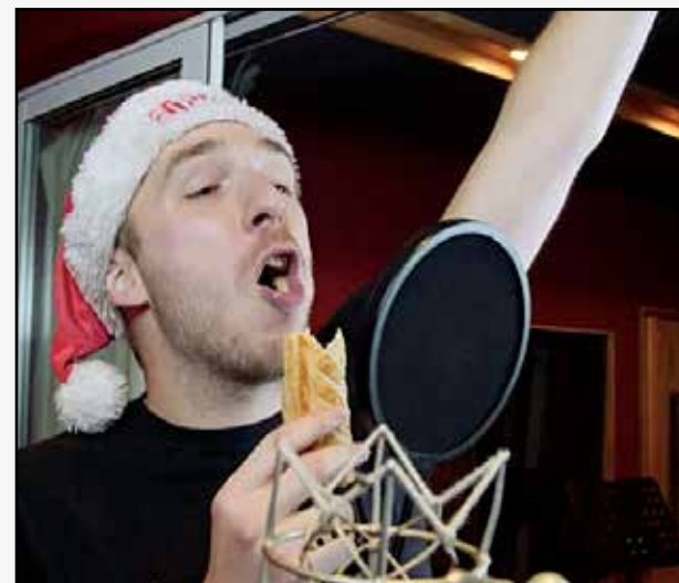
A MATTER OF TASTE: Mark Hoyle - aka Ladbaby - has topped the UK charts again this festive season

The track is a cover of Joan Jett's 1981 hit I love Rock 'n' Roll and the money made is being given to foodbank charity The Trussell