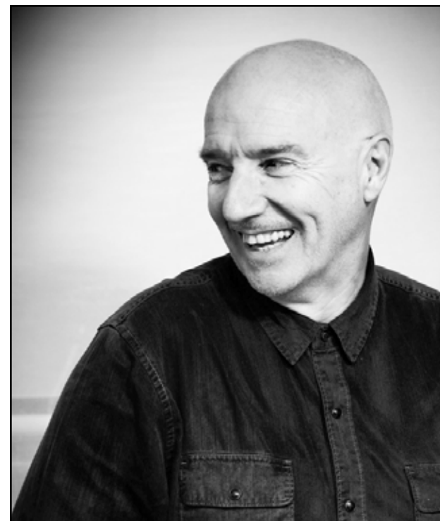
ROCK OF AGES: Midge Ure

I am a strict remainer. I have traveled Europe extensively and see the huge benefits young people will get from doing the same. Problems should be tackled from inside an institution not from isolating from it. I don't feel I have a say in the