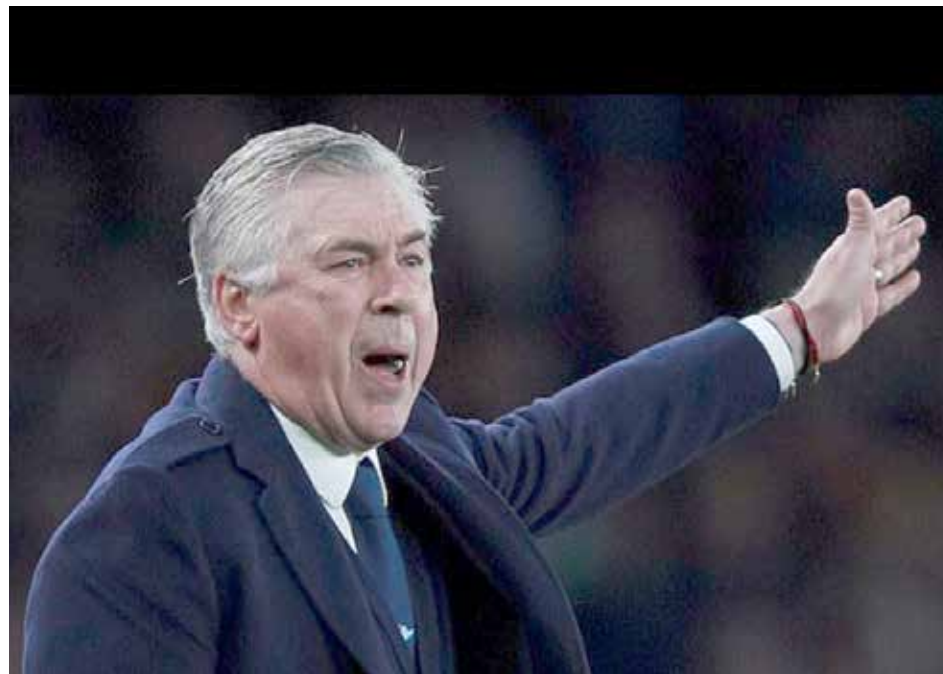
PEDIGREE: Ancelotti has won the Champions League three times

An Everton club statement, which confirmed Ferguson would be in charge