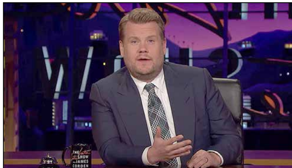
"This is an absolute picnic of an existence and I am painfully aware that this won't always be my life. - James Corden

"We always talked about maybe doing a special for Christmas one year and then we