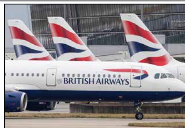
PLANE BA(D): second from bottom in long-haul service

A consistent high scorer in the long-haul category