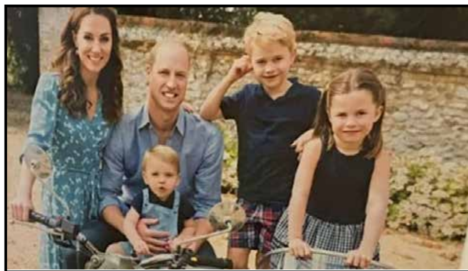
SIMPLY ADORBS: the Duke and Duchess with their three young children

George, Charlotte and Louis will spend Christmas this year in Sandringham with the Queen. For the first time Prince George and Princess Charlotte will also attend the Royal Family Christmas