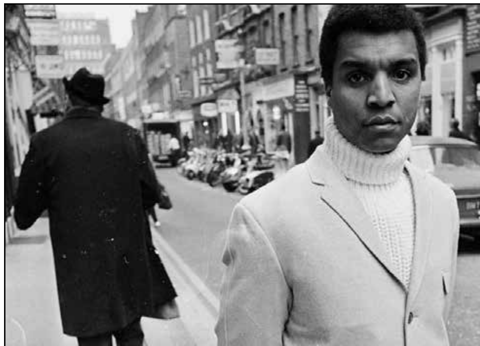
KENNY LYNCH: The London-born star had a string of hits in the 1960s