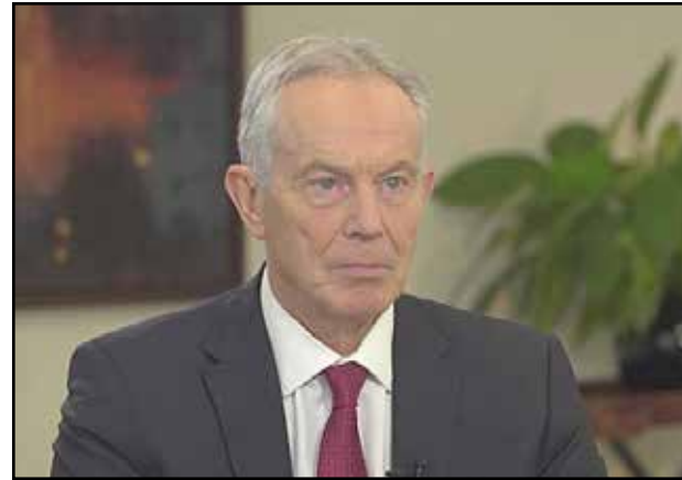
TONY BLAIR: "Labour needs not just a different driver, but a different bus."

Mr Blair claimed the election defeat was the