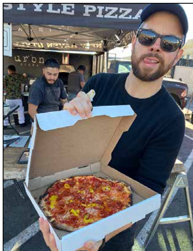
YUM YUM: from pizza to sushi to shrimp: DTLA is a delicious weekend destination

Ye Olde King's Head, 116 Santa Monica Blvd. Santa Monica CA 90401 • Tel: 310 451-1402