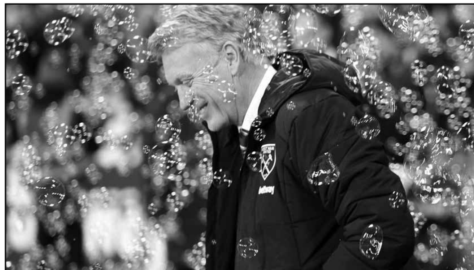
Moyes kept West Ham up after taking charge in November 2017

West Ham's joint owners David Sullivan and David Gold chose instead to appoint Pellegrini, but 19 months