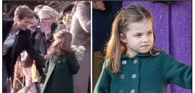
Charlotte's first royal walkabout - page 4

California's British Accent™ - Since 1984