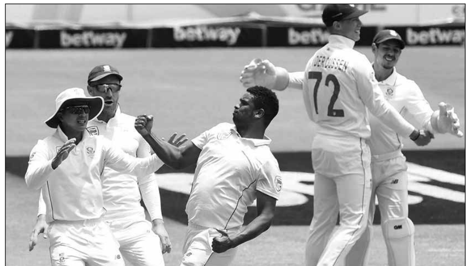
Keshav Maharaj and Vernon Philander of the Proteas celebrate the wicket of Joe Root

Jos Buttler and Sam Curran shepherded England to tea but a cheap ending always felt inevitable. Curran flicked Kagiso Rabada