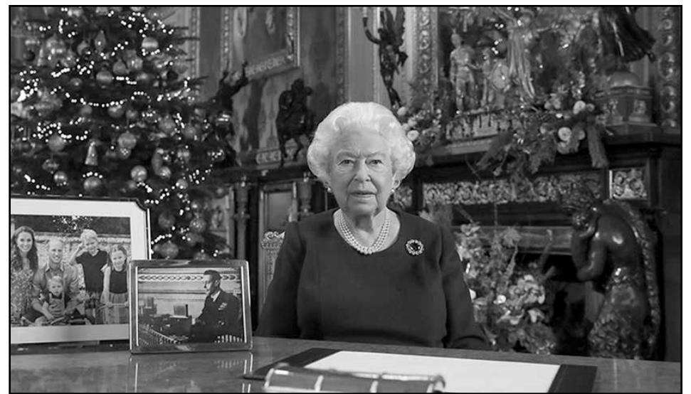
"The path, of course, is not always smooth, and may at times this year have felt quite bumpy..." - The Queen delivered her address from Windsor Castle

The Queen commented: "For the 75th anniversary of that decisive battle, in a true spirit of reconciliation, those who had formerly been sworn enemies came together in friendly commemorations either side of the Channel, putting past differences behind them."