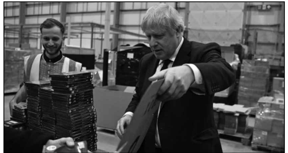
SECURING THE BASE? Boris Johnson at a Yorkshire factory this week