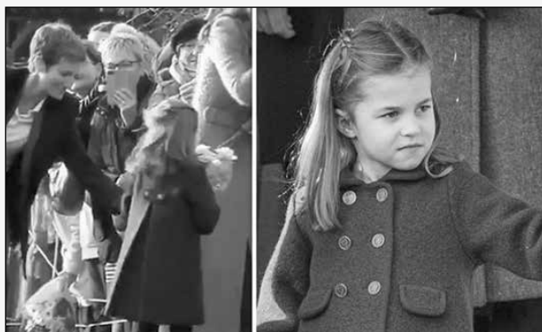
HEARTS AND MINDS: Charlotte at Sandringham

It was a rite of passage for the six year-old future King and his four-year old sister, who walked the few hundred yards from Sandringham House to St Mary Magdalene Church with their parents William and Kate. On the way back from the church service the royal children, who are third and fourth in line to the throne, delighted the 2,000-strong crowd by hugging well-wishers. They also accepted a gift, and chatting to them with their parents. In an outfit colour co-ordinated with her mother's, Charlotte charmed onlookers when she attempted a curtsy for the Queen. Apart from one-year-old Prince Louis, who remained at home with staff, the one notable royal absence was Prince Andrew who stayed away from the 11am service,