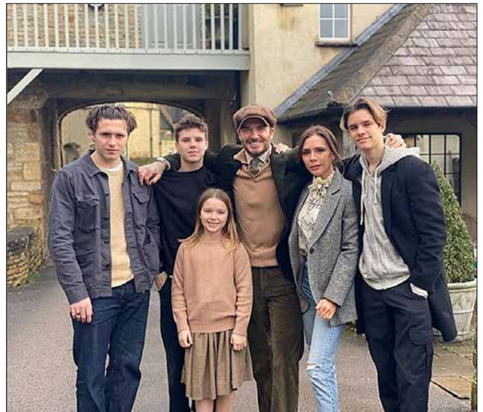
LANDED GENTRY? Romeo, Cruz, Harper, David, Victoria and Romeo Beckham

The night before, the family threw a New Year's bash at their country pile, complete with dinner party, a fireworks display across the lawns and plenty of singing and dancing. David was seen with Harper on his shoulders. They bopped along to Yvonne Elliman's If I Can't Have You , having welcomed in 2020 with Carly Simon's You're So Vain . Brooklyn filmed himself dancing with his girlfriend Nicola Peltz, 24, as he mimed the lyrics of the song.