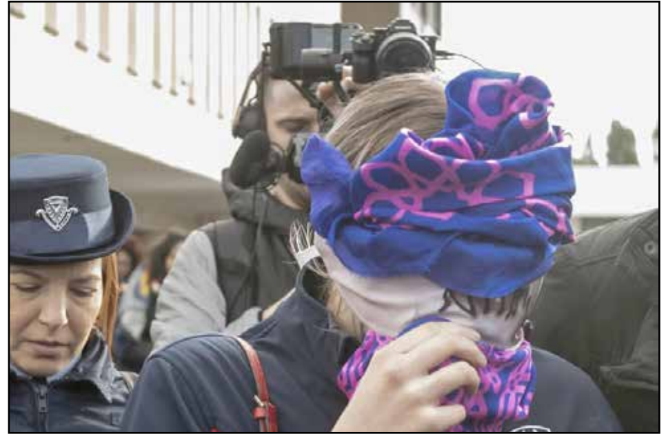
INCOGNITO: the British teen arrives at Famagusta Court on Monday