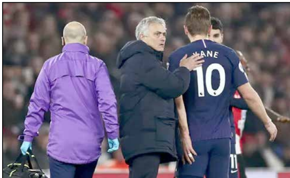
KANE NOT ABLE: the striker limped off as Spurs were beaten 1-0 by Saints

“If you ask me just my feeling – good news or bad news – I am more on bad news than good news, that’s my feeling,” Mourinho said. “What the player felt, Harry Kane leaving a match, the way he did it, he didn’t think twice, it didn’t take him two seconds to realise the severity of the situation. “I’m not great on grades [of hamstringing tears]. I’m great on experience and