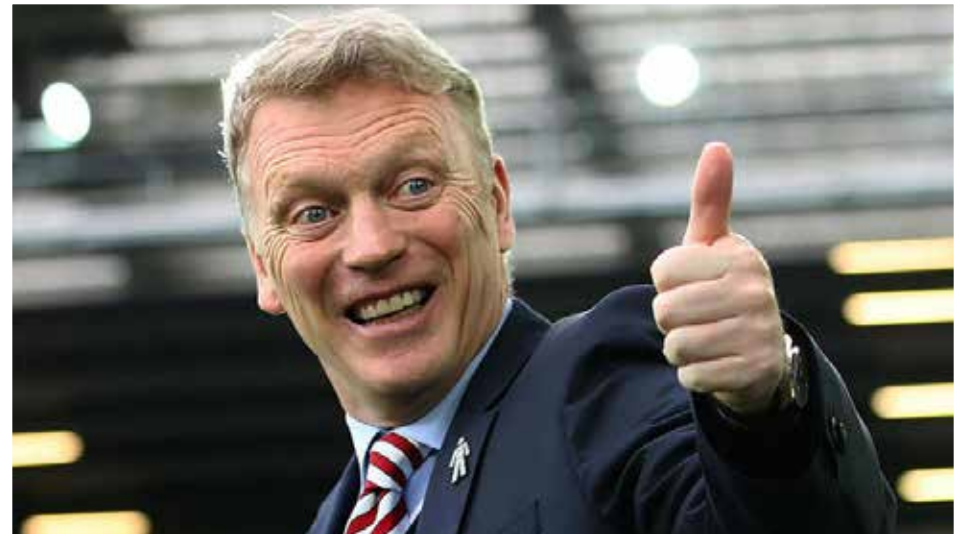
MOYES: "I'm here to get West Ham wins and get them away from the bottom three."

The Scot has signed an 18-month contract at London Stadium but