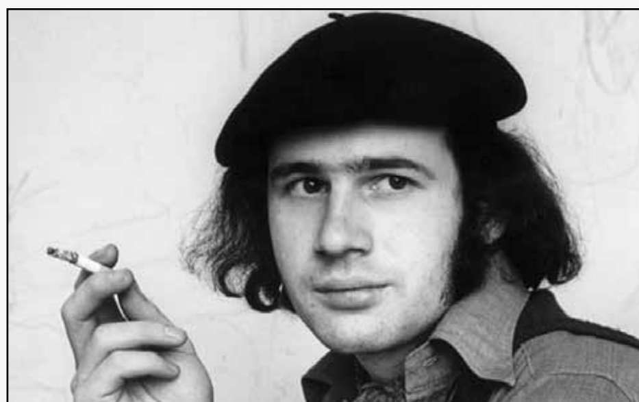
NEIL INNES: he first found fame in the Bonzo Dog Doo Dah band before moving on to compose and perform as part of the Beatles spoof The Rutles

When the Bonzos came to an end, Innes started working with the Monty Python team, writing songs in 1973 for the film Monty Python and the Holy Grail