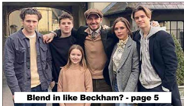
Blend in like Beckham? - page 5

California's British Accent™ - Since 1984