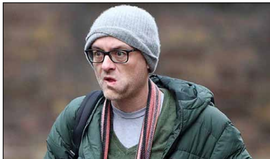
STRANGE TIMES: The Prime Minister's controversial adviser Dominic Cummings announced vacancies at Downing Street through a rambling blog post this week

his personal assistant, to make sacrifices in the weekday date nights, he warns the would-be role. Cummings warned: you will sacrifice many applicant would need "You will not have cont. on page 2, col. 4