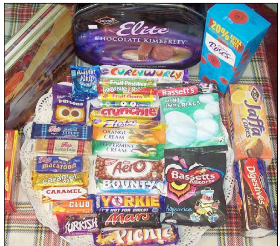
"As a nation, when the going gets tough, we generally reach for the chocolate."

But spending on lager was up because of a move towards more premium, craft brands. A backlash against plastic also hit sales of bottled water. But shoppers have generally benefitted from price wars, with the continued rise of