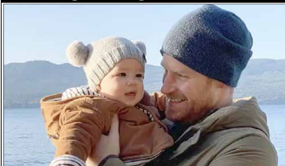
The Duke and Duchess of Sussex welcomed in the New Year in Canada this week, with Prince Harry posting this adorable picture of himself with baby Archie