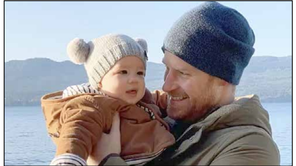
WARM HEARTS, COLD CLIMATE: the Sussexes spent the New Year in Canada

Taken in front of a lake, the snap, shared on the couple's Instagram, appears at the end of a short video recapping their year. A message said: "Wishing you all