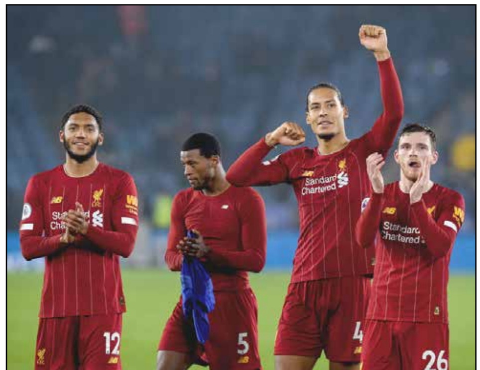
CAN ANYONE STOP THEM? Liverpool's remarkable run of form this year has left them looking almost certain to end their long top flight title drought

However, it would now take an implosion of unprecedented proportions to deny the Reds a first top-flight title in 30 years.