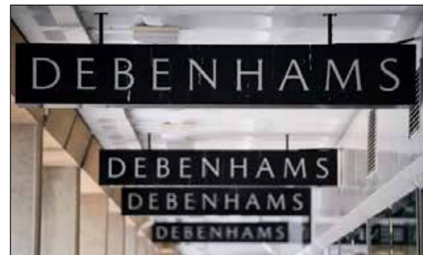
ENDGAME? Debenhams is struggling to survive

The struggling department store chain will close the sites in the space of a fortnight as it presses ahead with a rescue plan announced last year. The closures starting on 11 January are spread across the country, from Kirkcaldy in Scotland to Eastbourne on the south coast. This is just the first wave of shutdowns, as the retailer intends to pull down the shutters on a total of 50 of its worst-performing