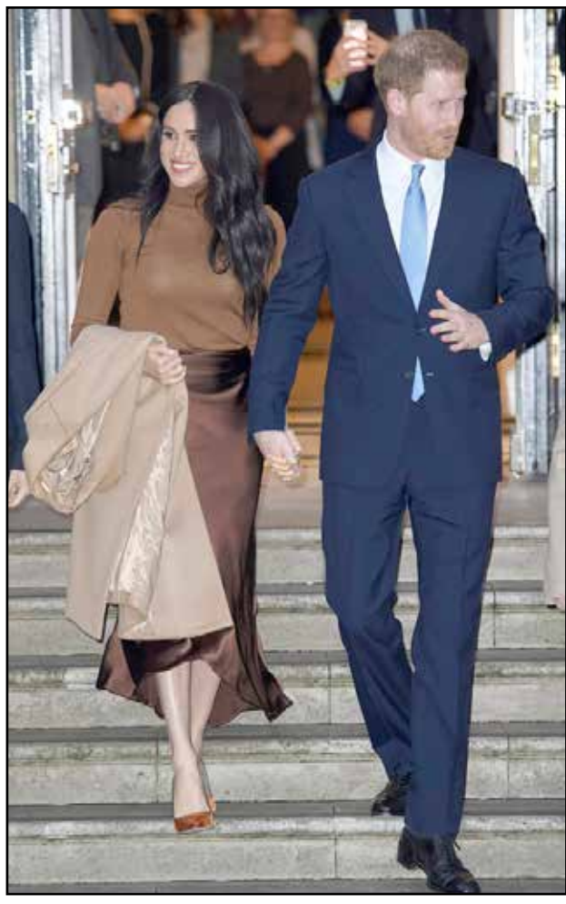
STEPPING DOWN: but he couple are expected to continue their charitable work

Their decision to split their time between Britain and the US is an unprecedented move by members of the royal