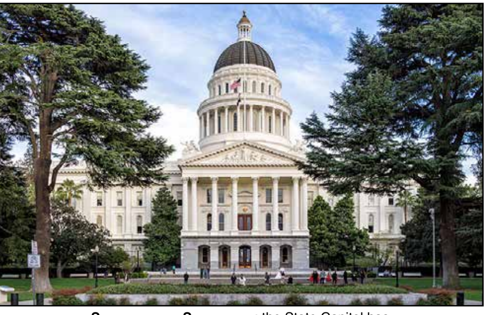
STRAIGHT OUTTA SACRAMENTO: the State Capitol has prepared a raft of new legislation for 2020

SB 222: Housing discrimination. This law expands existing law to protect veterans and military personnel against housing discrimination.