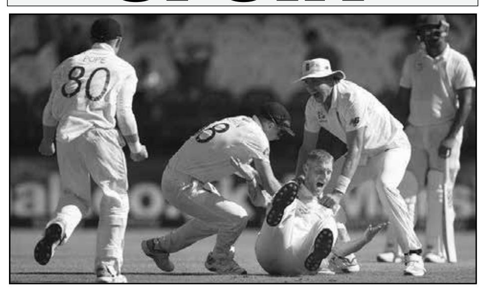
STOKES DOES IT AGAIN: England all-rounder Ben Stokes hammered 72 and took 3-35 as Joe Root's team pulled off a dramatic win in the Second Test at Cape Town