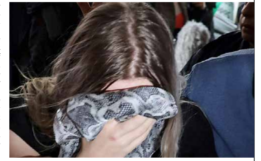
We're glad she's going home, said the girl's lawyer

"I have absolutely no doubt whatsoever about my daughter's