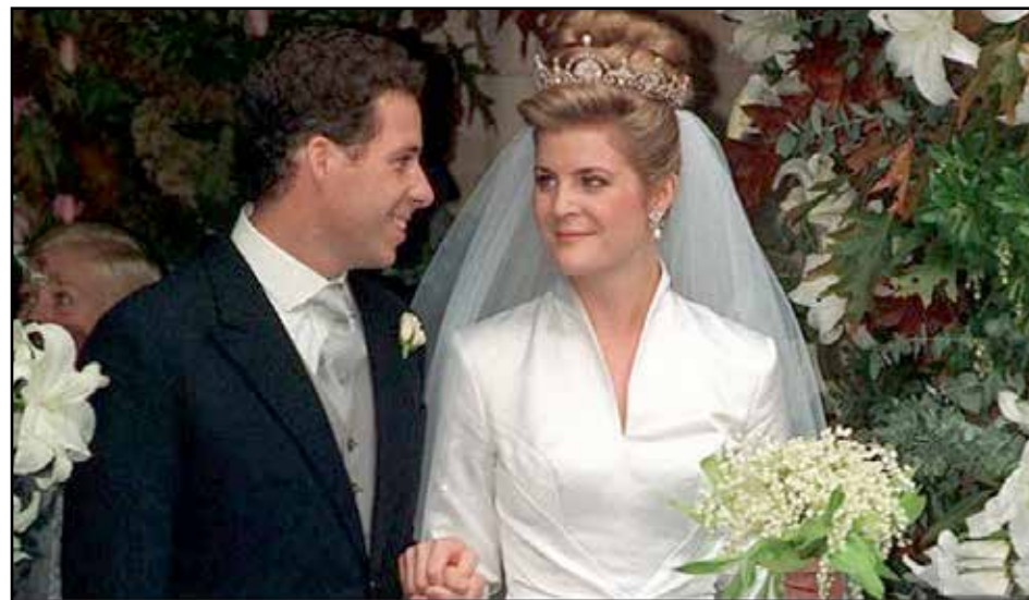
The Earl and Countess were married in Westminster in October 1993

aunt to visiting heads of state. Two months ago he was seen cycling to the palace in a hi-vis jacket. A few days later he and Serena, 49 – who have two children, Charles,