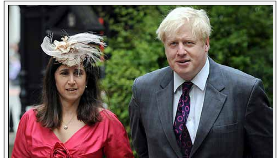
Johnson and Wheeler married in 1993 and split in 2018

Michel Barnier, the EU's chief negotiator, has warned the government that concessions of fishing are a condition of a trade deal and continued access to European markets for the City of London.