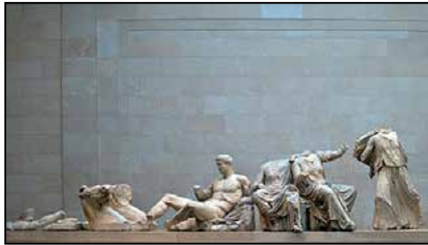
BONE OF CONTENTION: Athens has always insisted Lord Elgin stole the famous statues

One EU ambassador involved in talks on the draft said: "It is a measure of how Brexit has