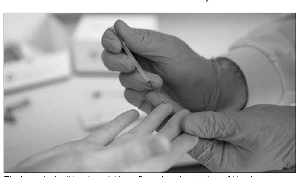
The home test will involve pricking a finger to extract a drop of blood

The test looks for key markers of the immune response that the body mounts to fight off the virus. The kits can detect them in a droplet drawn the fingertip. "Several million tests have been purchased for use. We need to evaluate them in the laboratory, because these are brand new products, to be clear that they work as they are claimed to," Professor Peacock told the science and technology select committee.