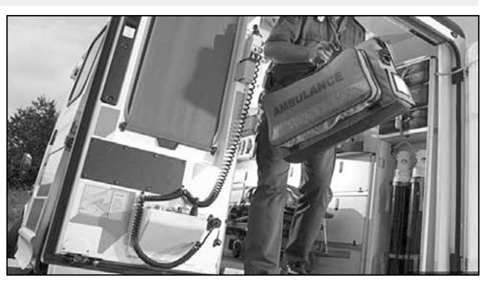
UNDER THREAT: attacks against emergency workers going about their duties carry a maximum sentence of two years

"I wanted emergency legislation brought in to offer increased protection for all 999 workers who are being attacked in this way. There are offences already available but they are generally minor and do not attract the