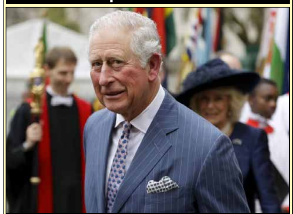
Prince Charles has tested positive for the Coronavirus. The heir to the British throne is now self-isolating at Balmoral (story: page 3)