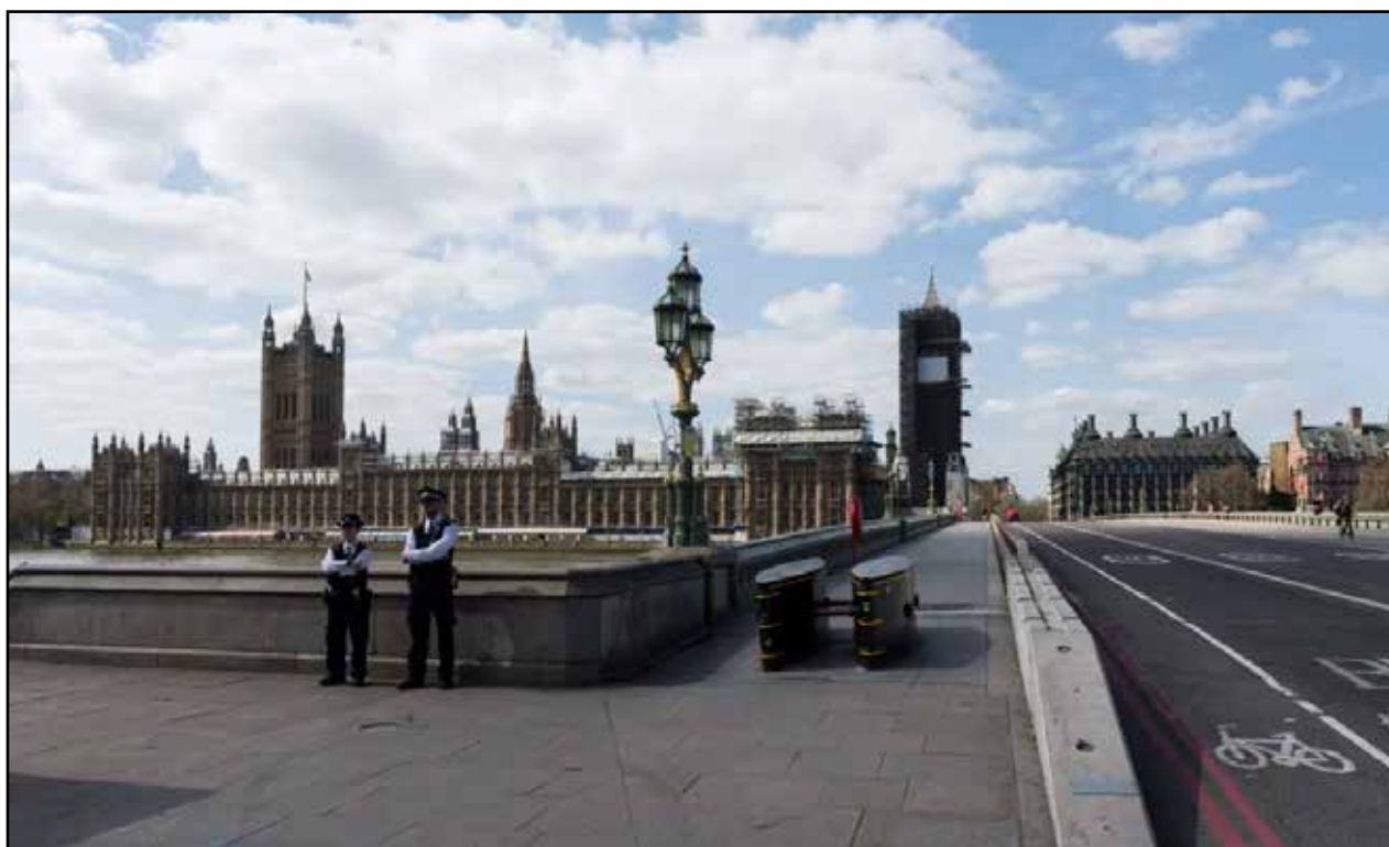
SILENT SPRING: The UK has been on lockdown since March 23rd

consistent" fall in the daily death rate