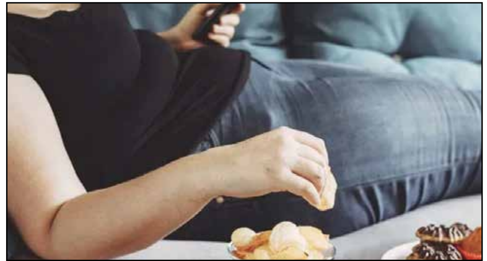
IT DOESN'T HAVE TO BE LIKE THIS: We can control our days, our minds AND what we put in our bodies.

Stay present. Create a list of things you want to accomplish and cross it off as it gets done. Be proud of what you did not