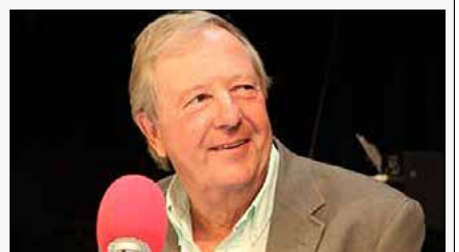
TIM BROOKE-TAYLOR: 'great performer and companion'

The surviving members of The Goodies mourned their co-star. Bill Oddie remembered him as "a true visual