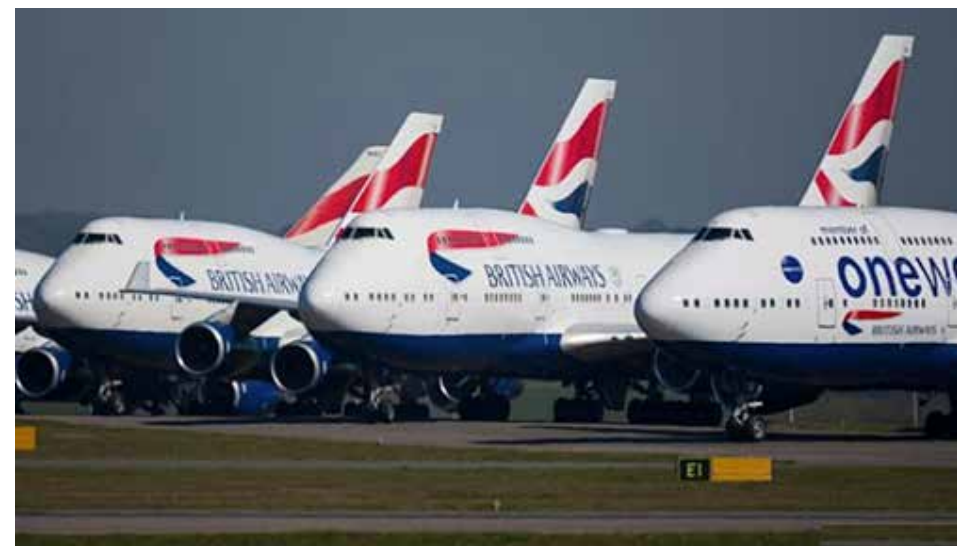
Airlines across the world have grounded aircraft as passenger numbers collapse

BA has been flying from Gatwick for decades. Before its merger with BOAC in 1974 to form BA,