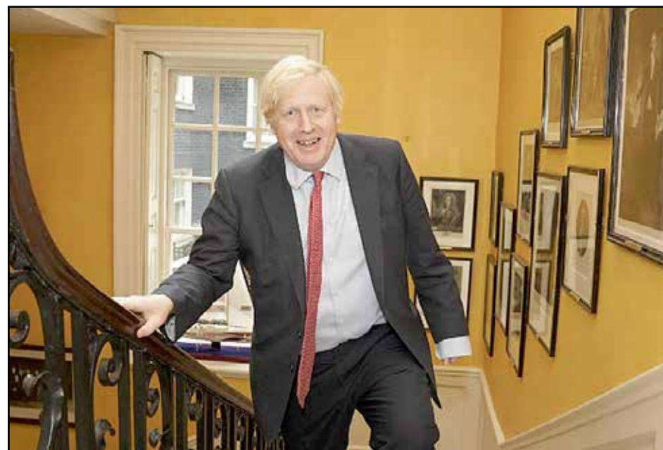
UPHILL STRUGGLE? Boris Johnson pictured at No. 10 on Thursday

"What I think Sage [the scientific advisory group] is saying, and what I certainly agree with, is that as part of coming out of the lockdown, I do think that face coverings will be useful both for epidemiological reasons but also for giving people confidence they can go back to work," he said.