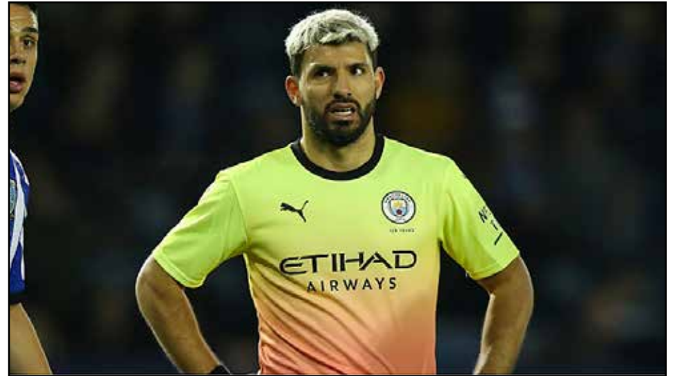
In an interview Agüero said he was scared of unwittingly contracting the virus

"It's not an easy game, it's Real Madrid we are playing against and we know that the tie is not over. We got a good result in the first leg but anything can happen.