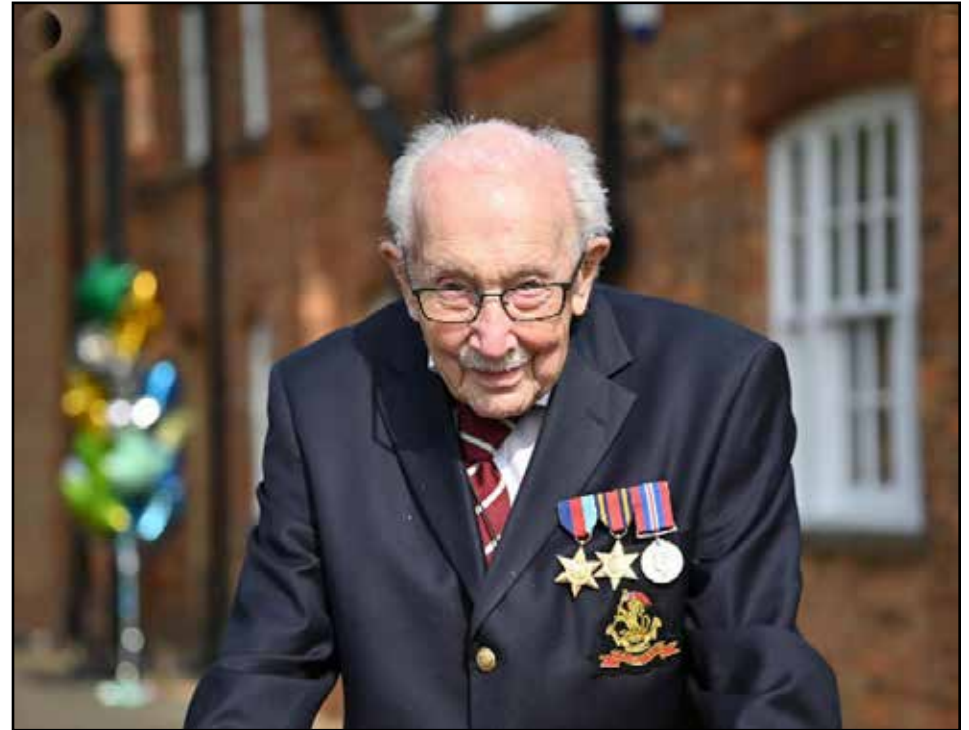
"Please always remember, tomorrow will be a good day." - Captain Tom Moore

"We cannot thank him enough for all that he's achieved and we wish him a very happy birthday, and look forward to continuing to ensure that what he's done is used to improve the lives of the NHS