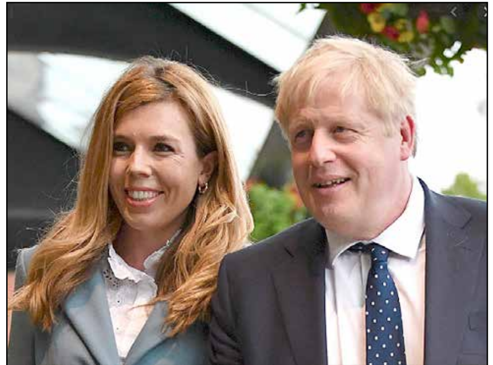
No 7 at No 10: Carrie Symonds and Boris Johnson

Ms Symonds announced her pregnancy in an Instagram post in February and said that the baby was due in the "early summer", which suggests that his arrival may have been earlier than expected. Downing Street refused to say