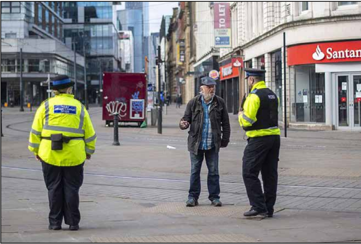
NO QUICK END IN SIGHT: the government confirmed the main lockdown restrictions will remain in place