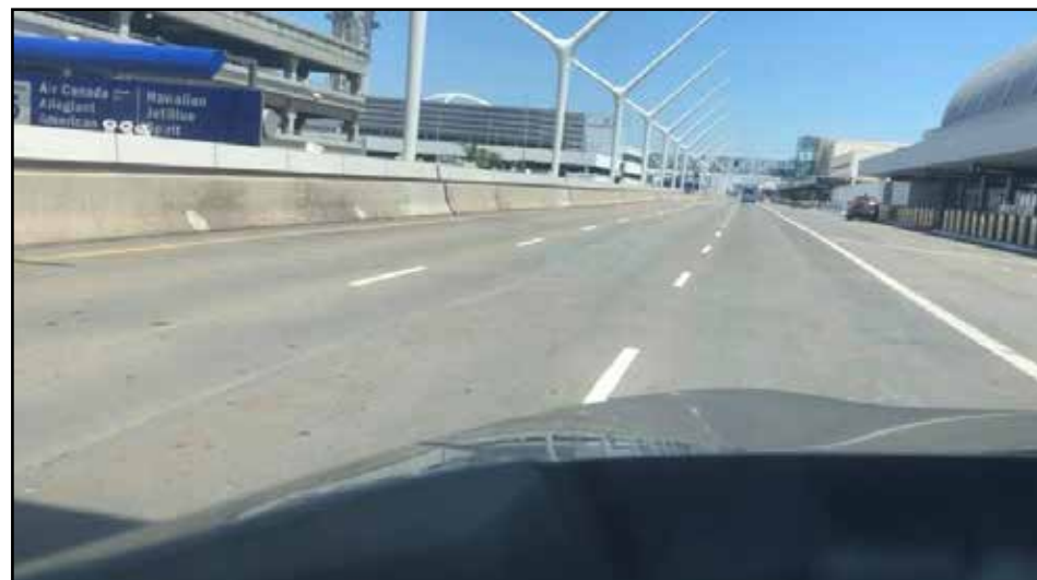
ONCE IN A LIFETIME: the scene at LAX (above) and Heathrow (below)

Once my mum landed at Heathrow, she said everyone was, typically, pushing each other and standing within centimetres of each other