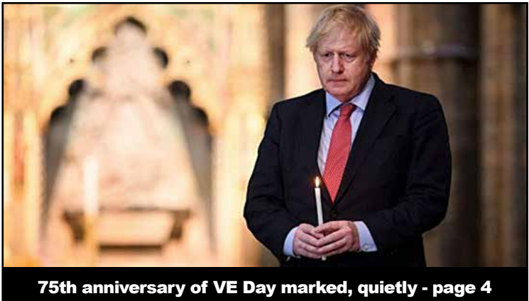
75th anniversary of VE Day marked, quietly - page 4