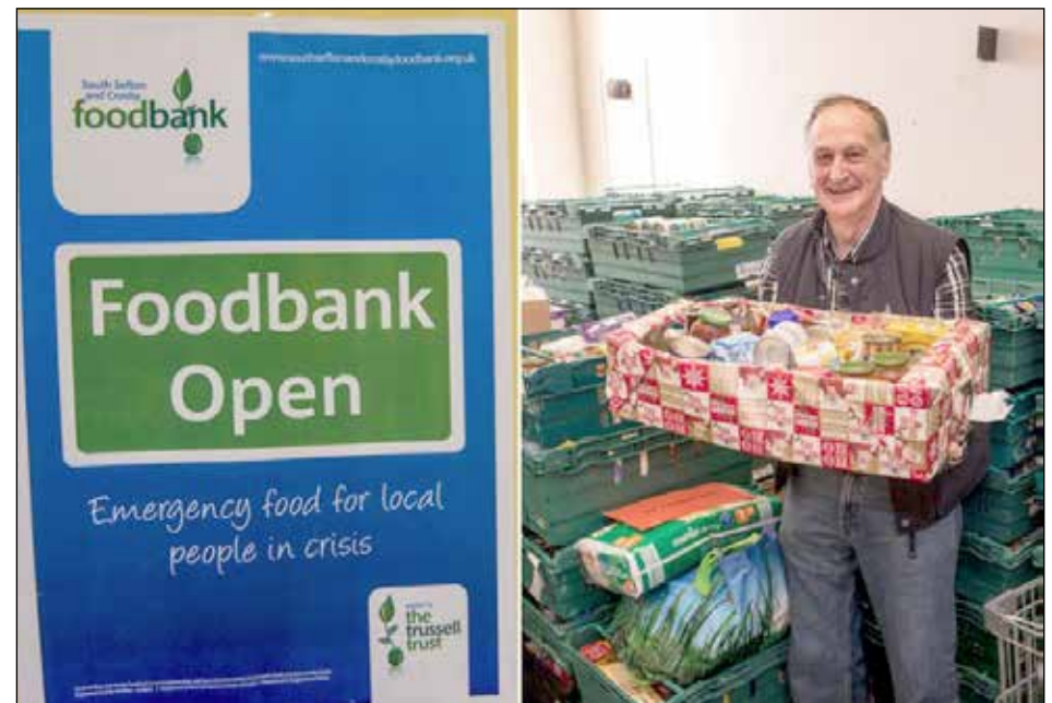
The Trussell Trust is the UK's biggest food bank network

The Trussell Trust said overall food levels have stabilised, after help from major supermarkets. Stocks remain depleted, however, and there is concern that some