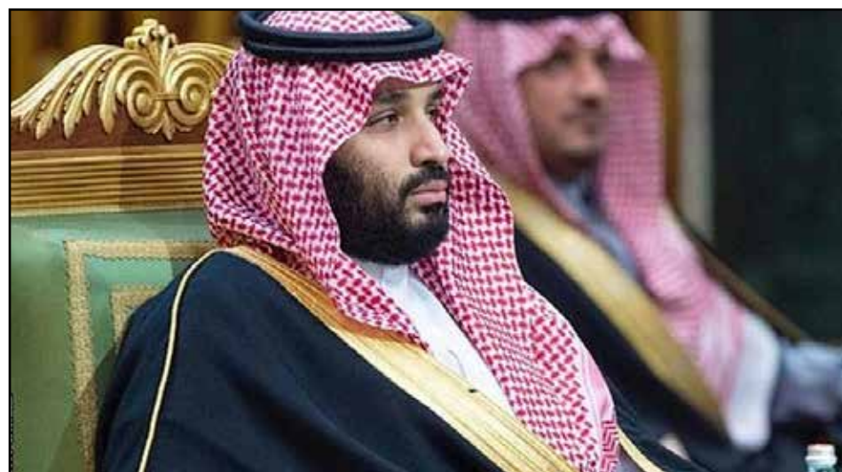
Prince Mohammed bin Salman heads Saudi Arabia's Public Investment Fund

Bin Salman has denied ordering the killing of Khashoggi, with Saudi authorities blaming a "rogue operation".