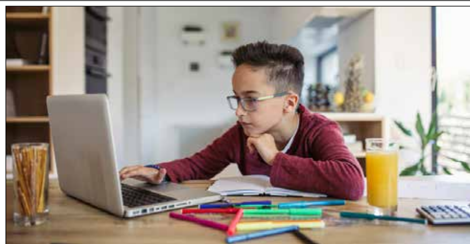
HAVES AND HAVE NOTS: The Department for Education failed to ensure access to online learning by providing laptops and wifi, lawyers say

delivered until June, while an investigation by Schools Week found that schools were being allocated only a fraction of the devices for which they were eligible.