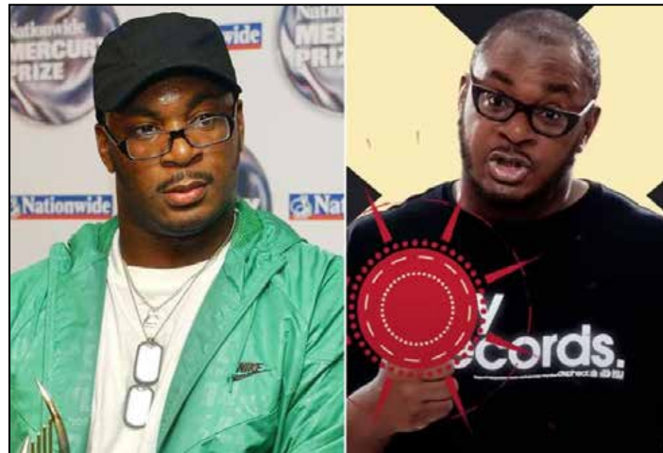
Born Ben Chijioke in London to Nigerian parents, Ty's most recent work was A Work of Heart , released in 2018,