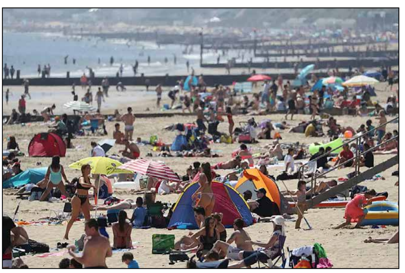
LOCKDOWN'S A BEACH: the scene at Bournemouth this week

"We've had days where we've had over 300,000 people come down here," he said.