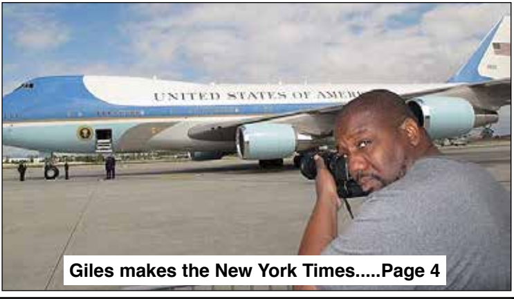
California's British Accent <sup>™</sup> - Since 1984