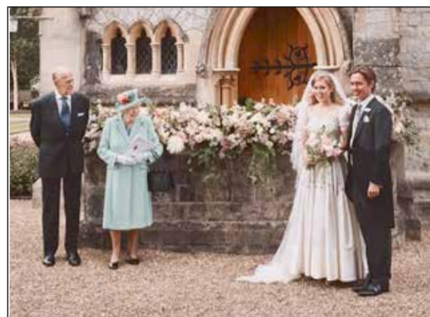
The royals observing social distanced photography