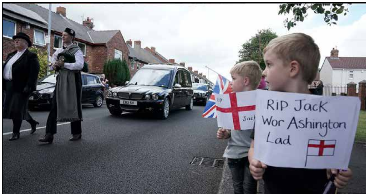
BACK TO HIS ROOTS: the funeral cortege passed by Jackie's childhood home on Beatrice Street

"Was it relief that the hopes of a nation had