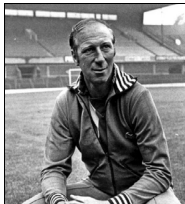
ONE OF A KIND: Jack Charlton was lauded this week as "a proud Englishman, a proud northerner and a proud honorary Irishman".

"Jack was incredibly proud of his hometown, which is why we made the decision to take the cont. on page 4, col. 1