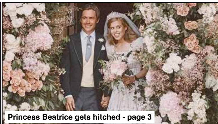
Princess Beatrice gets hitched - page 3

California's British Accent™ - Since 1984