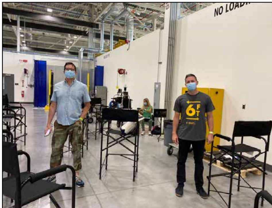
THE NEW NORMAL: Crew are adapting and life goes on

about testing and epidemiologists about the disease itself. I booked a few small jobs as a Covid-19 compliance officer to test out my new model and staying well within the guidelines, I was happy to report that it worked.