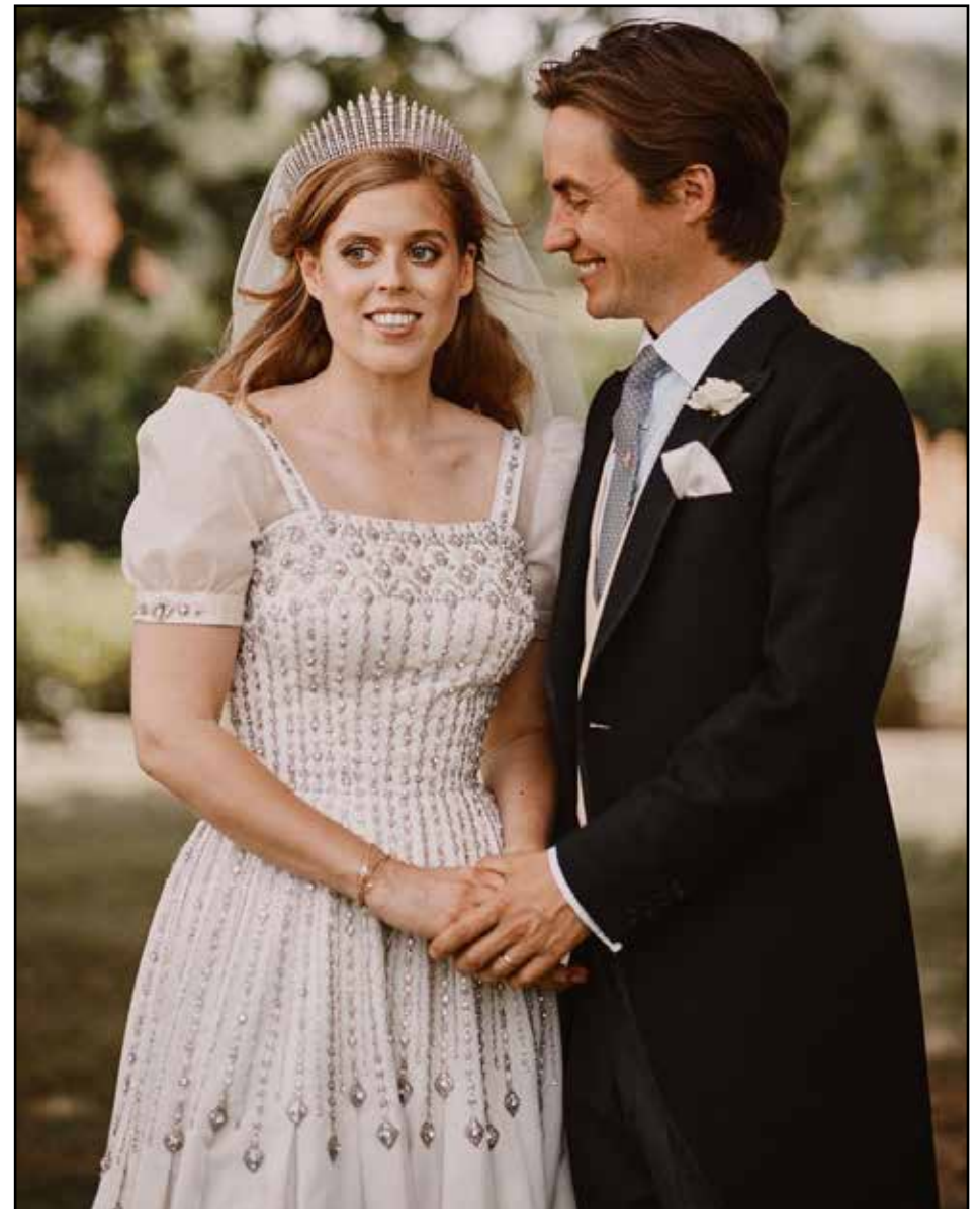
Prince Beatrice Edoardo Mapelli Mozzi after the ceremony in Windsor. The families of the couple have known one another for many years

In addition to Cummings's stanzas, Shakespeare's Sonnet 116, which begins "Let me not to the marriage of true minds" and St. Paul's first letter to the Corinthians, chapter 13, verses 1-13, were also read. Conspicuously absent from the pictures was the bride's father, Prince Andrew, 60, who has quit royal duties over his friendship with the late US paedophile Jeffrey Epstein, although he did attend the service