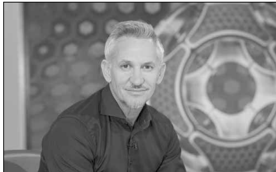
THAT'S RICH: even with a £400,000 pay cut, Match of the Day host Gary Lineker will still trouser £1.35m next year

"I have no plans to reverse that decision and support where we are at