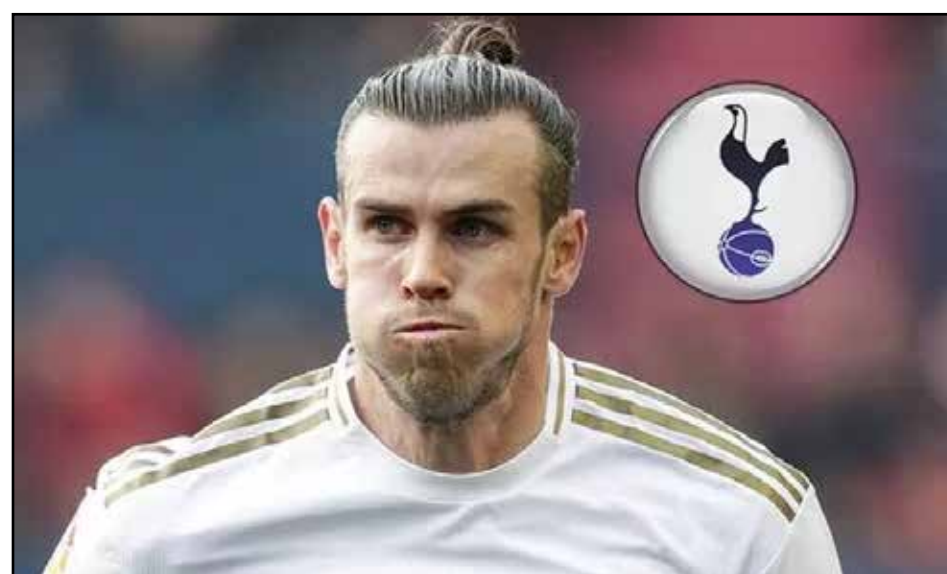
RETURN OF A LEGEND: Gareth Bale left Spurs for Real Madrid in 2013