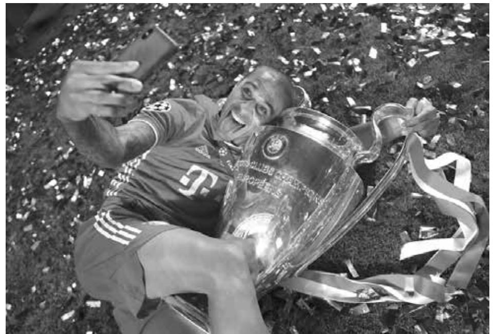
WINNER: Thiago Alcantara enjoyed a glittering spell at Bayern Munich

Man of the match Salah had the final word, however, after that reckless late challenge from Rodrigo.