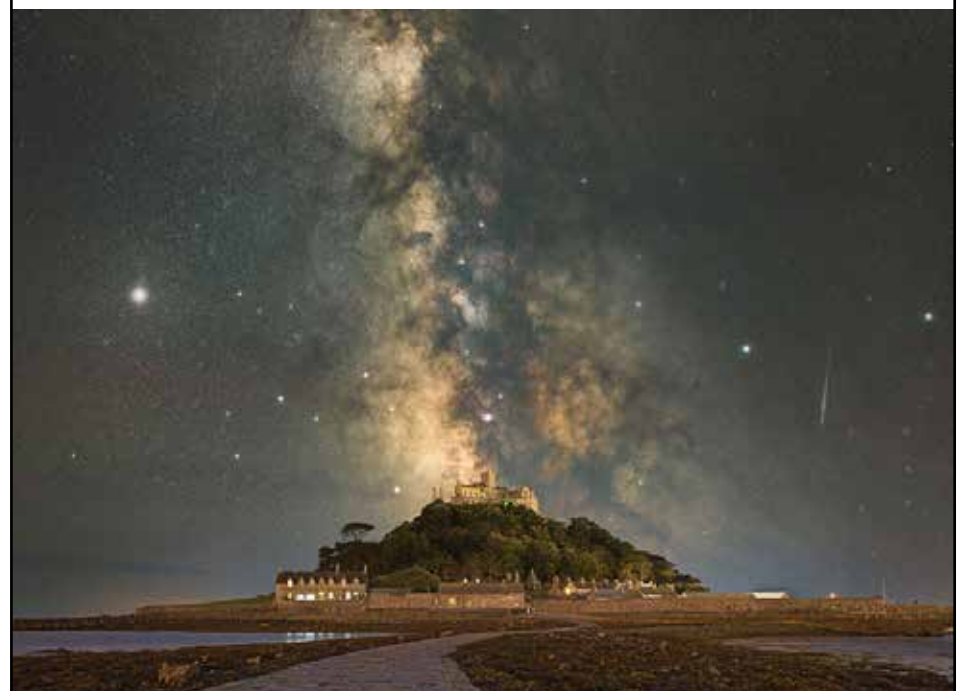
IT looks like steam rising from a volcano, but this is St Michael's Mount near Penzance in Cornwall.