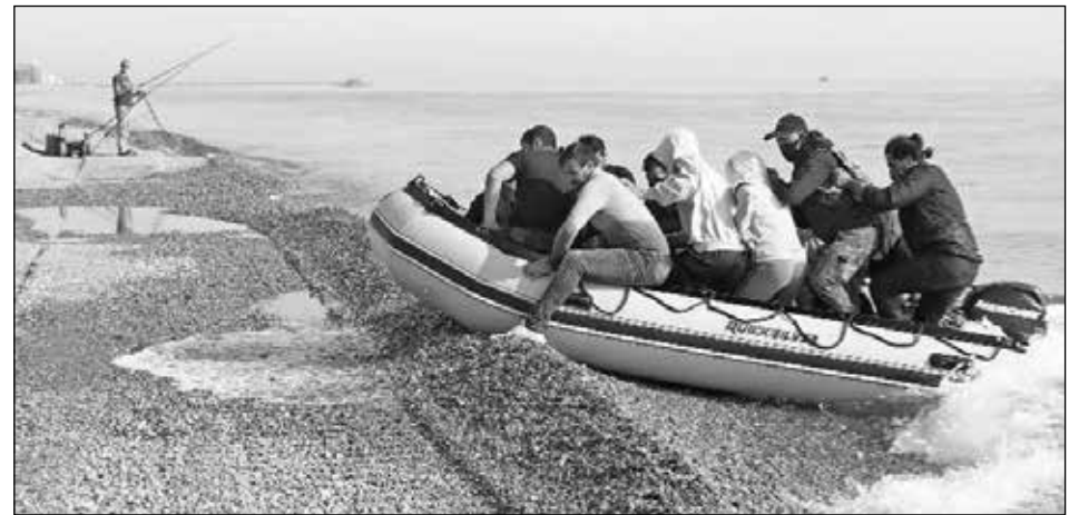
SOFT LANDING: a dozen migrants come ashore at Dover this week

The Government has limited scope for action until the Brexit transition