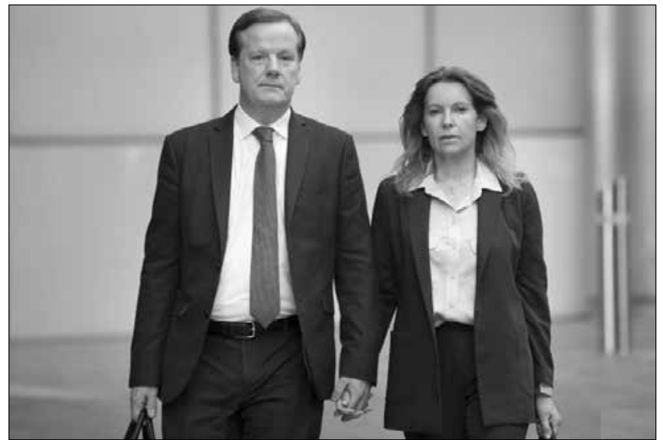
A lonely walk of shame... Elphicke arrived at court alone before being jailed for two years. His wife Natalie, above, left him after hearing the evidence

Elphicke's daughter, 20, is now estranged from him and his teenage