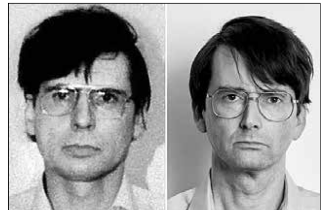
CHILLING... David Tennant (right) became "psychologically enthralled" playing serial killer Dennis Nilsen

Asked about the psychological consequences of the part, Doctor Who star David