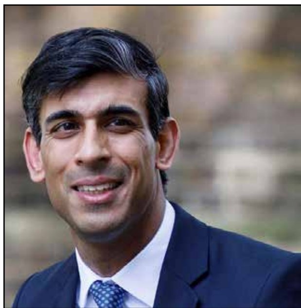
OUTLOOK GLOOMY: Chancellor Rishi Sunak

gloomy figures, Mr Sunak said: "I've said before that hard times were ahead, and today's figures confirm that hard times are here."