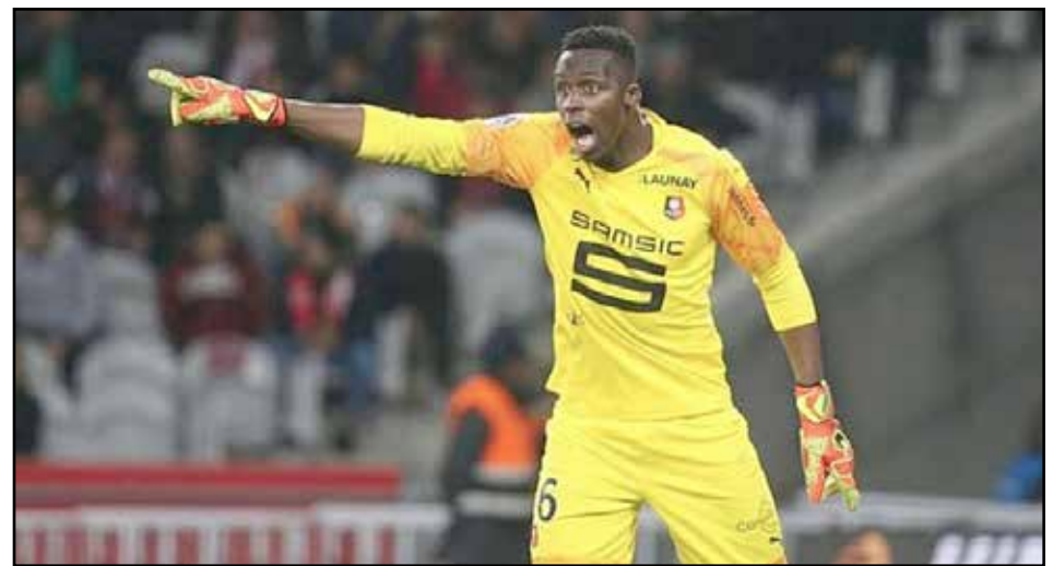
MENDY ON CHELSEA: "It's a dream for me to be a part of this exciting squad."

However, Kepa's passing accuracy was 79.7% compared to