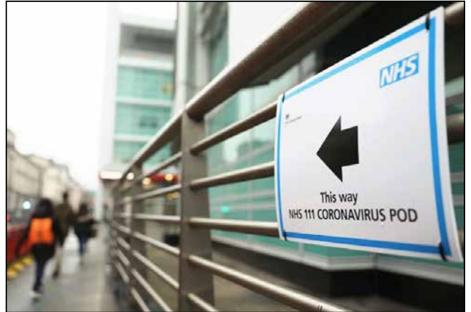
BAD NEWS AHEAD: Wednesday's new infection rate is the highest on record

"This is to be regretted. Trends in the seven day averages may be a more reliable guide to trends. The ONS sampling series