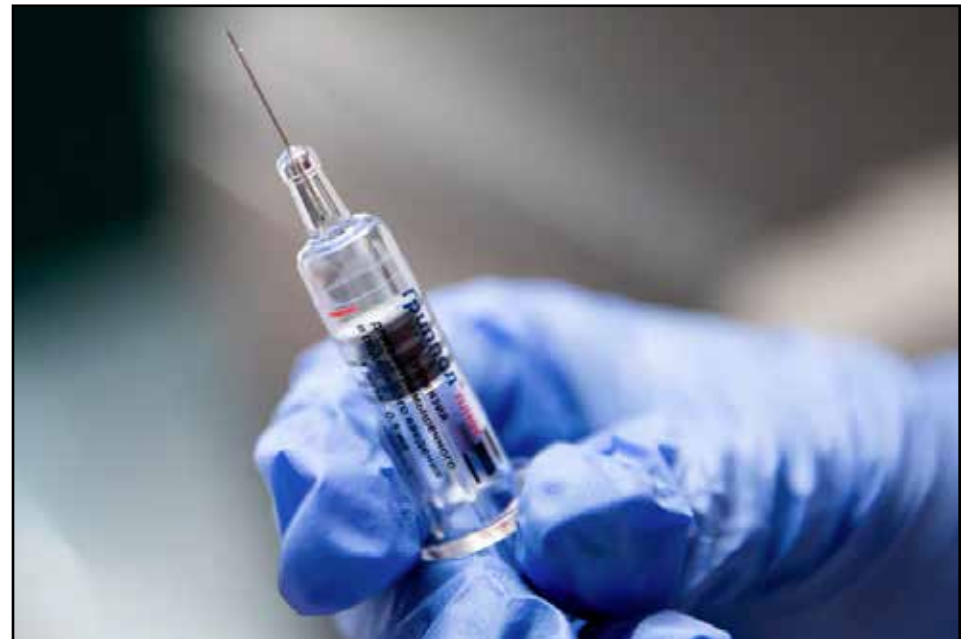
SHARP END: the UK will has capacity to vaccinate 30m people this year