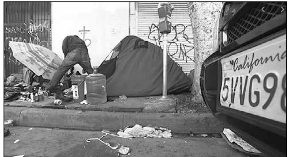
HERE, THERE AND EVERYWHERE: more than half the country's unsheltered homeless can be found in California

Some were low-wage workers who lost their jobs or needed expensive medical care. Others are victims of domestic violence or sexual abuse. Far too many are LGBTQ youth being turned out of their homes by their so-called loving parents. Many