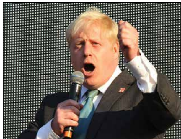
JOHNSON: unveiling new restrictions in England this week aimed at curbing a second wave

poll this week showed 78 per cent of people quizzed backed the new measures.