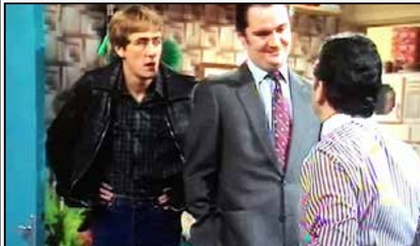
Guest star: Broadbent had a recurring role as corrupt policeman Roy Slater in the BBC sitcom

He also starred as Horace Slughorn in the Harry Potter film series, and in fantasy TV series Game of Thrones .