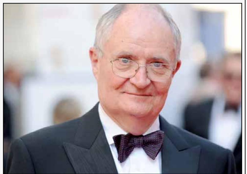
Tall Order: "I was probably too tall for a start and the Jack the Lad character was not quite my style," said Broadbent of the Del Boy role

"As it turned out, David Jason was perfect