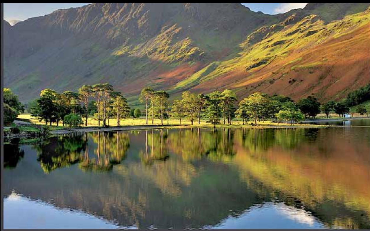
WELCOME ISOLATION: autumn's colors were in on full display at Lake Buttermere in Cumbria's Lake District this week