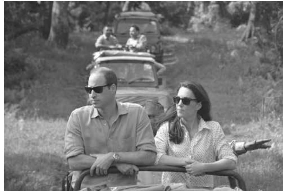
WILLIAM WITH KATE ON SAFARI: "I feel it is my duty and our collective responsibility to leave our planet in a stronger position for our children"

The father of Prince George, seven, Princess Charlotte, five, and Prince Louis, two, adds: "I feel it is my duty and our collective responsibility to leave our planet in a stronger