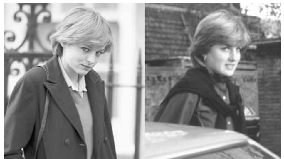
Emma Corrin as Princess Diana in her early years

The intrusion of the paparazzi is also highlighted in Netflix's fourth season of the drama charting the decades-long reign of