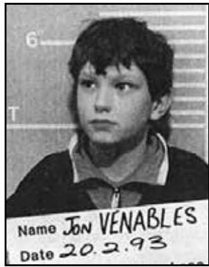
Venables: child abuser