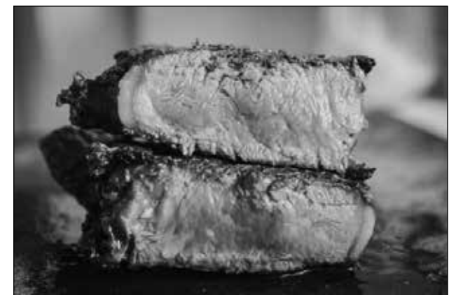
The 1996 ban on British beef was lifted in March

The first shipment of beef originating from Foyle Food Group, Foyle Campsie in Northern