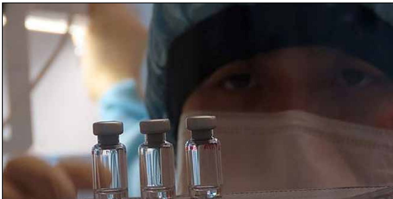
NOT THERE YET: "We simply don't know when an effective vaccine will be available, how effective it will be and of course, crucially, how quickly it can be distributed."

There are questions around raw materials - both for the vaccine and glass vials - and