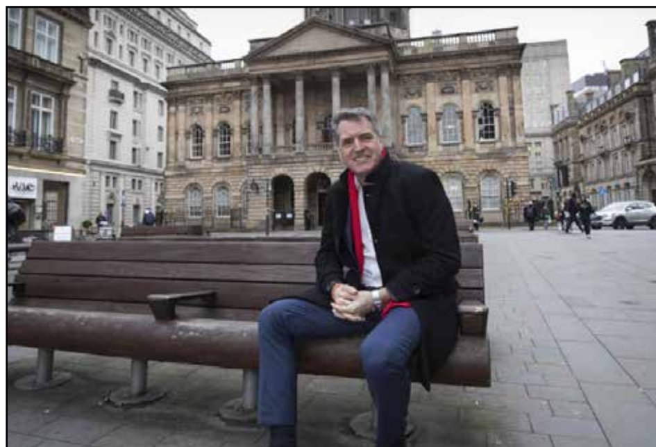
Liverpool mayor Steve Rotheram said the north could not be a 'petri dish'