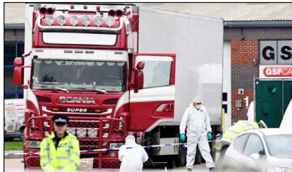
39 migrants were found dead inside the lorry last year