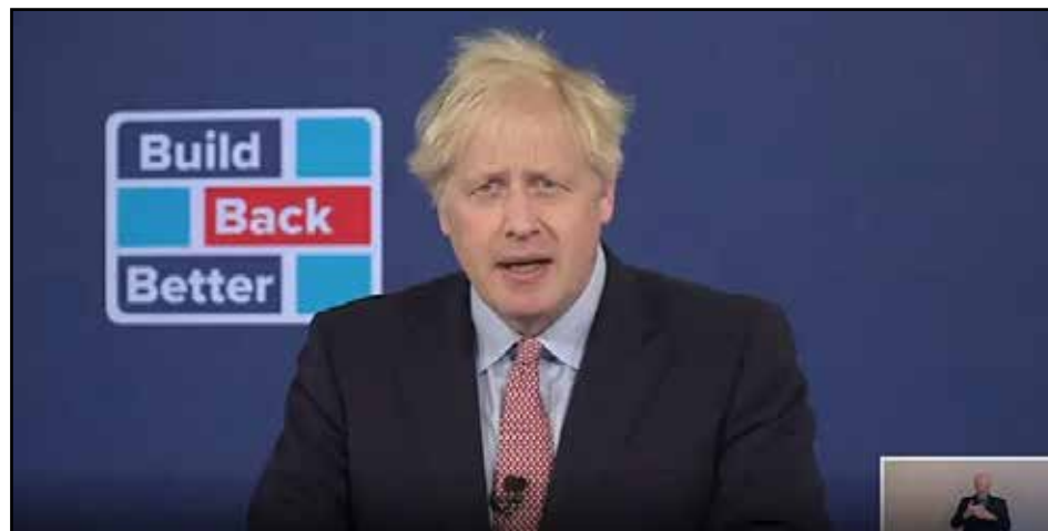
The prime minister faces a battle with his backbenchers over the restrictions