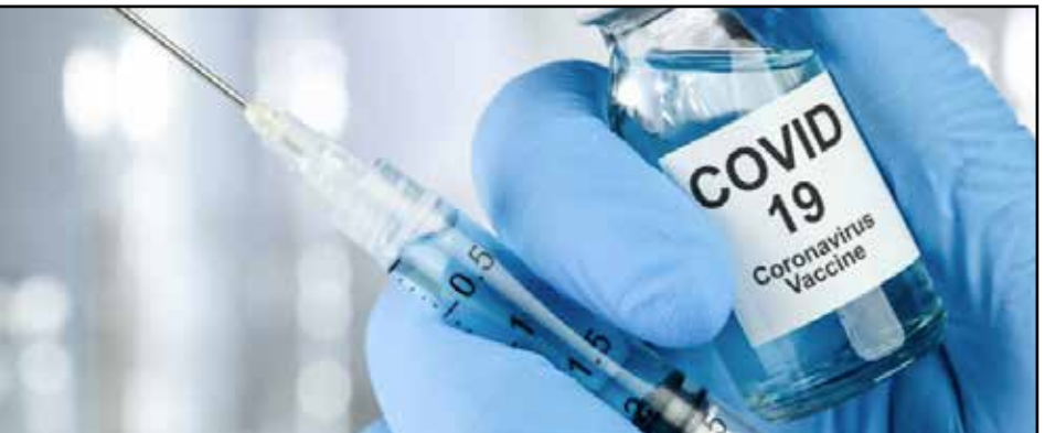
PROGRESS? The Oxford vaccine is currently in phase three clinical trials

The neighbouring areas of South Yorkshire, Greater Manchester and Lancashire are already under tier three restrictions, as well as the Liverpool City Region and Warrington. goes Nottinghamshire tier three from into Friday.