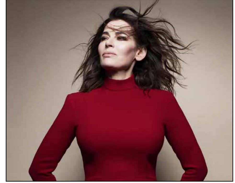
NIGELLA LAWSON: gracing Good Housekeeping's latest cover.

in the timetable. cliched and like having